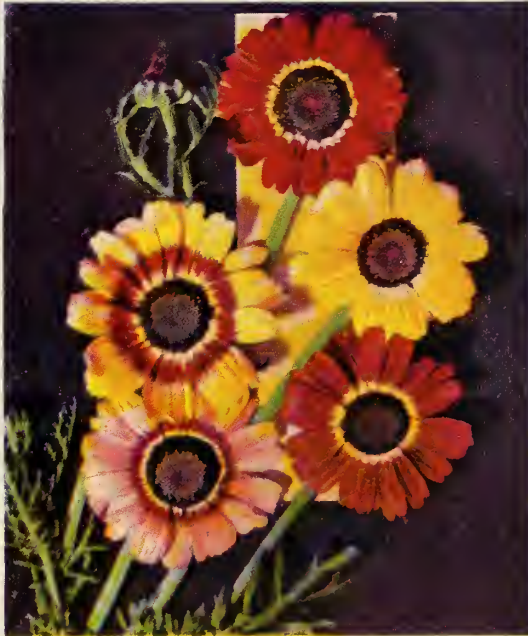
PAINTED DAISY MERRY MIXTURE