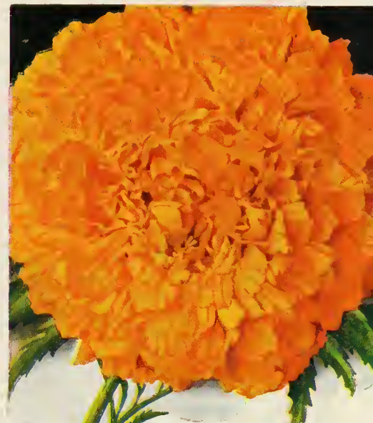
MARIGOLD SUNSET GIANTS