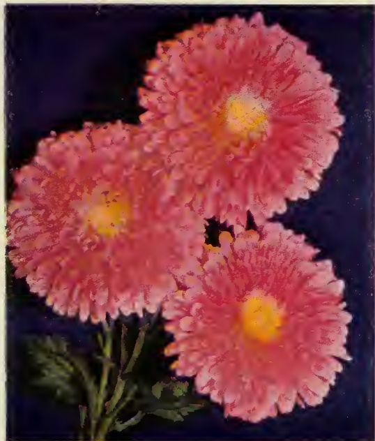
ASTER PRINCESS LINDA

2238 California Sunshine Mixed. Brilliant rose, flesh, violet, white, etc. 1/8 oz. 75c; Pkt. 25c; 3 for 60c