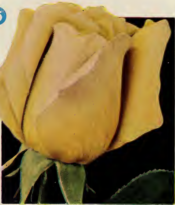
MME. CHIANG KAI SHEK

GERMAIN'S 79 TH Anniversary Offer Top Value Collection One each of the following varieties (for description see other rose pages): Autumn, Contrast, Girona, Hadley, Mrs. P. S. DuPont and Pink Dawn. (A $6.00 value) ..... $5.49 NR147