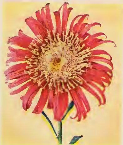
CALIFORNIA SUNSHINE ASTERS

2240 New California Giants. Super-fine mixed! 1/8 oz. 75c; Pkt. 25c; 3 for 60c