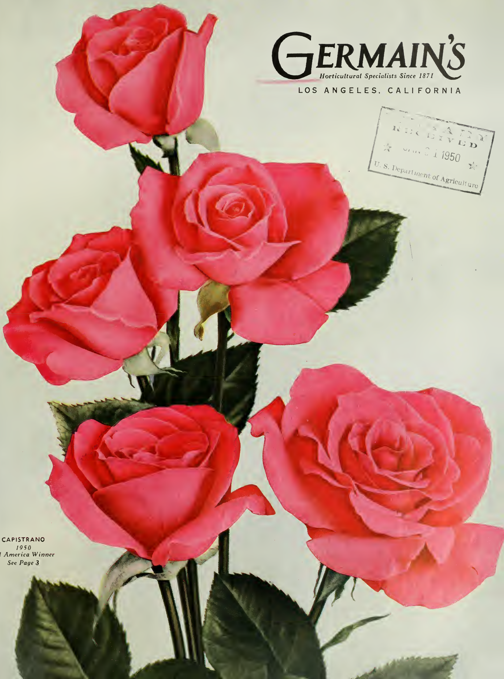
CAPISTRANO 1950 All America Winner See Page 3

LIBRARY RECEIVED ★ JUN 21 1950 ★ U. S. Department of Agriculture