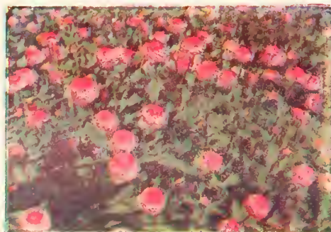
MAMMOTH "CUT-AND-COME-AGAIN" ZINNIAS