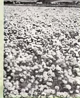
Field-View at Seed Ranches where Germain's Fine Flower Seeds are grown.