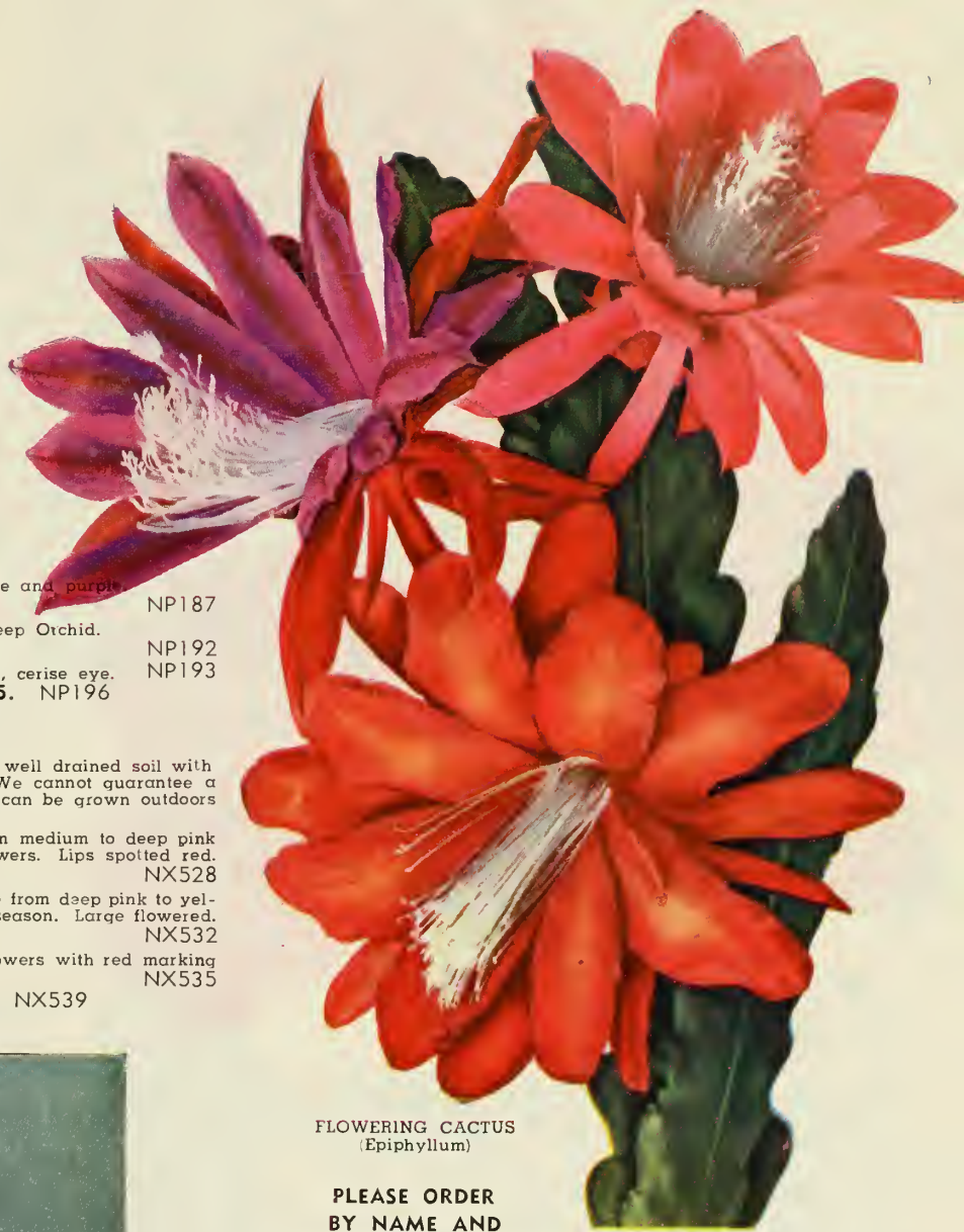
FLOWERING CACTUS (Epiphyllum)

Any of the above $6.00 each. Collection of six $32.50. NX539