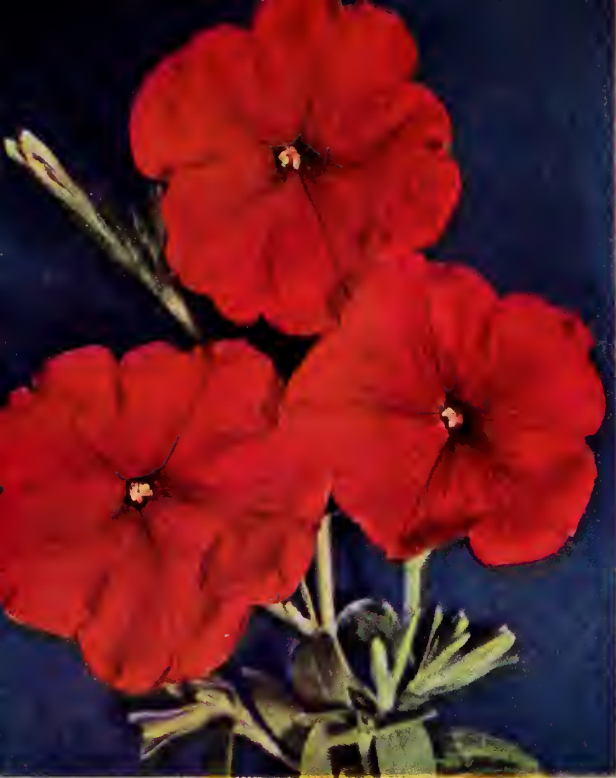
NEW ALL AMERICA PETUNIA FIRE CHIEF

Leading Strains - Novelties - Specialties