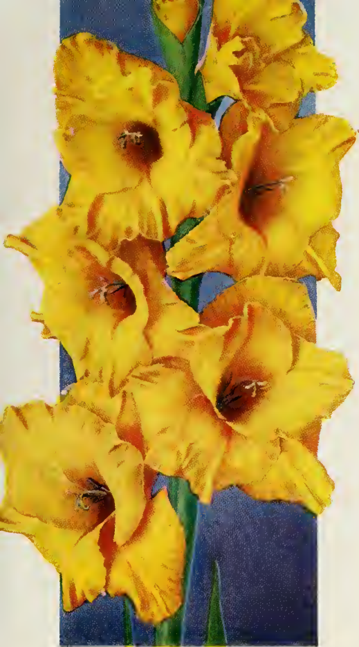
CLOTH OF GOLD