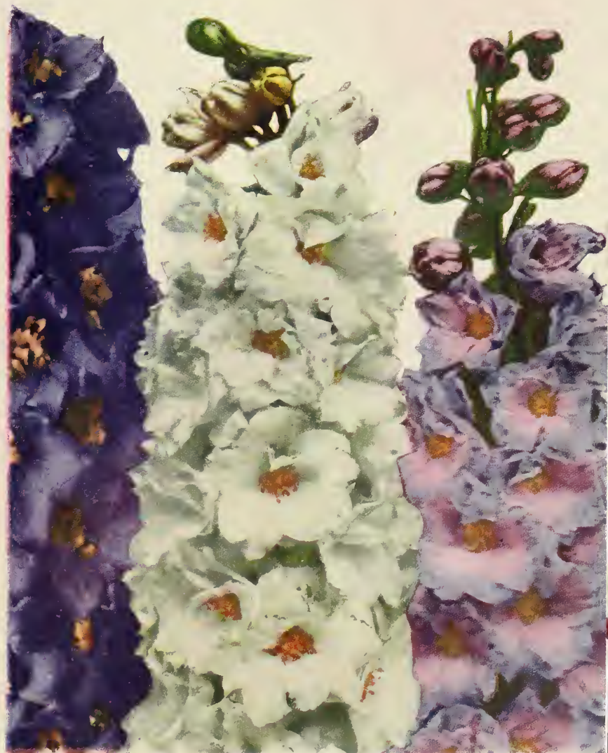
PACIFIC GIANT DELPHINIUM