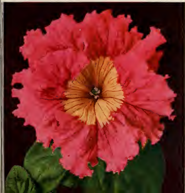
PETUNIA GIANTS OF CALIFORNIA