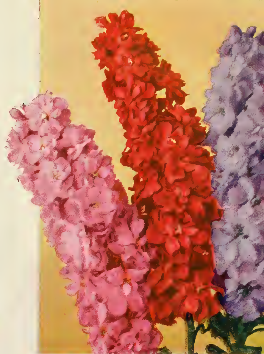
STOCKS GIANT IMPERIAL