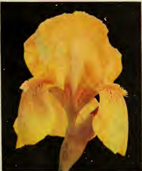
CLOTH OF GOLD