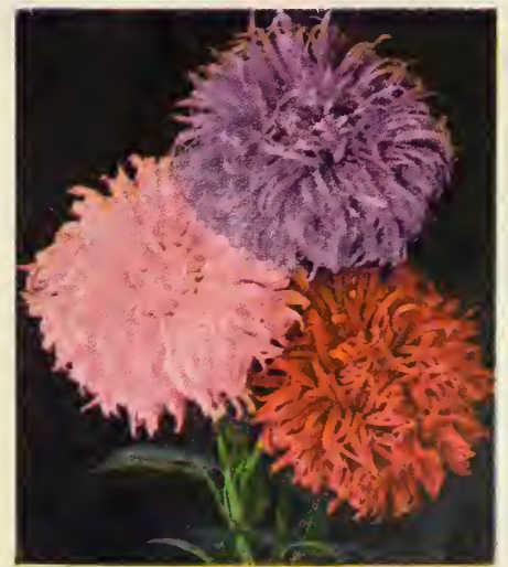
ASTER—EARLY CALIFORNIA GIANTS