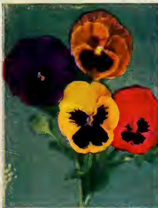
SWISS GIANT PANSY