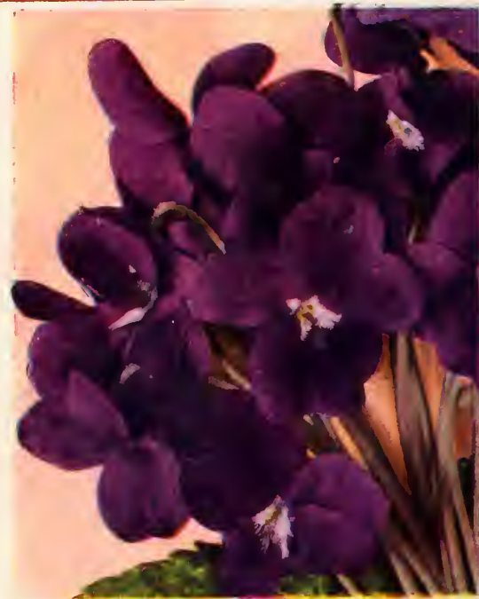
VIOLET ROYAL ROBE

Collection of one each of the above varieties, $1.75, Postpaid. NP029