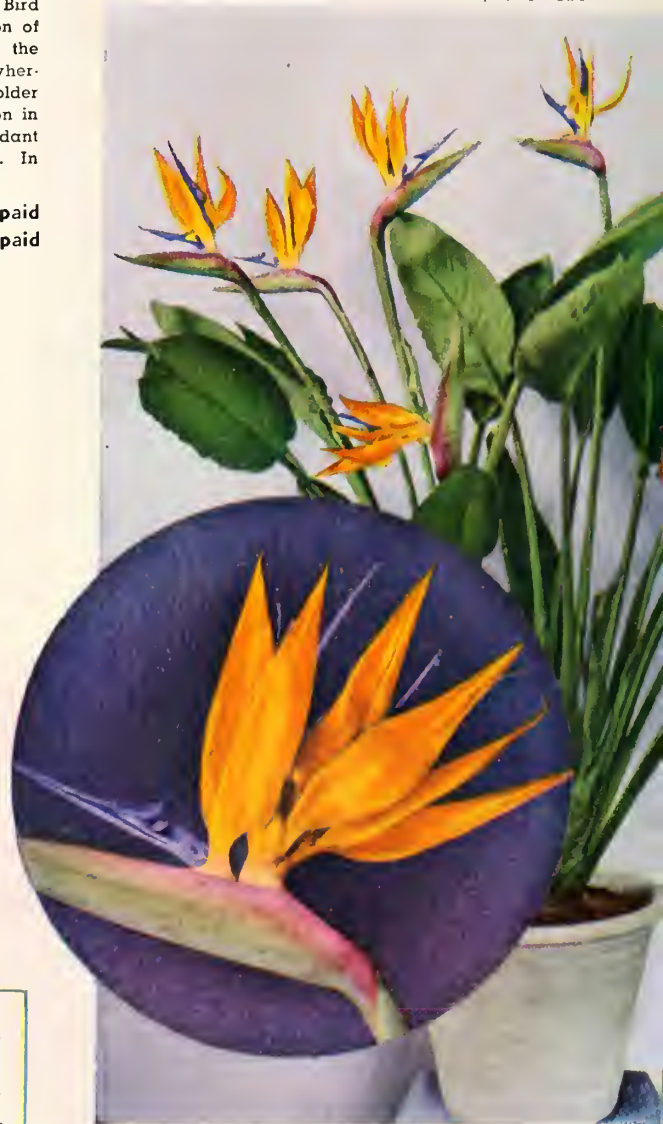
STRELITZIA REGINAE, "BIRD OF PARADISE"