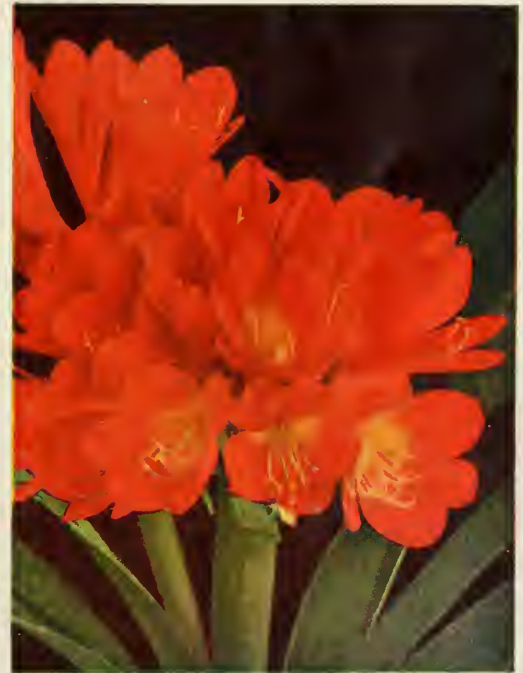
NEW HYBRID CLIVIA