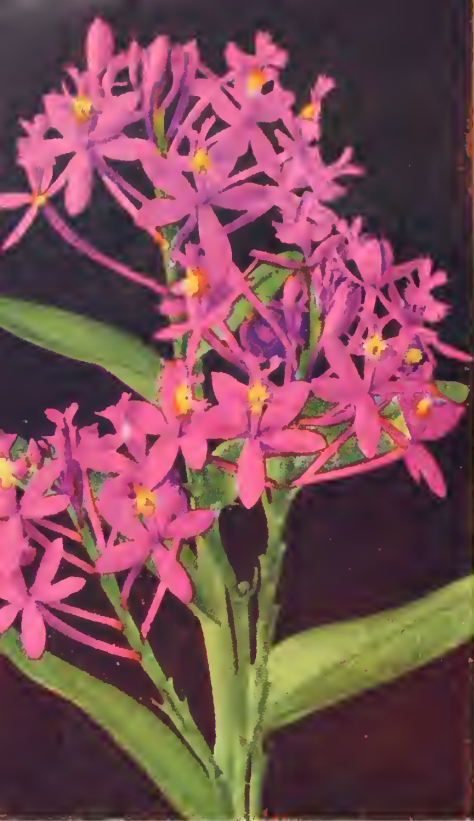
LAVENDER BEAUTY EPIDENDRUM