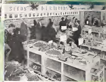
View of Salesroom at one of Germain's Stores.