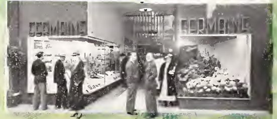
Entrance to Germain's Los Angeles Store