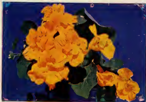
DOUBLE GLEAM NASTURTIUM