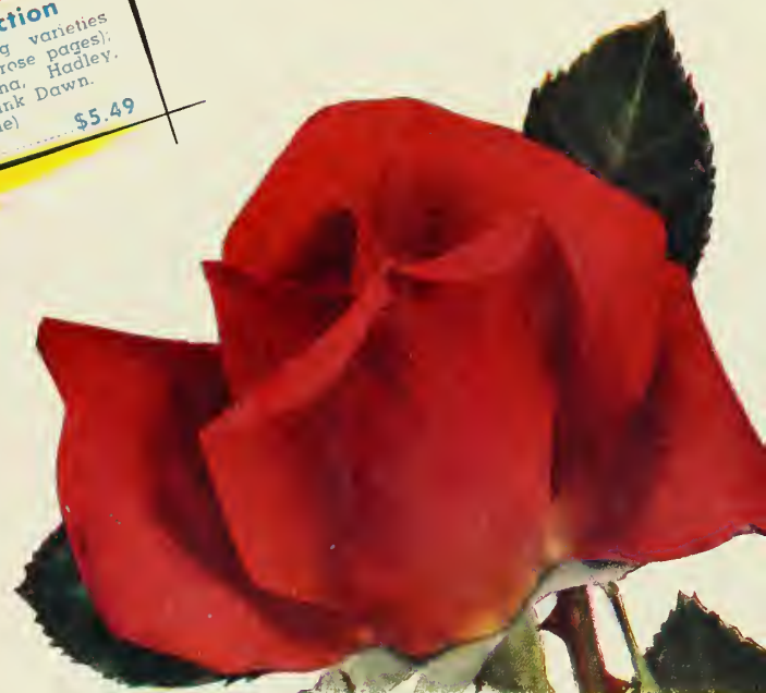
GRAND DUCHESS CHARLOTTE