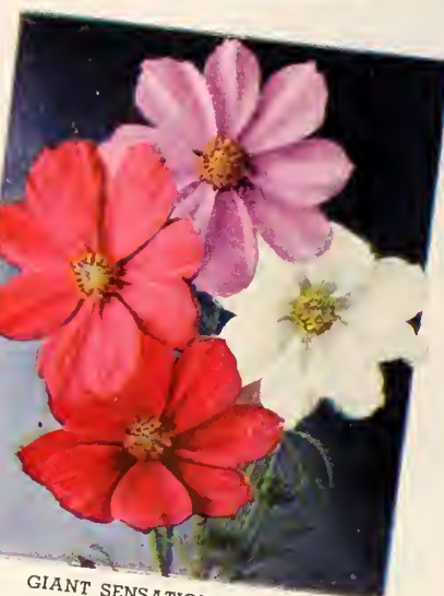
GIANT SENSATION COSMOS