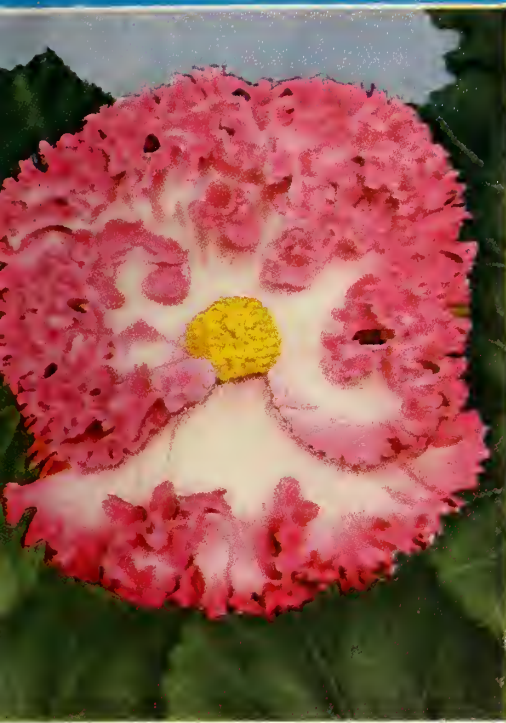
CRISPA OR SINGLE FRILLED