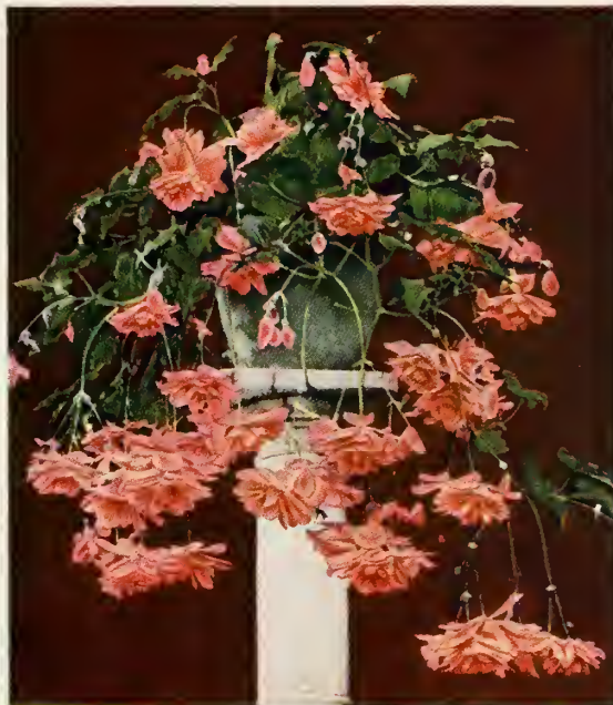
HANGING BASKET OR LLODII

5099 COLLECTION. One large bulb of each variety listed above, 7 bulbs in all. $1.89