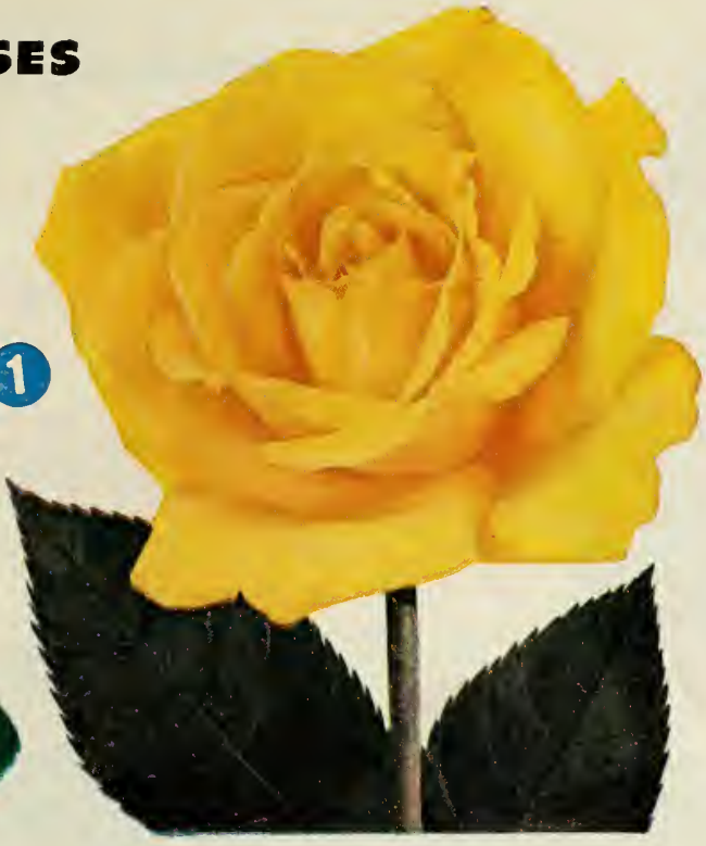
SAN LUIS REY