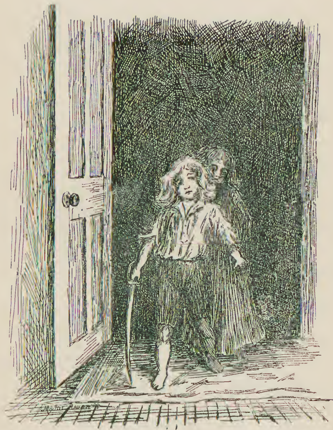
HE MADE A PRETTY PICTURE—ALERT AND QUITE FEARLESS.