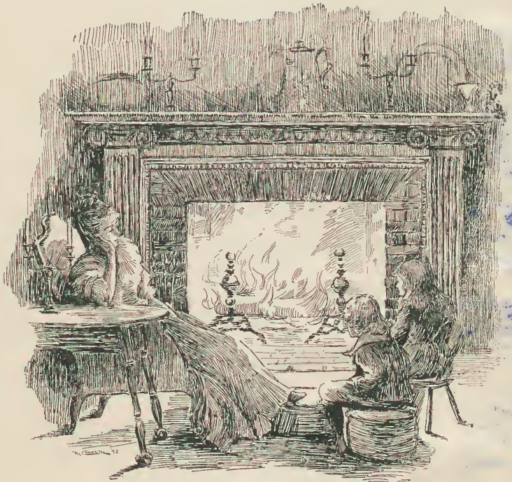
A SILENT GROUP ABOUT THE HEARTH.