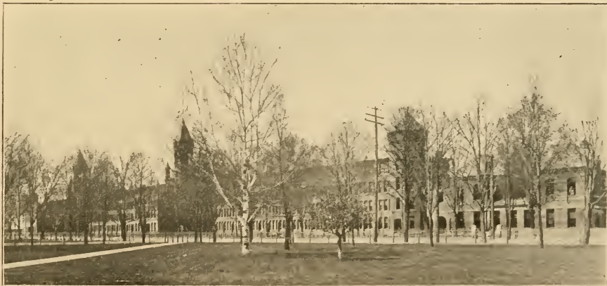
American Waltham Watch Factory — 3300 Employees

Born in Berlin, Conn., March 10, 1824. Died at Pride's Crossing, July 22, 1902.