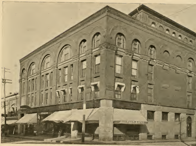
A. O. U. W. Building.