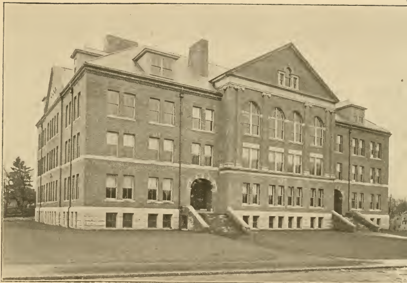
Our New High School.