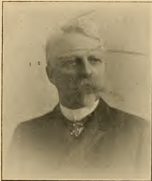
HON. MURRAY D. CLEMENT, Mayor of Waltham.