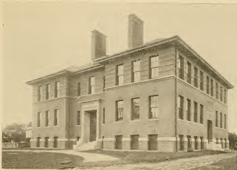
Royal E. Robbins School.