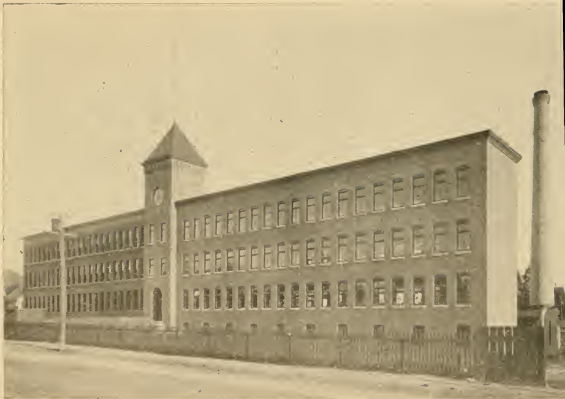
The United States Watch Factory.