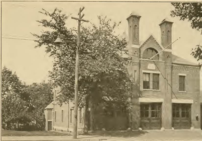
Moody Street Fire Station.