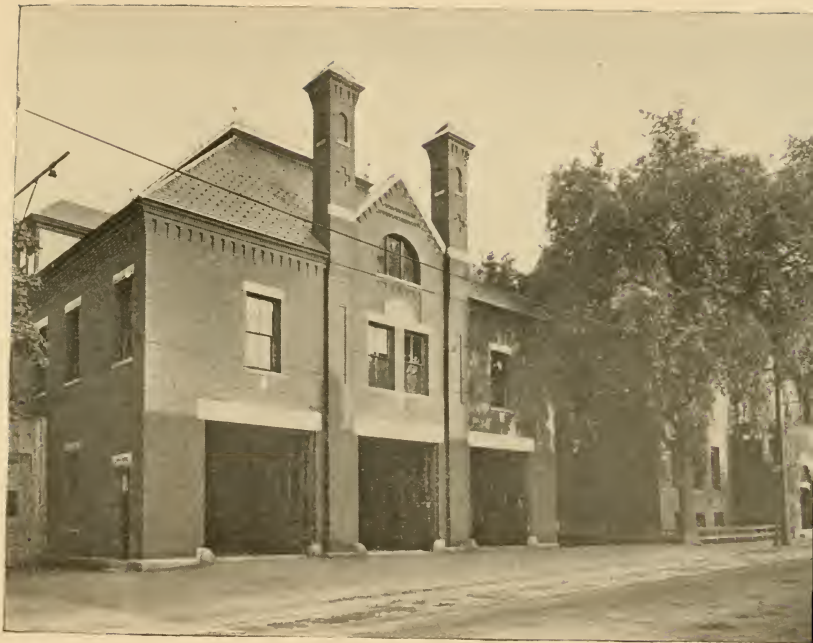
Central Fire Station.