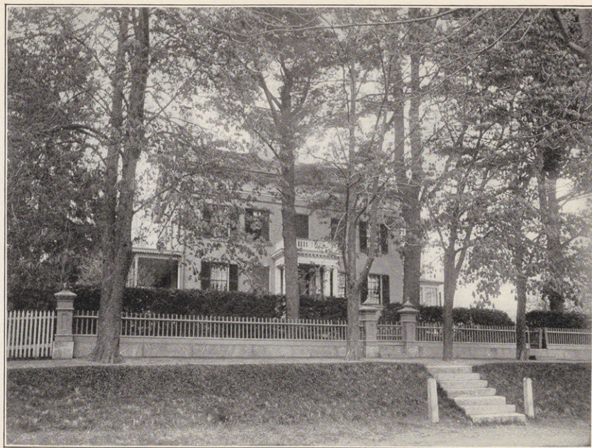
THE DICKINSON HOUSE, AMHERST, MASSACHUSETTS