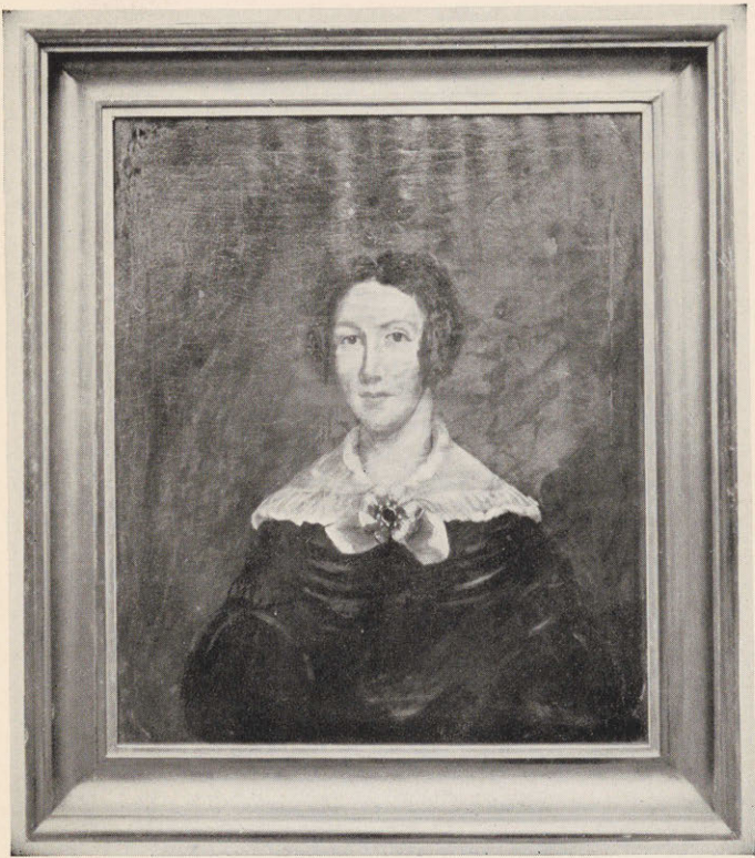
EMILY NORCROSS DICKINSON