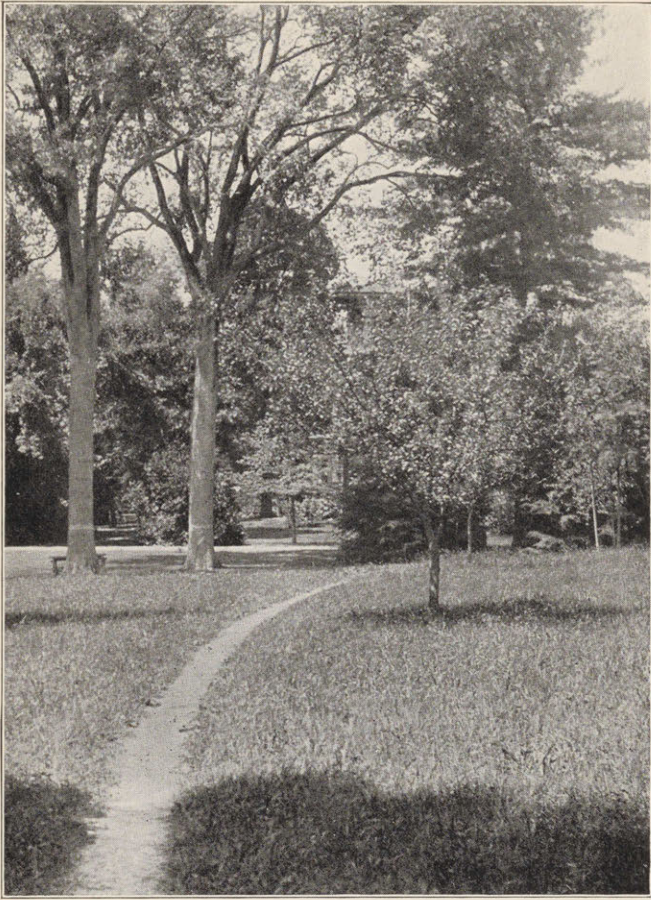
“A LITTLE PATH JUST WIDE ENOUGH FOR TWO WHO LOVE” — E. D.