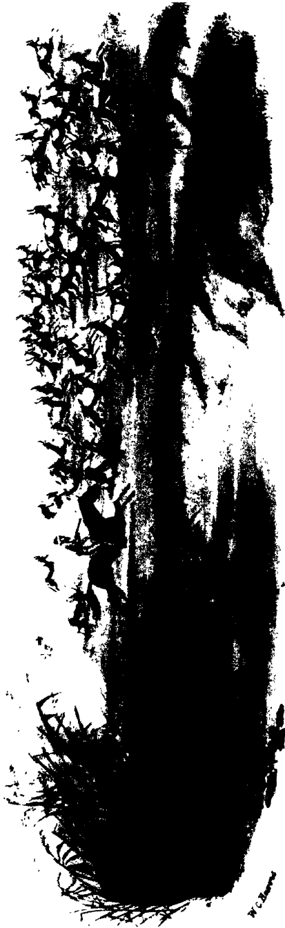
HUNTING THE BLEBECK