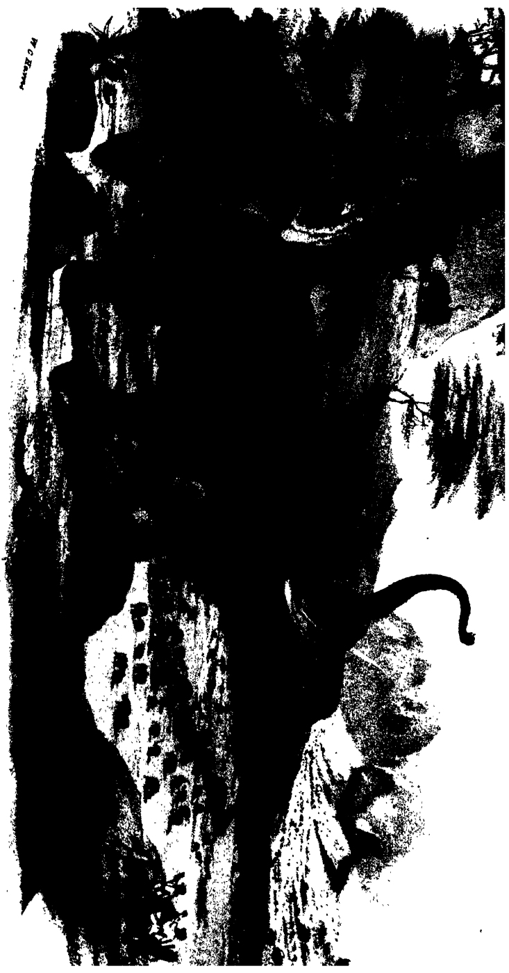
HUNTING THE WILD ELEPHANT