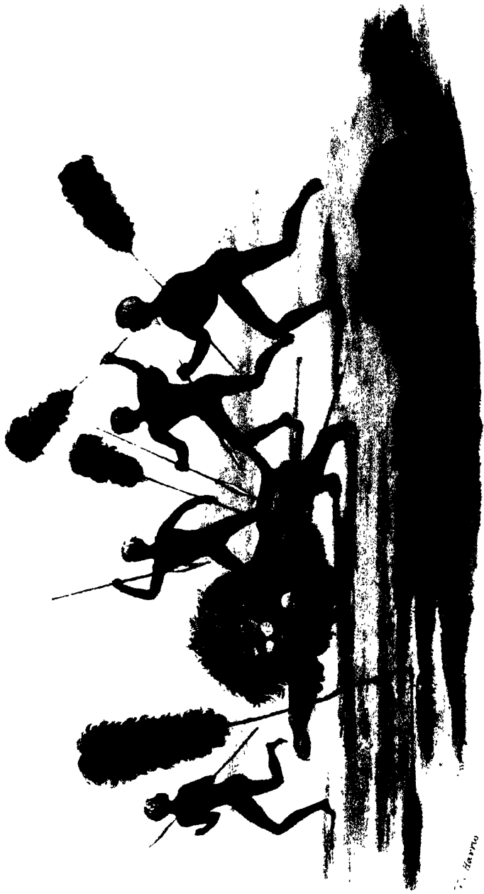
BECHUANA HUNTING THE LICH