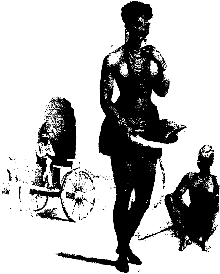
FRUEY, THE OPIQUA MAN