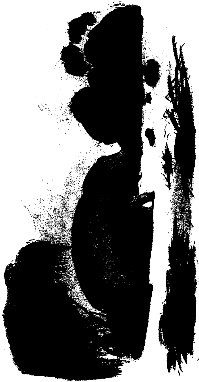
SHOOTING THE HIPPOPOTAMUS