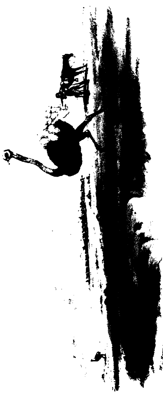
HUNTING THE OSTIEN