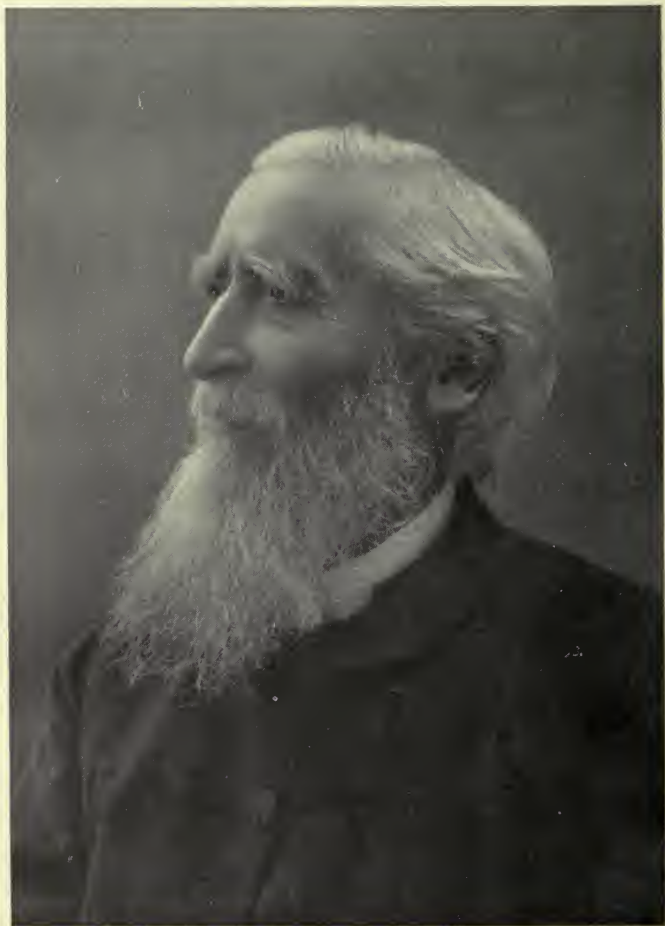
From a photograph