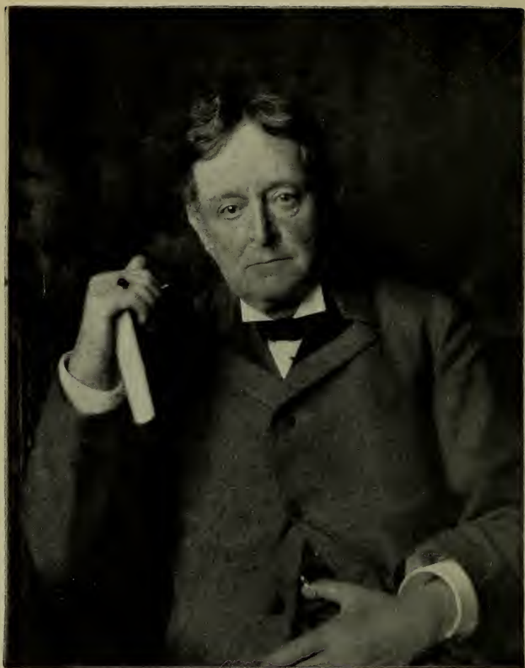
Joseph H. Choate