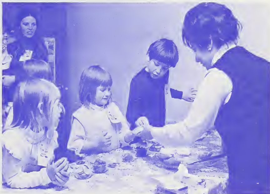
An Iowa State University nutritionist distributes the raw materials for a group of children as they make happy face sandwiches.

A lot of work and a lot of time, but 2,500 people know just a little more about selecting and preparing food from the basic four food groups, and can make better sense of the 1974 consumer market. □