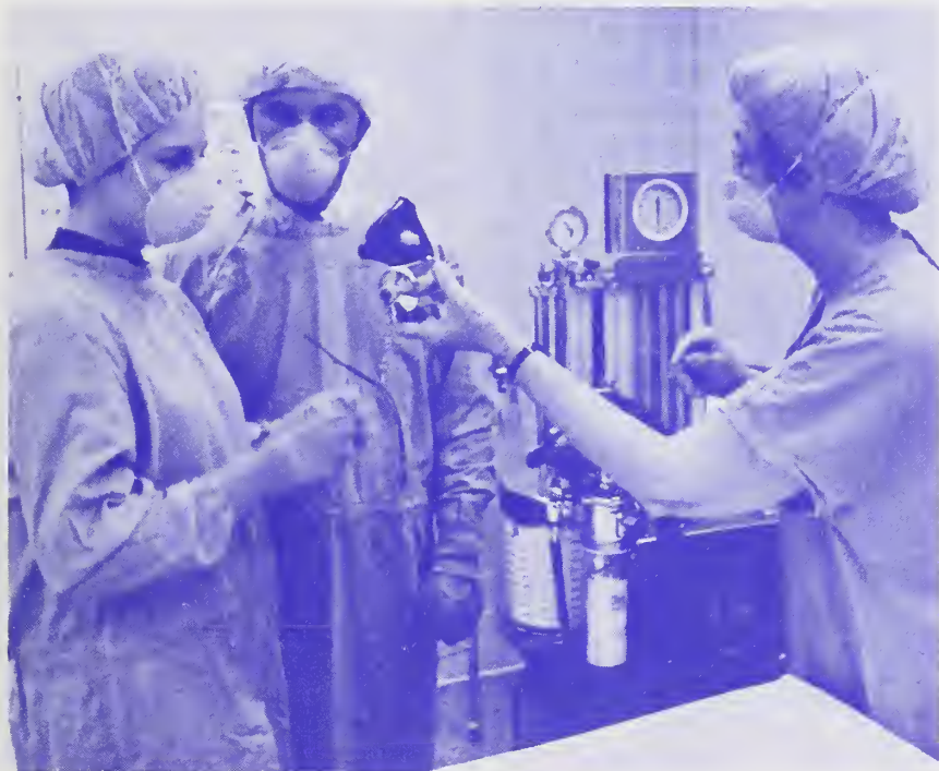
Equipment in the delivery room is explained to this couple in the expectant parents class by a nurse.