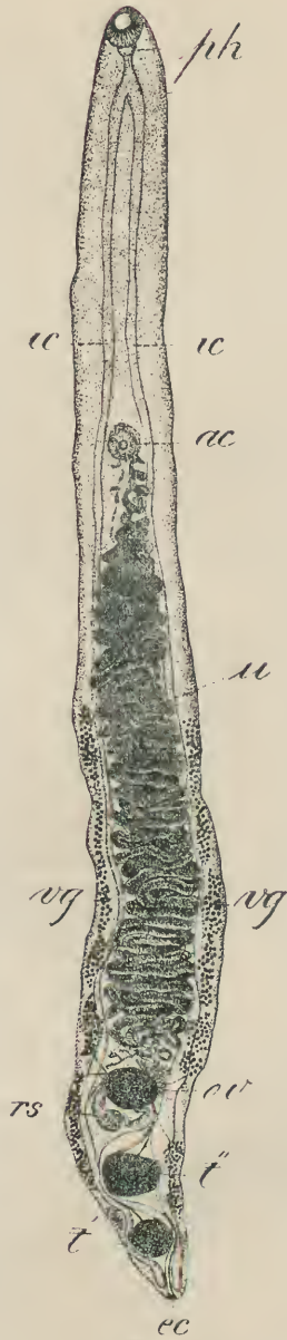
FIG. 2. Original type-figure of D. longissimum corvinum . After Stiles & Hassall, 1894, Note 21, Fig. 17.