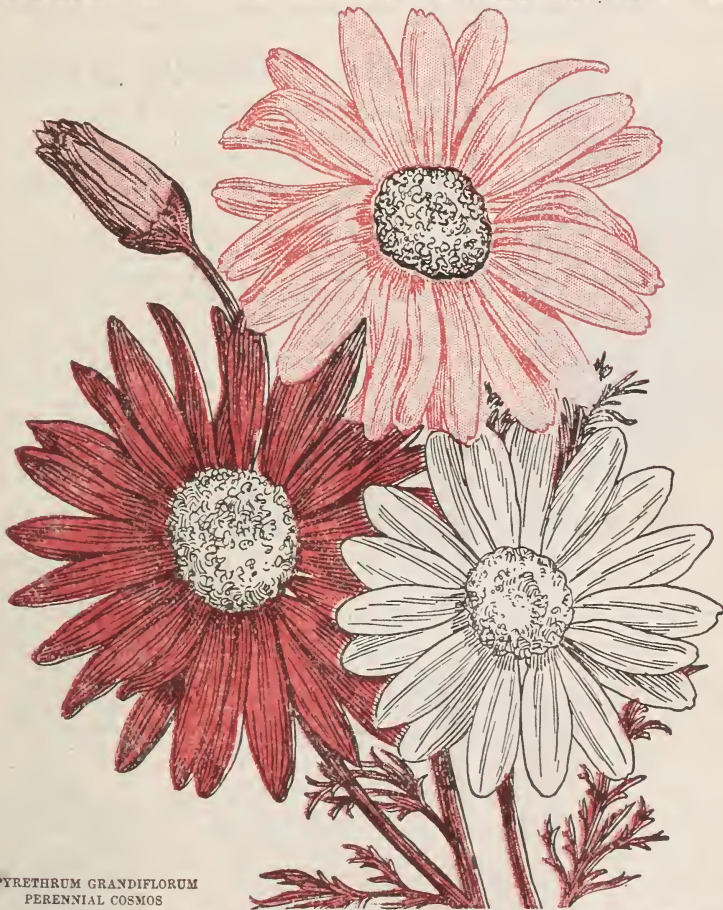
PYRETHRUM GRANDIFLORUM PERENNIAL COSMOS

Vol. XLVIII, No. 8. LA PARK, PA., AUGUST, 1912. 1 Year 10 Cts. Established 1871. 6 Years 50 Cts.