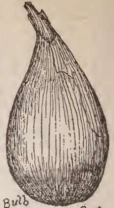
Bulb of Buttercup Oxalis.

A LIBERAL PREMIUM--- PARK'S FLORAL MAGAZINE a year and seeds enough for your flower garden or your vegetable garden, 15 cents, or for both gardens, 25 cents. Each collection contains 10 pkts. of seeds of the finest flowers and vegetables. See lists on last page of June Magazine.