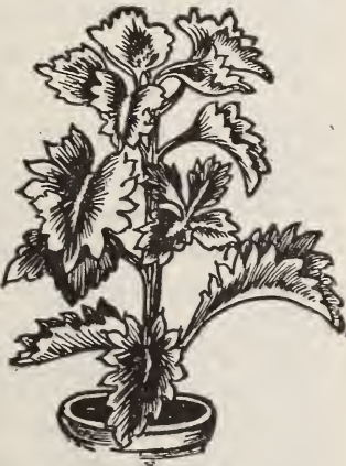
COLEUS PLANT FROM SEED.

L AST SUMMER I bought several packets of Coleus seeds, and as I never have had any trouble raising them, I commenced making room for at least 300 or 400 plants. I later found I had over 750, and such gorgeous colors and varieties you never saw. I disposed of a large number of these plants, and as I left home for a month's stay in the mountains, my remaining Coleus went to seed and became enormous. I noticed later in the fall that numerous small ones were coming up from the newly dropped seeds, but as soon as real winter came they, of course, died. The Coleus bed was then heavily covered with stable manure, for I had planned this for my Chrysanthemum bed the following spring, so all through our hard, cold winter this compost was rotting and settling down. As soon as spring came I had this entire bed spaded under and soon had my Chrysanthemums planted. One day while working about this bed, I spied a very familiar, very tiny plant under a Chrysanthemum. It did not take me