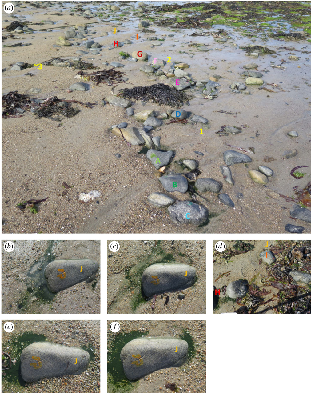
Figure 1. The boulders used for sampling. (a) An overview of all 10 individually marked boulders (A–J) on the beach on 13 June 2017, 112 min after low tide; the letter colours correspond to the colour of the varnish used to mark the respective boulder; the yellow numbers 1–3 indicate the positions of the observed circular mills; the patches of S. roscoffensis can be seen clearly around the proximate boulders, A–C, but all boulders had worm patches around them on each of the 5 days of observation. The five photographs of boulder J. (b) 10 June, 15.45 (95 min after low tide). (c) 11 June, 17.24 (164 min). (d) 12 June, 17.25 (125 min), boulder J was completely covered by seaweed and was not visible, it is in the area marked with J north of boulder I, which is in the field of view together with part of boulder H. (e) 13 June, 17.28 (98 min). (f) 14 June, 16.46 (26 min), note the difference between 13 and 14 June in the sand composition to the south of the boulder.

Over the 5 days, we observed altogether four circular mills. Numbers 1 and 2 were photographed and filmed on 10 June during the sampling of the transect between 15.00 and 15.45 close to boulders D and F, respectively (figure 2 a,b ; electronic supplementary material, videos S1 and S2). We encountered number 3 by chance on 14 June at 13.30 (before the sampling period from 16.30 to 16.45) approximately 2 m up the beach from boulder H (figure 2 c ) while collecting seawater and worms for another study and returned immediately to photograph and film it. The two twins in this mill (figure 2 c ; electronic supplementary