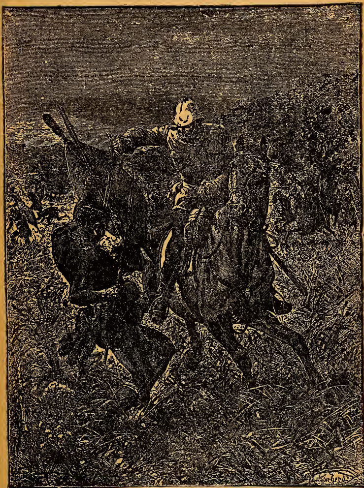
THE FLYING ZULUS WERE OUT DOWN IN SCORES.