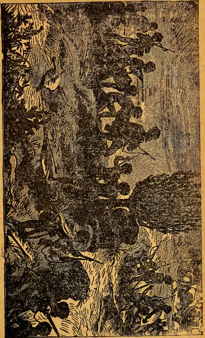
THE FIGHT AT THE MOUTH OF THE DEFILE.