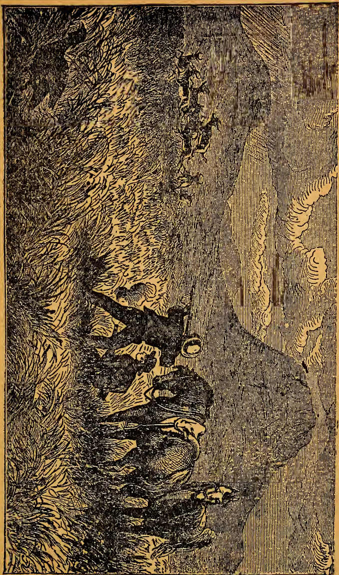
A GOOD SHOT.