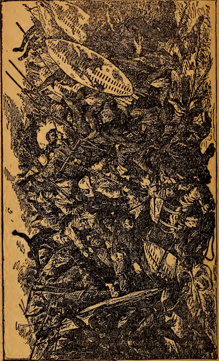
OTHERS, AGAIN, WHEN THEY FOUND THAT THEIR RETREAT WAS CUT OFF, HAD GATHERED IN GROUPS AND WERE FIGHTING DESPERATELY.