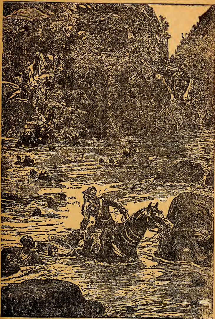
A FEW MANAGED TO SWIM ACROSS THE RIVER.