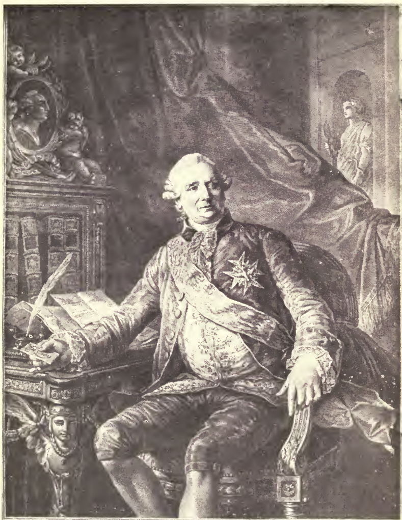
Charles Gravier Conseiller d'Etat Ordinaire, et Chef du Conseil