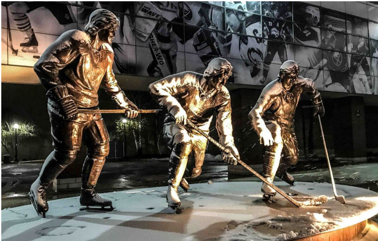
The bronze statue honoring French Connection linemates Gilbert Perreault, Rene Robert and Rick Martin outside of KeyBank Center.