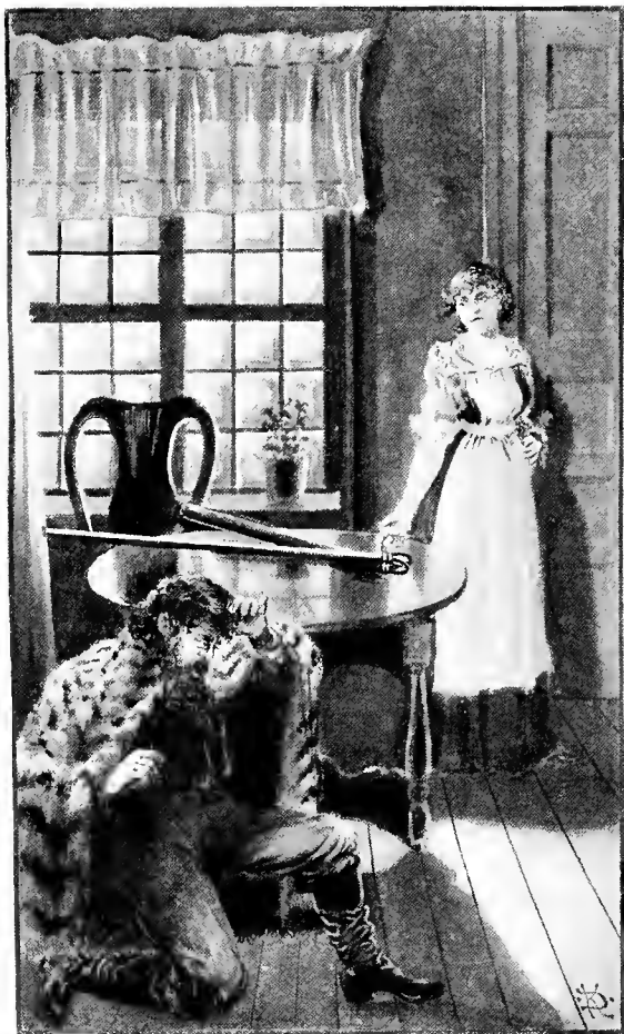
"The something is that flail!"—p. 212.