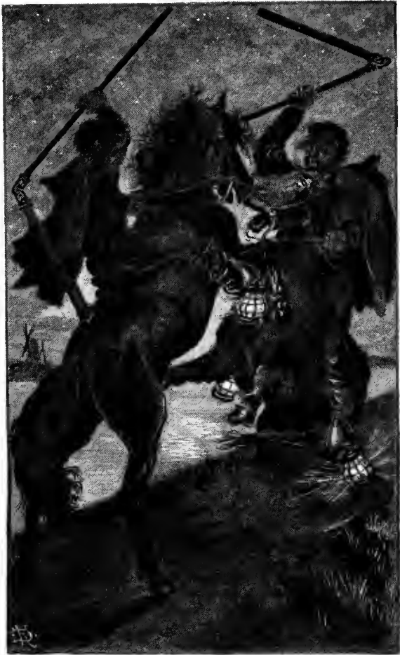
The struggle lasted some minutes.—p. 52.