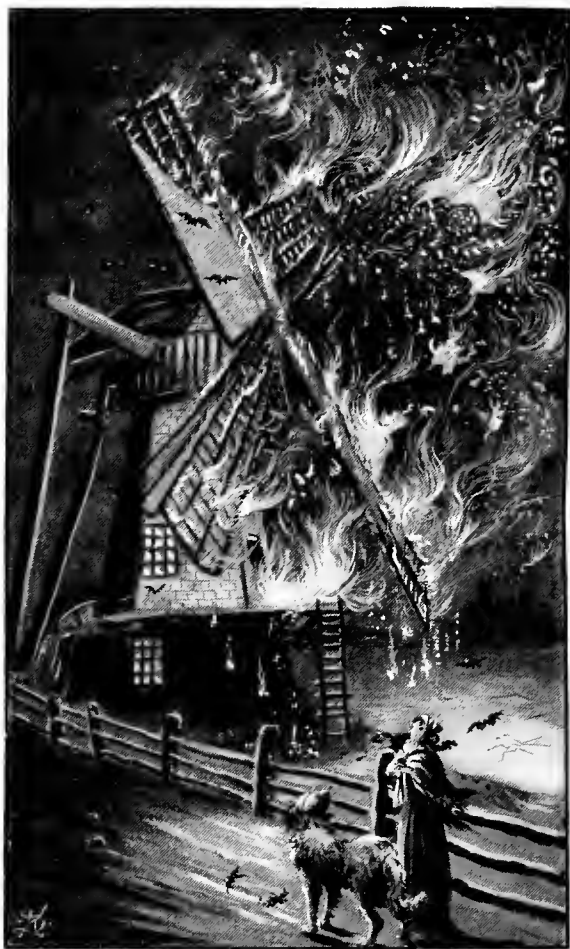
A wondrous sight in the black night.—p. 369.