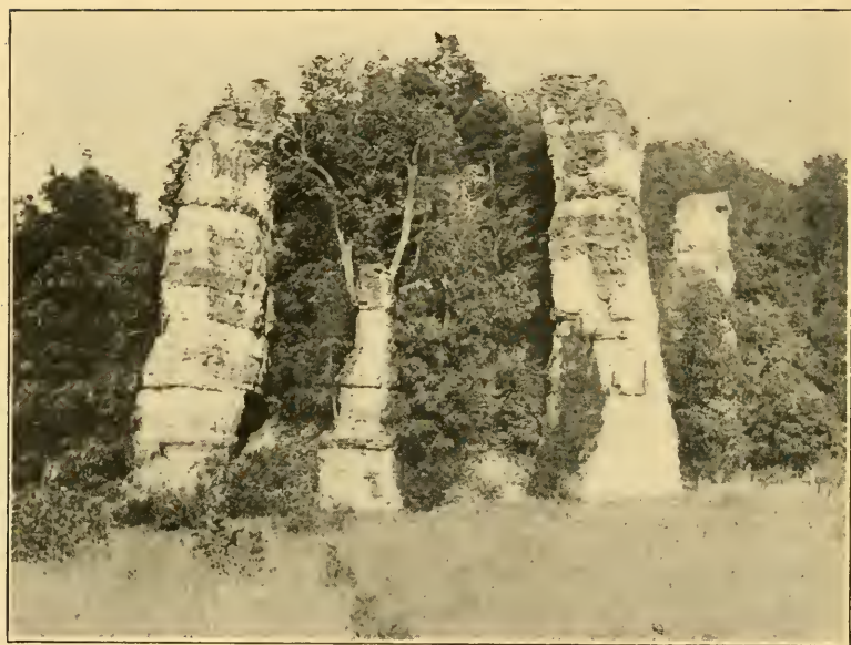
CYCLOPEAN TOWERS, AUGUSTA CO., VA. Locally known as "The Chimneys."