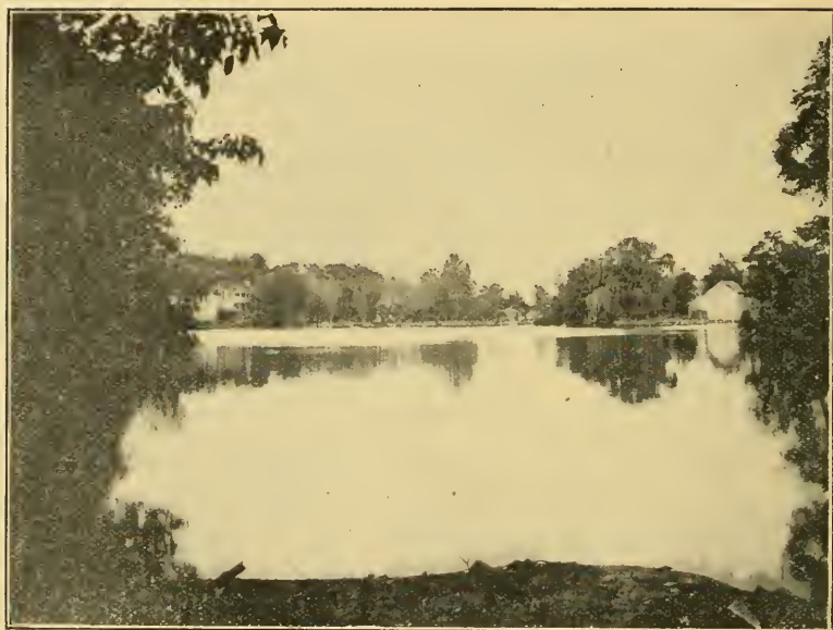
THE MILL DAM—HEAD OF MOSSY CREEK A White Mill Swathed in Weeping Willows.