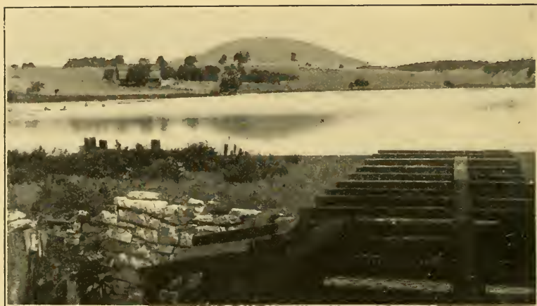
SILVER LAKE, DAYTON, VA.—ROUND HILL IN THE BACKGROUND