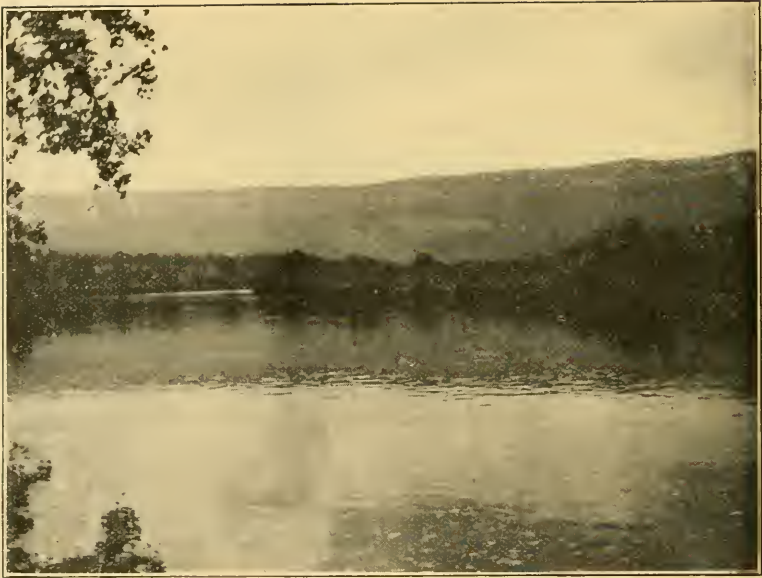
THE SHENANDOAH RIVER AND MASSANUTTEN MOUNTAIN