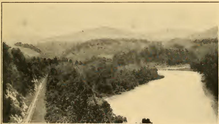
THE SHENANDOAH RIVER South Branch—Near Manor, Warren Co., Va.