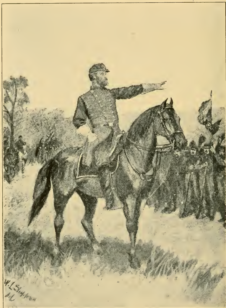
GEN. THOMAS J. (STONEWALL) JACKSON.

"In the Army of the Shenandoah, you were the FIRST BRIGADE! In the Army of the Potomac, you were the FIRST BRIGADE! In the Second Corps of the Army, you are the FIRST BRIGADE! You are the FIRST BRIGADE in the affections of your General, and I hope, by your future deeds and bearing, you will be handed down to posterity as the FIRST BRIGADE, in this our second war of Independence.—Farewell!"