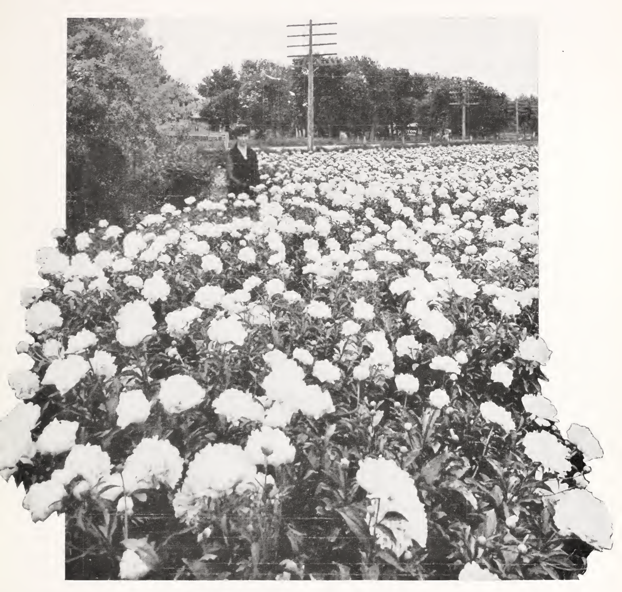
Note wonderful vigor of Rosefield Peonies