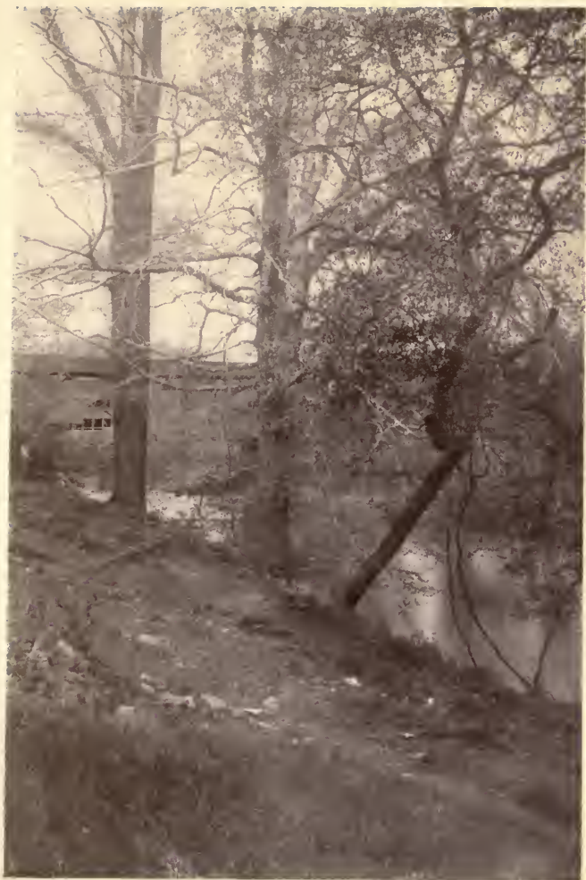
THE BRIDGE AT CHADD'S FORD, BRANDYWINE CREEK.