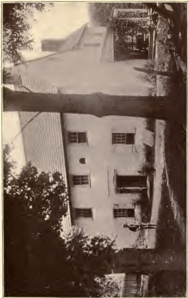
THE POTTER HOUSE.