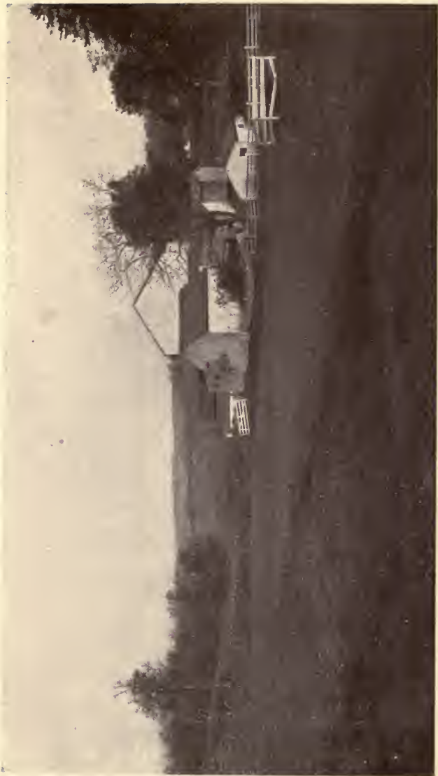
THE TUFFKENAMON VALLEY.