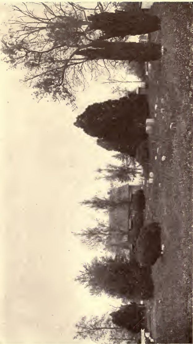
THE BURYING-GROUND AND MEETING-HOUSE AT EAST MARLBOROUGH.