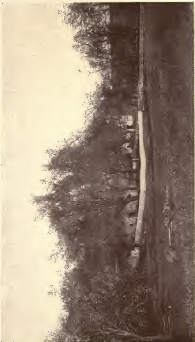
A FARMHOUSE ON THE ROAD TO NEW GARDEN.