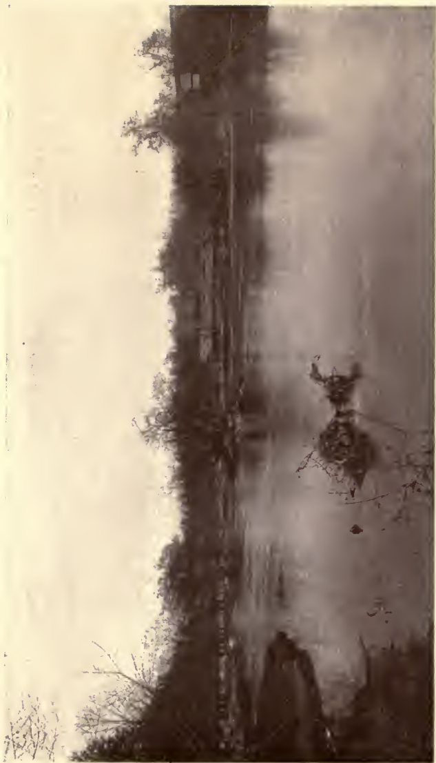
THE BRANDYWINE AT CHADD'S FORD.