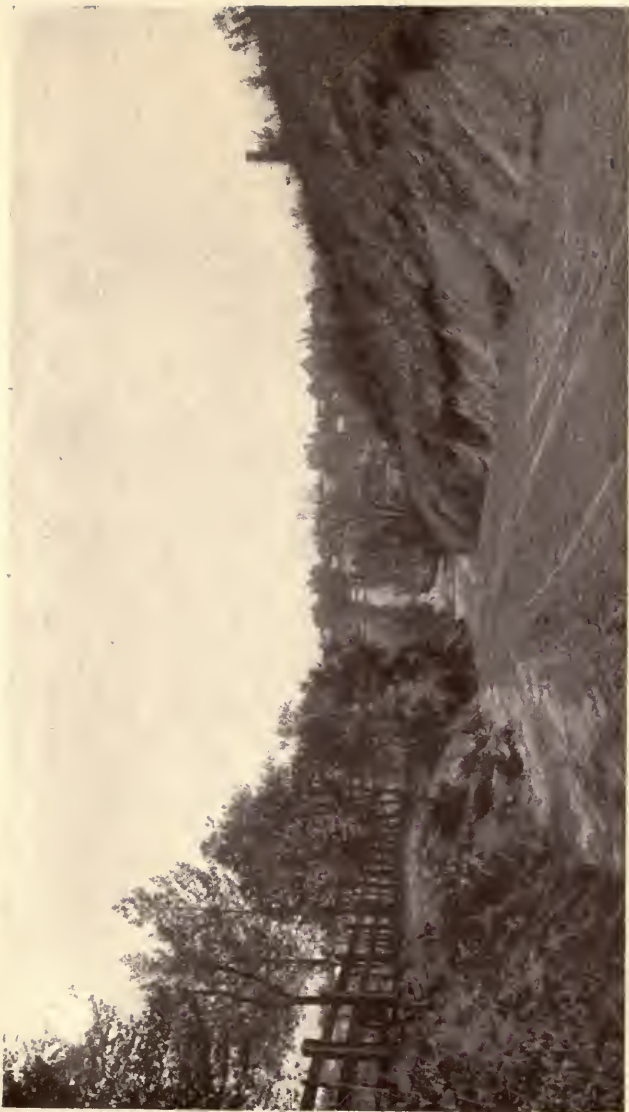
THE CHESTER ROAD LEADING INTO KENNETT.