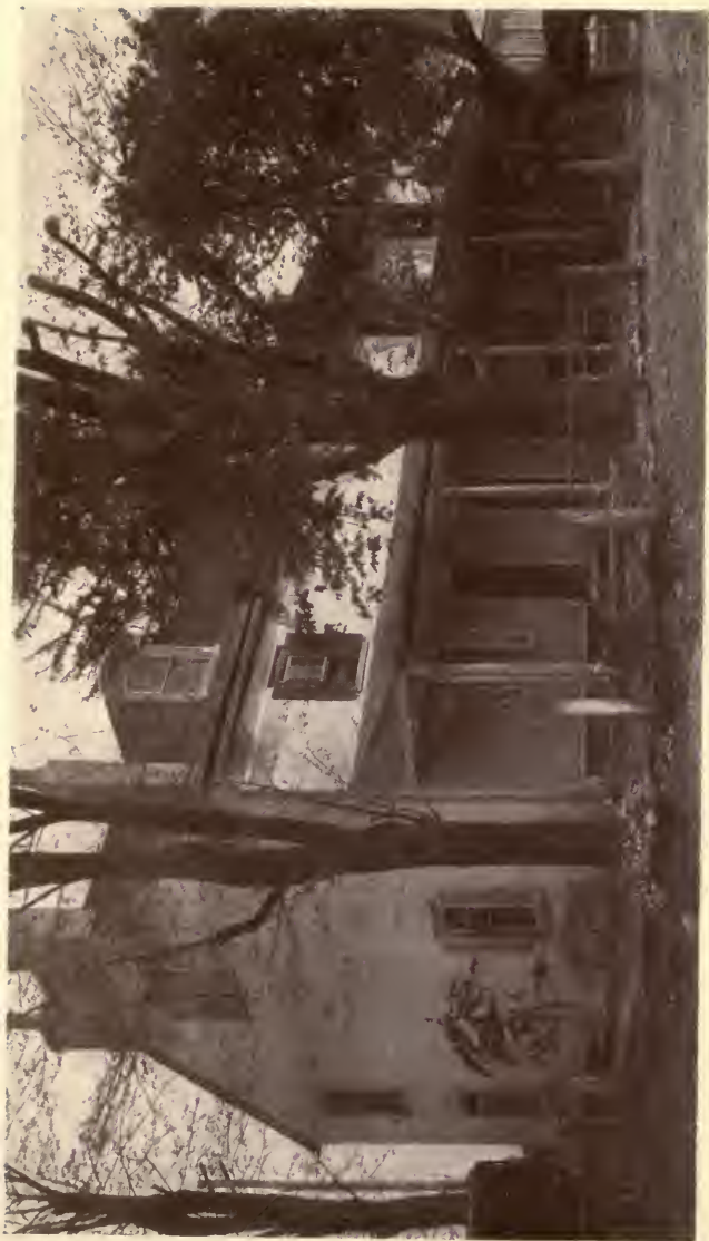
THE RED LION HOTEL, NEAR WILLOWDALE.