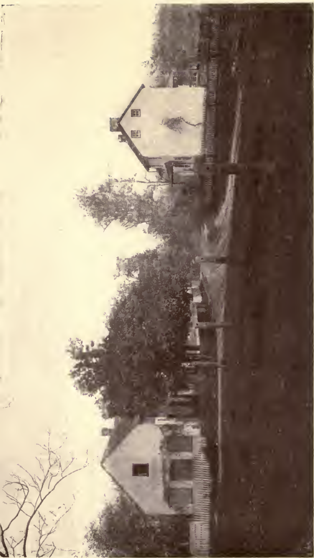
A CORNER OF EAST MARLBOROUGH.