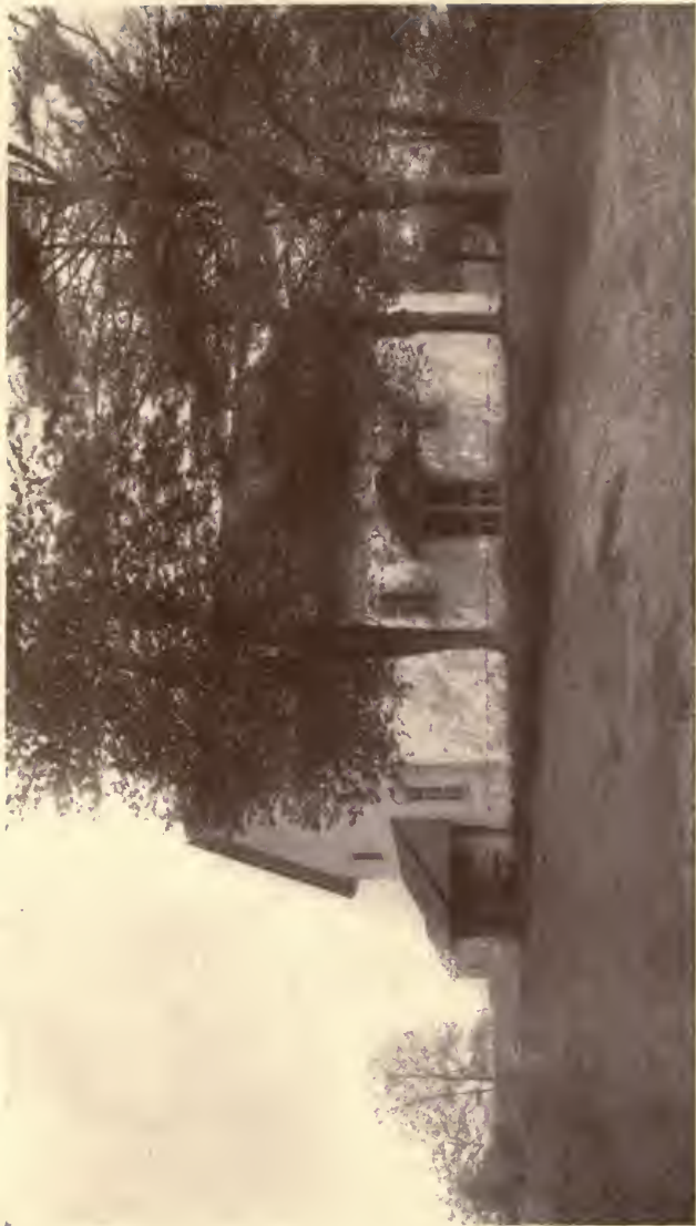
THE OLD KENNETT MEETING-HOUSE.