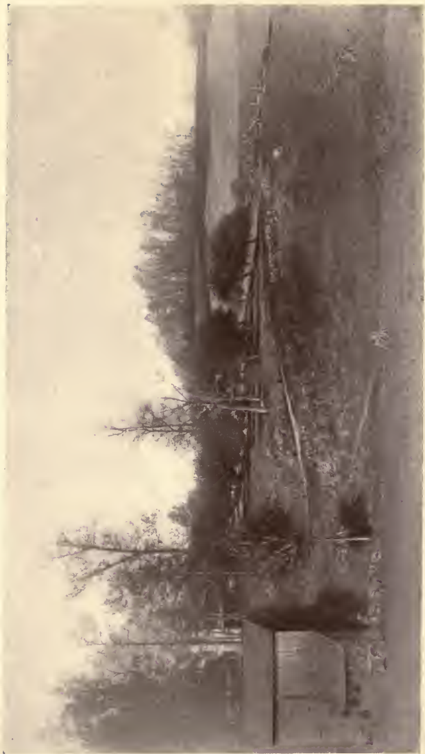
ON THE ROAD TO AVONDALE.