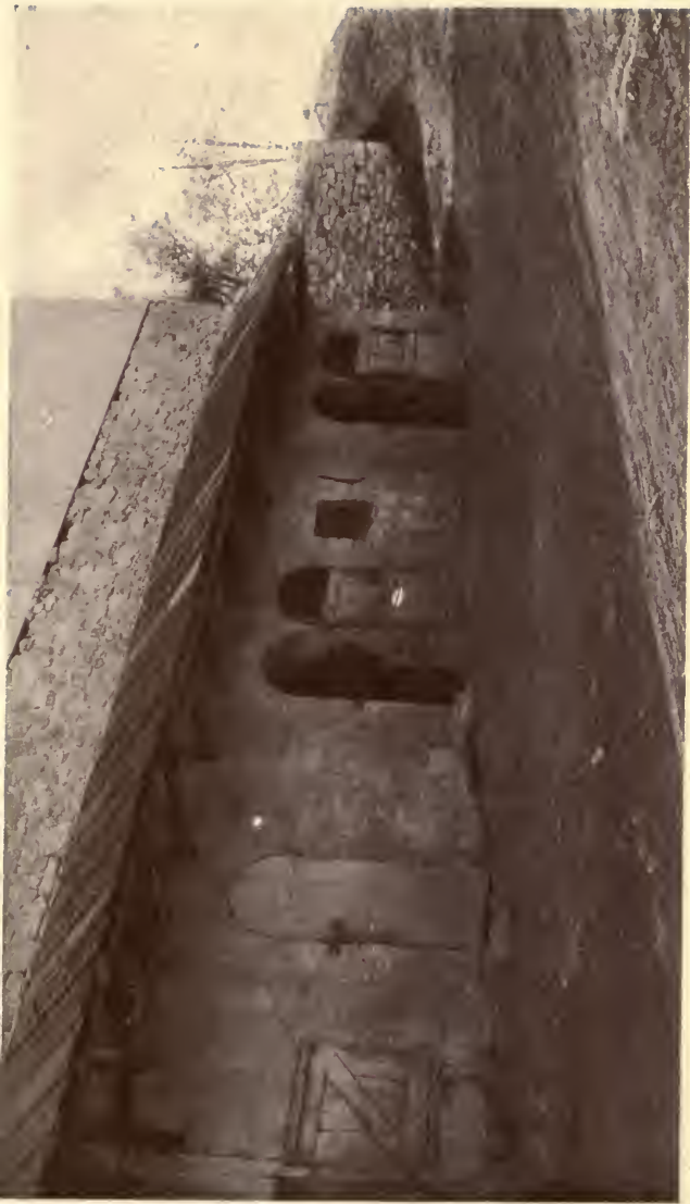
THE OLD BARN ON THE BARTON FARM.