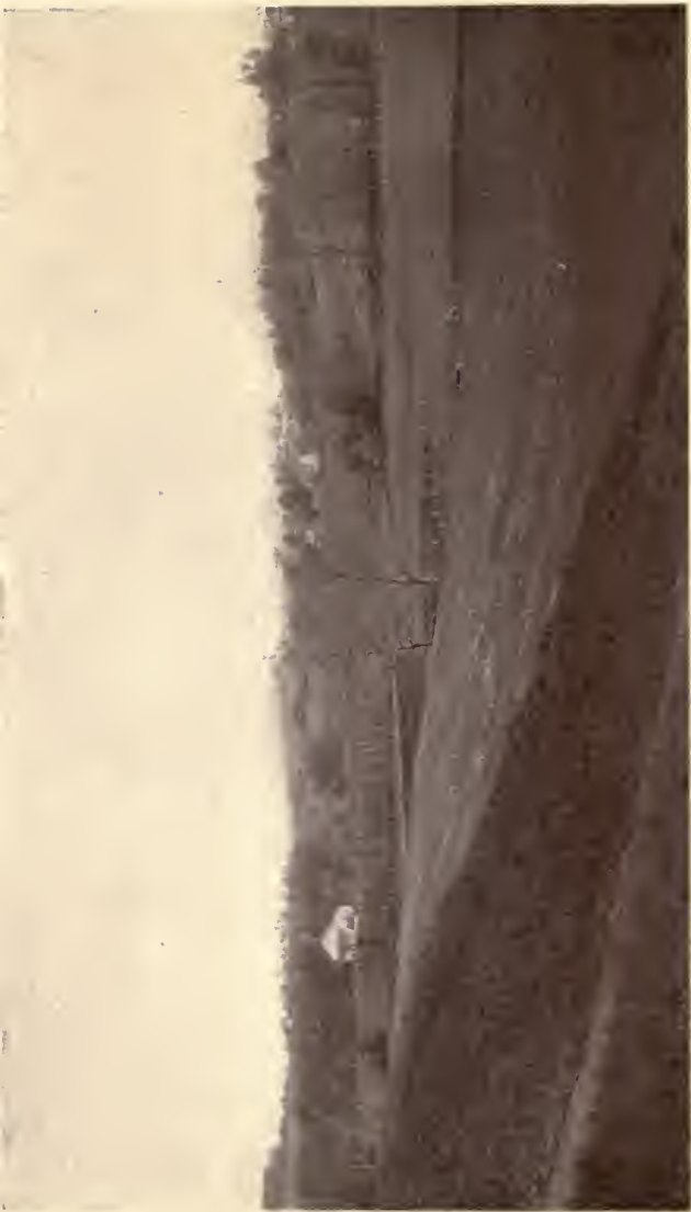
A GLIMPSE OF KENNETT FROM THE UNIONVILLE ROAD.