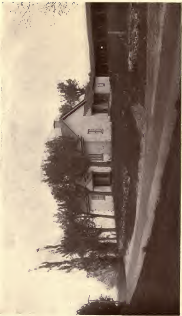
THE HOCKESSIN MEETING-HOUSE.