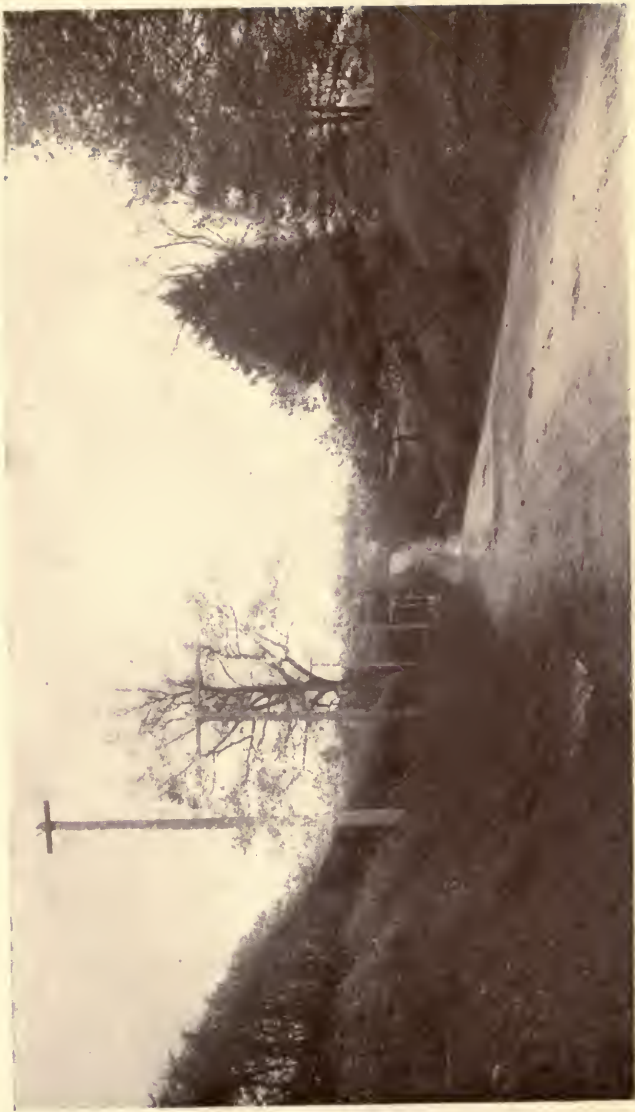
LOGTOWN FROM THE WILMINGTON ROAD.