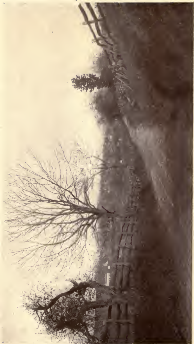
THE VILLAGE OF CHADD'S FORD FROM THE ROAD TO KENNETT.