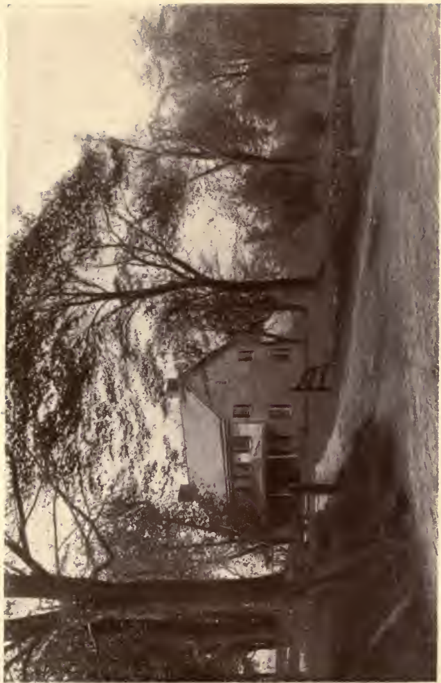
A HOMESTEAD ON THE CHESTER ROAD, NEAR THE OLD KENNETT MEETING-HOUSE.