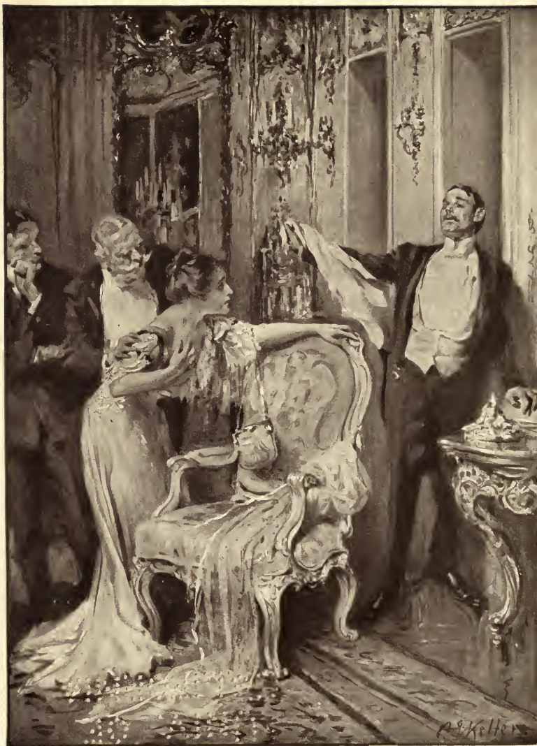
“With a quick jerk, he bared his shirt-front.” Page 69