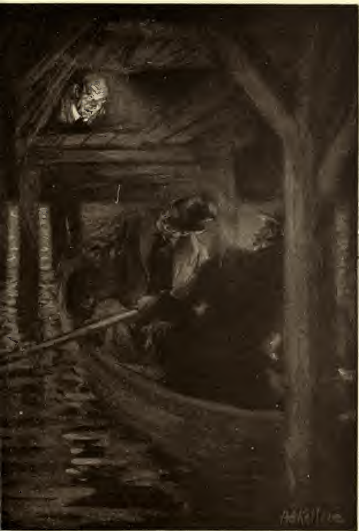
A face started out of the darkness. Page 292