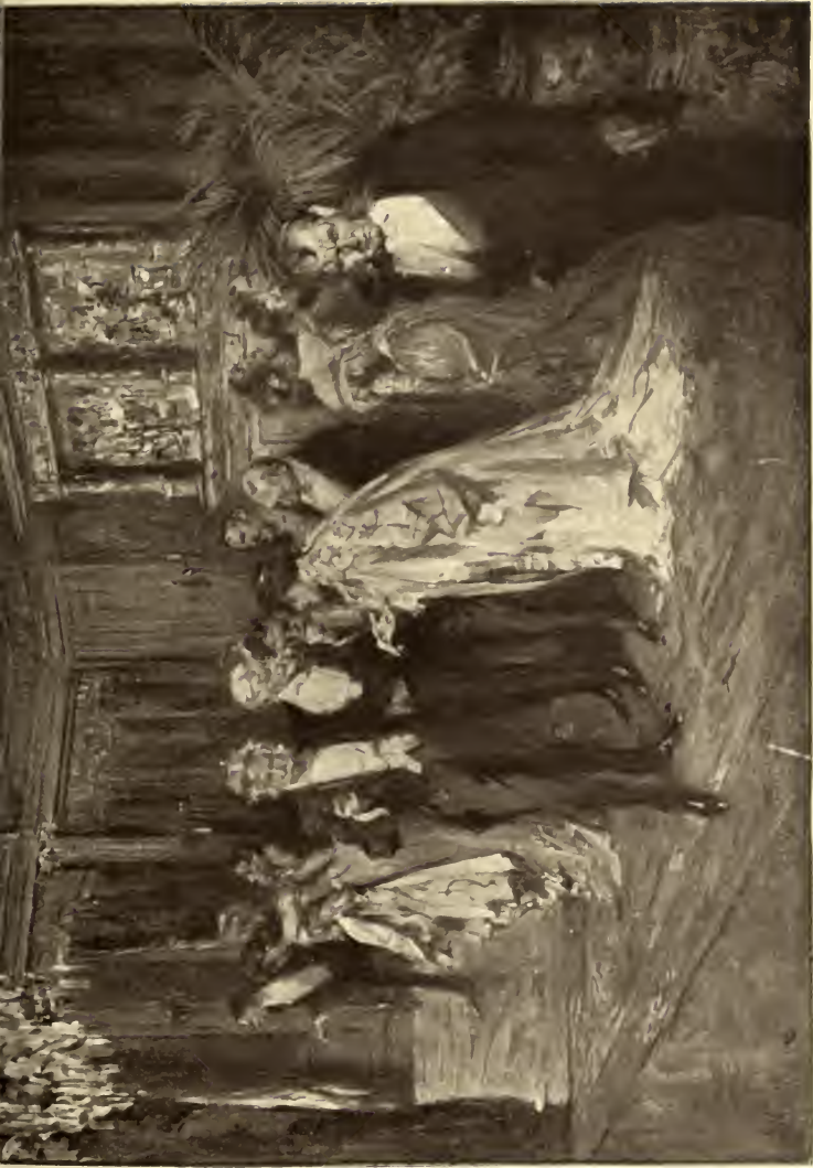
"Gentlemen, you have all been greatly deceived." Page 90