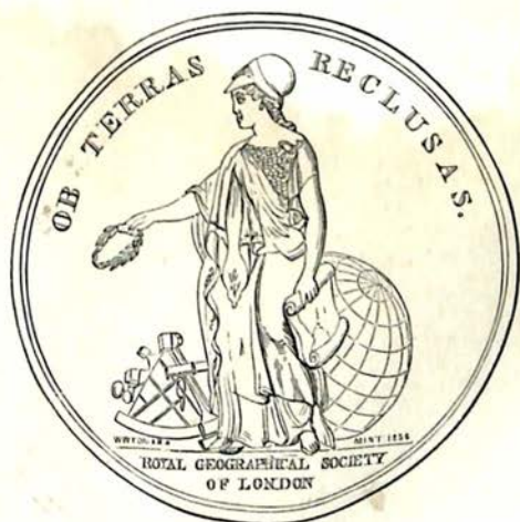
FAC-SIMILES OF GOLD MEDALS, Presented to DR. KANE by the Royal Geographical Society, and by the British Government.