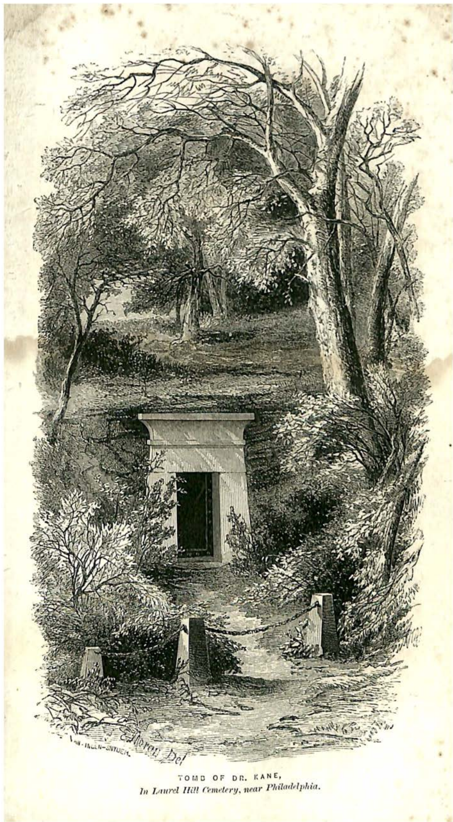
TOMB OF DR. KANE, In Laurel Hill Cemetery, near Philadelphia.