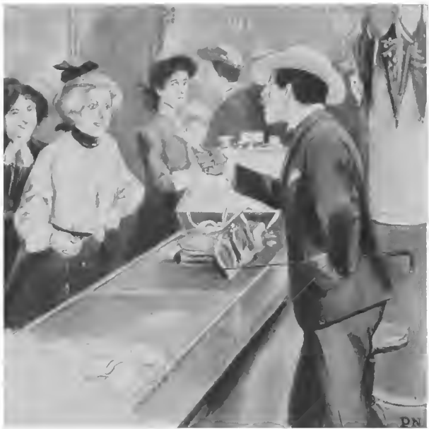
I WILL NOT DWELL UPON THAT MOST PAINFUL FIFTEEN MINUTES AT THE NOTION COUNTER