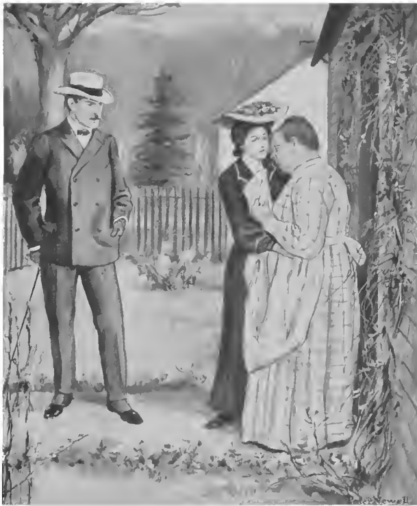
SHE WENT DIRECTLY TO MRS. DOANE, AND PUT HER ARMS AROUND HER