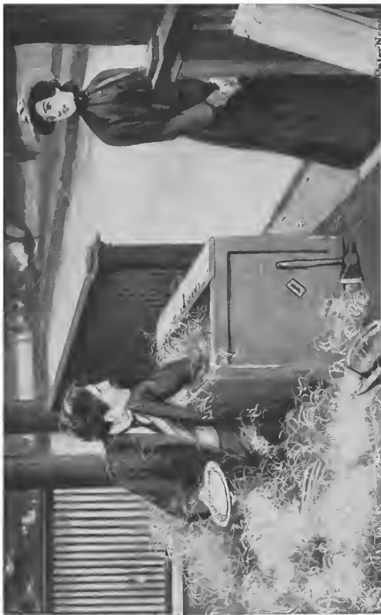
I WAS COVERED FROM TOP TO TOE WITH EXCELSIOR