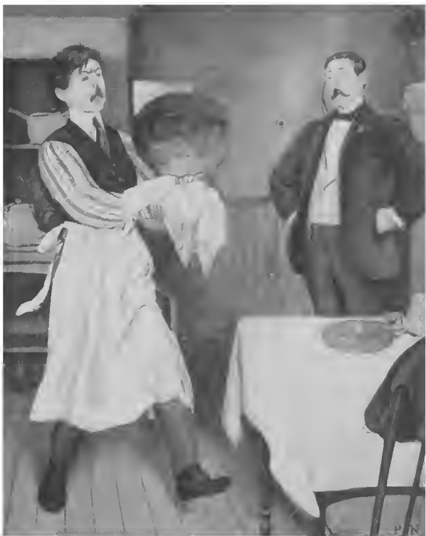
IT MIGHT HAVE PASSED MUSTER AS A BALLOON