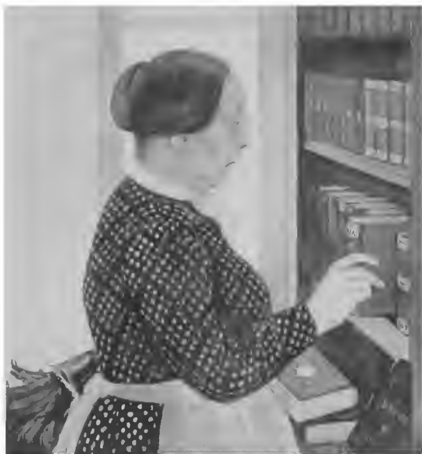
HER CAPACITY FOR DUSTING WAS INEXHAUSTIBLE