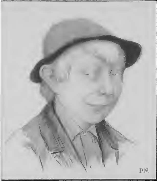
THE MOST EXPANSIVE SMILE I HAVE EVER SEEN