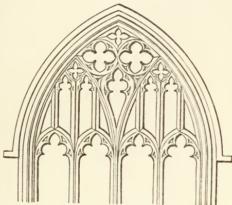
The Tracery of the West window.

Loggan's view of the Church in 1688 1 (also remarkable for showing the destroyed porch, vestry, and Jacobean terminations to the tower and turrets), and also in a sketch by Essex the architect 2 , the original windows of four lights, with supermulioned tracery and without a transom , are represented. From a view of the Church in 1763 3 , the tracery of the west windows of