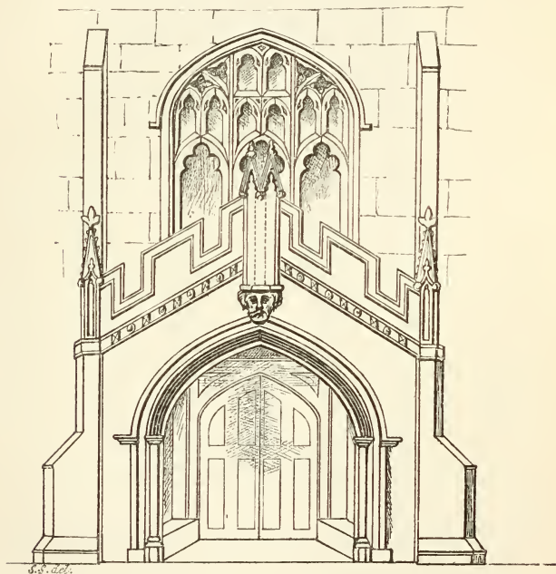
South Porch, destroyed about 1805. Enlarged from the view of the Church given in Loggan's Cantabrigia Illustrata , 1688.

The Church has externally a somewhat bare appearance, caused by the destruction of the tracery in the aisle-windows, and the loss of the south porch. The clerestory is, however, fine, and the tower, though reduced by successive mutilations to no