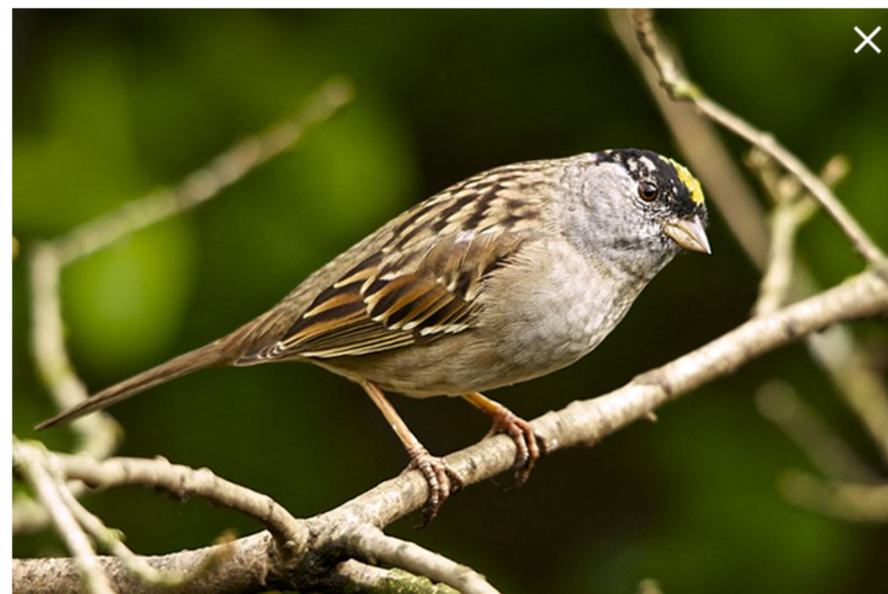
Zonotrichia atricapilla A Golden-crowned Sparrow in British Columbia, Canada