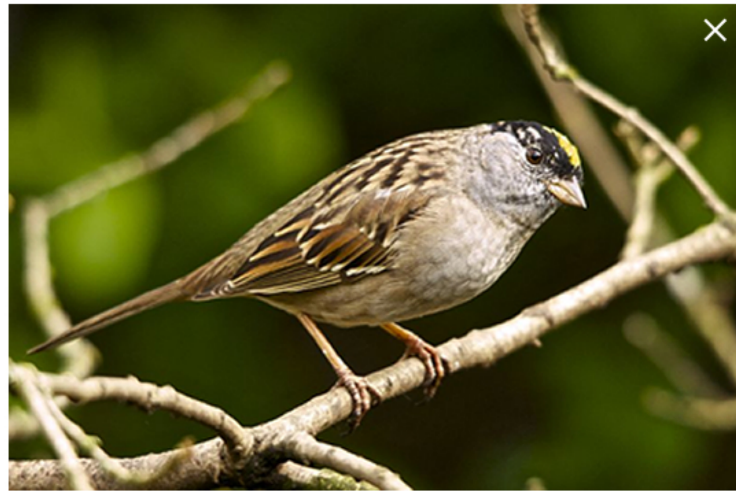
Zonotrichia atricapilla A Golden-crowned Sparrow in British Columbia, Canada 1 February 2016 (12:06) 50.3 - 120.5. View map Golden-crowned sparrow Edit tags