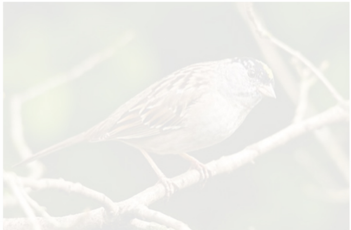
Adult; males and females are similarly plumaged