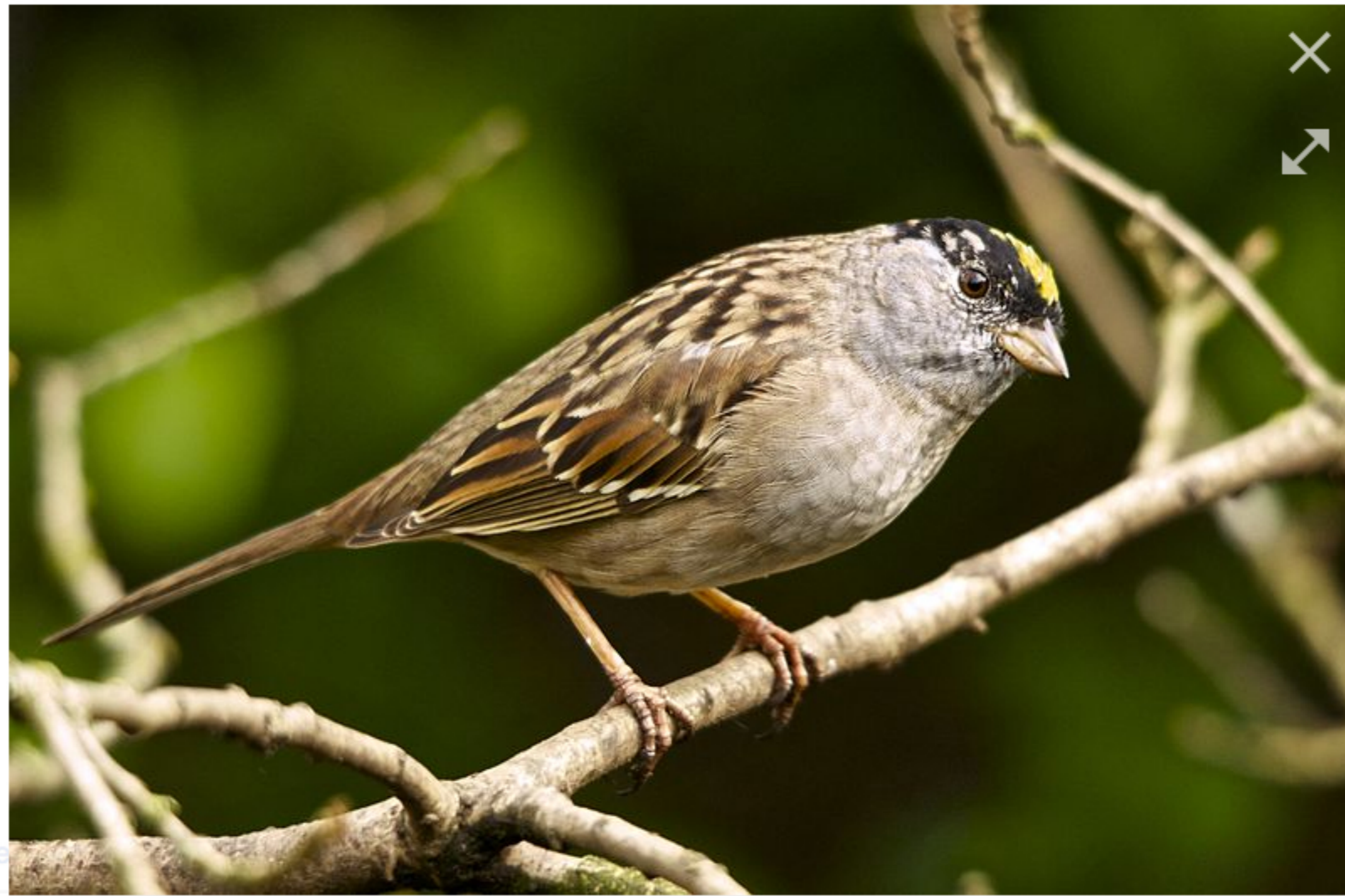
Zonotrichia atricapilla