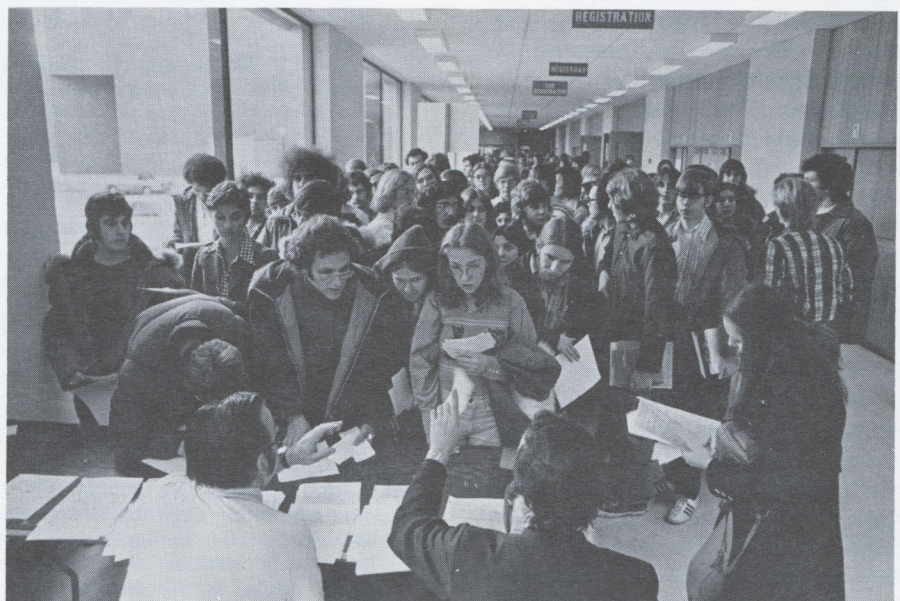
It was Winter quarter pre-registration last week and the administration building lobby looked like this most of the time. Undergraduate and graduate registration will be held again January 3, and classes begin January 4.