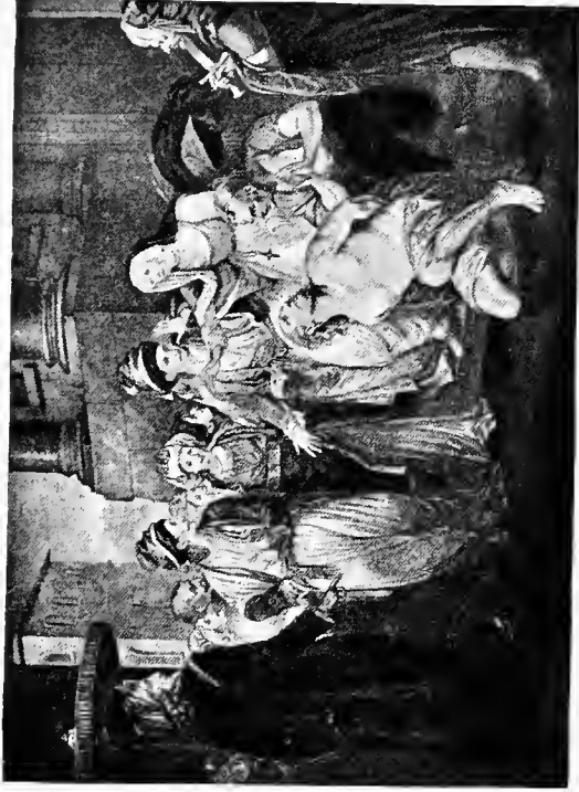
THE COMEDY OF ERRORS, Act V., Scene I.