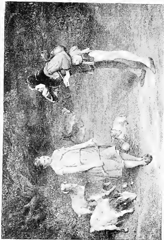
AS YOU LIKE IT. Act III., Scene III.