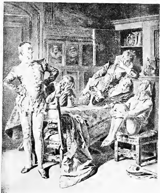
TWELFTH NIGHT. Act II., Scene III.