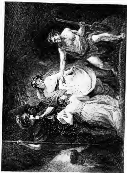
TIMON OF ATHENS, Act IV., Scene III.