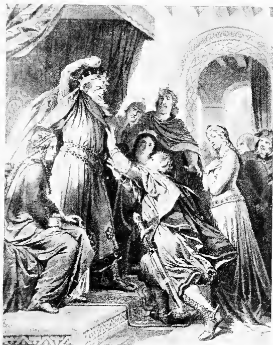
KING LEAR. Act I., Scene I