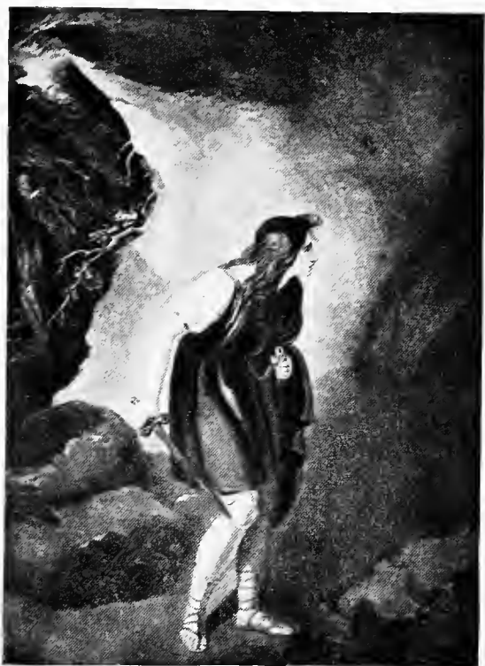
CYMBELINE. Act III., Scene VI.