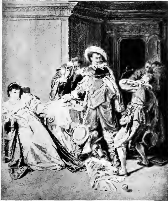
THE TAMING OF THE SHREW. Act IV., Scene I.