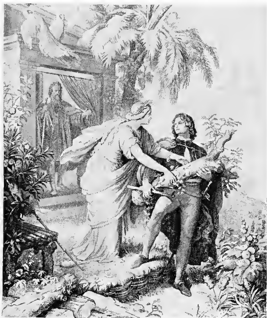
THE TEMPEST, Act III., Scene I.