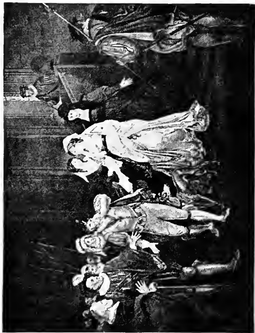
ALL'S WELL THAT ENDS WELL. Act III., Scene III.