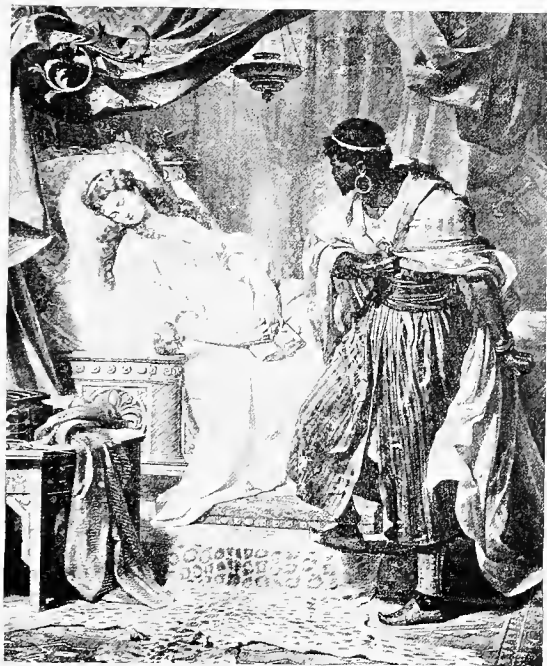
OTHELLO. Act V., Scene II.