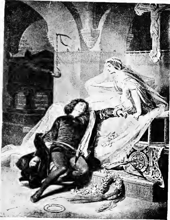
ROMEO AND JULIET. Act V., Scene II.