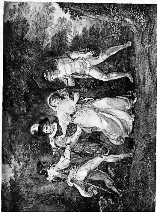
THE TWO GENTLEMEN OF VERONA,