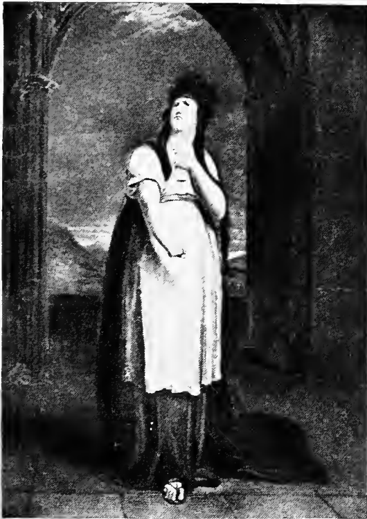
MACBETH. Act I., Scene V.