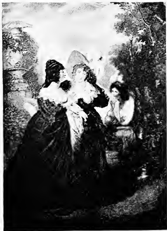
MUCH ADO ABOUT NOTHING. Act III., Scene I.