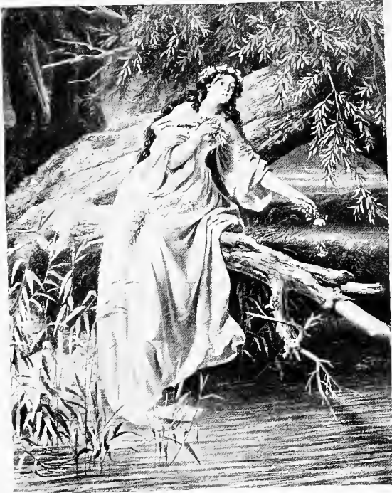
HAMLET. Act IV., Scene VII.