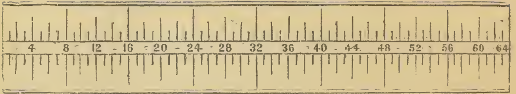
SCALE OF ONE-SIXTEENTH OF AN INCH.

☞ A printed list of prices realized at this sale will be forwarded on the receipt of twenty-five cents.