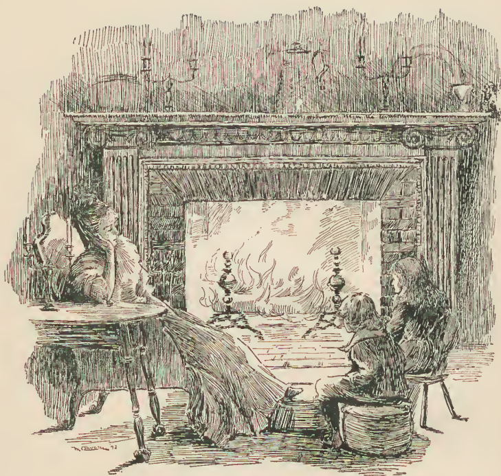
A SILENT GROUP ABOUT THE HEARTH.