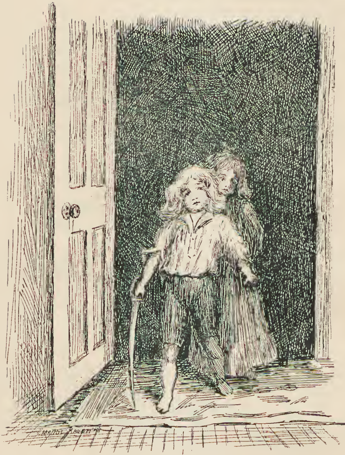
HE MADE A PRETTY PICTURE—ALERT AND QUITE FEARLESS.