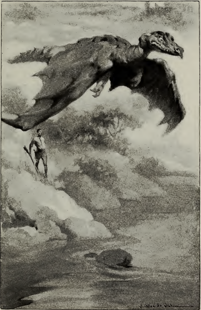
The Mahar spread her giant wings and sped away