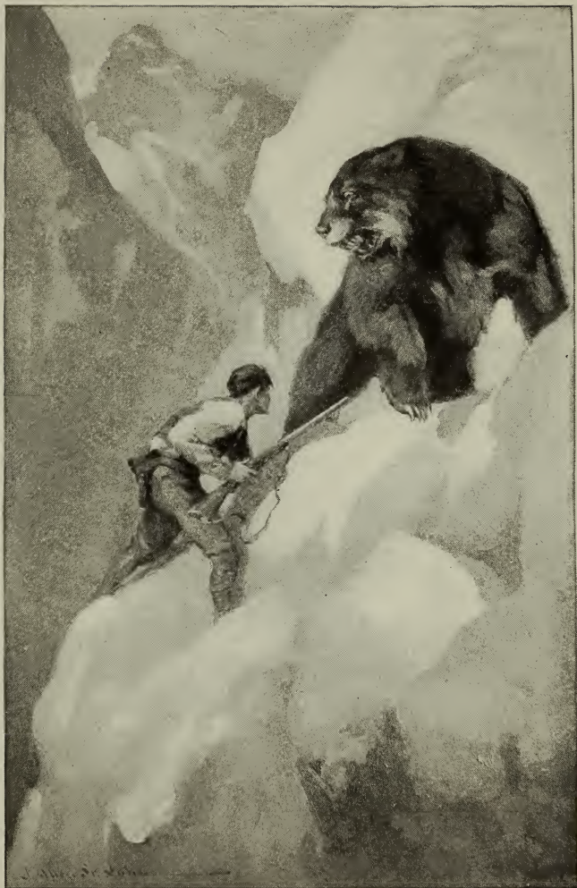
Face to face with the Titan