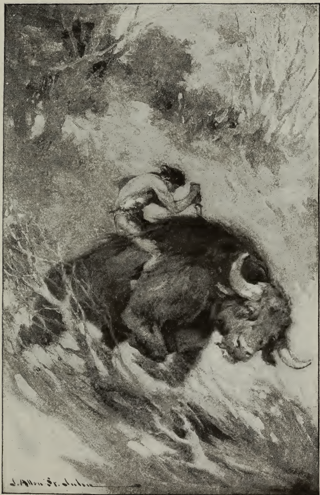
I drew my long knife and drove it home with both hands