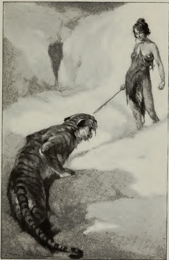
With a hideous roar the beast turned and slunk toward the girl