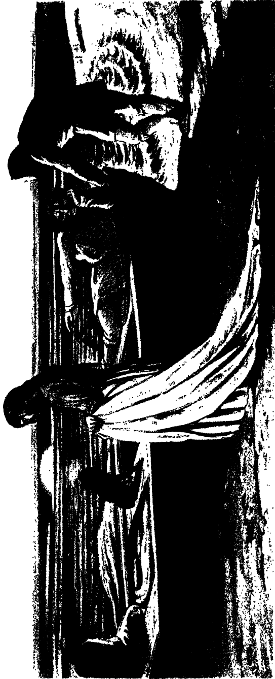
THE WINDING SHEET