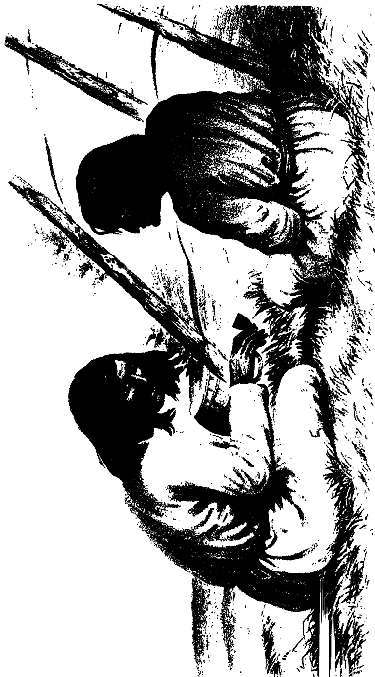
OTELNE THE TONGUE.