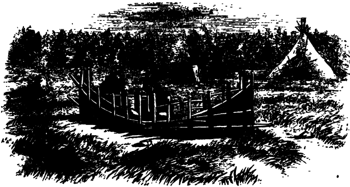
BUILDING CANOES—SQUAWS STITCHING THE BIRCH-BARK.

It seems hard, and even cruel, for the Canadian Government to lease the salmon rivers flowing into the estuary and gulf, and to forbid by law the Indians who were born on the soil from taking fish for their daily food from rivers which are leased to 'white men;' yet such is the almost incredible thoughtlessness of these people, and so great the number of fish they destroy