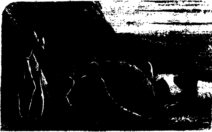
THE CONJUROR IN HIS VAPOUR-BATH.

The vapour-bath played an important part in their ceremonies : it was not only used for medicinal purposes, but in it the conjurors were accustomed to propitiate the deities, or Kichi-kouai, who presided over their hunting-grounds. The conjurors would frequently pretend to see the feeding haunts of the caribou or moose, the winter