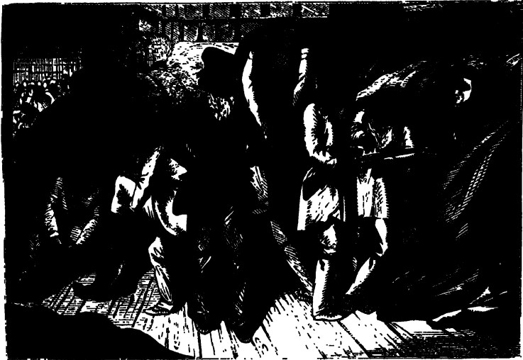
NASQUAPER INDIANS AT THE HUDSON'S BAY COMPANY'S POST AT MINGAN.

The garments of the women consist of a square piece of dressed deer-skin, fastened round the body with a belt, and suspended from the shoulders by means of straps, a leather jacket, leggings, and moccasins. Polygamy is practised, and it is not unusual for a man to marry two sisters one after the other, or both at the same time. Whatever is killed in hunting or fishing is divided among