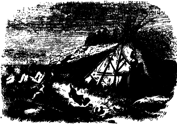
MONTAGNAIS CAMP ON ONE OF THE MINGAN ISLANDS.

I went with one of the clerks into the Hudson's Bay