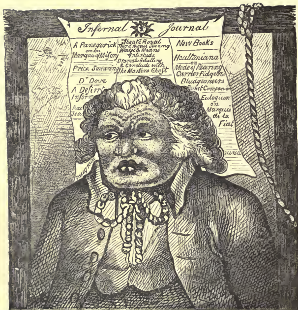
[From a Caricature of the day.]