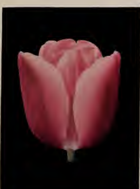
Darwin tulip LA FIANCÉE $.95 per 10; $7.00 per 100 Height 32 inches