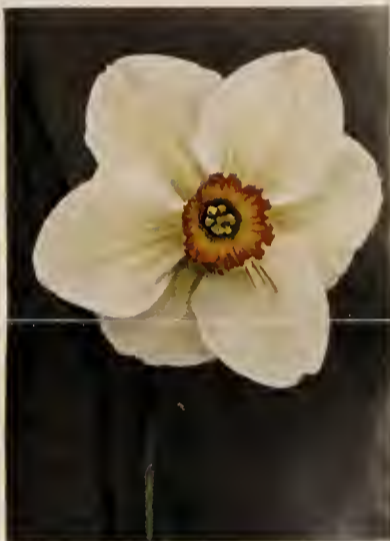
A typical Barrii Narcissus

A really superior mixture made up from the newer varieties of Daffodils, containing all types. The selection is from more than 100 varieties, assuring a 4- to 6-week flowering season. Extra-heavy selected bulbs, $75 per case of 1000; $38 per case of 500; $9 per 100.