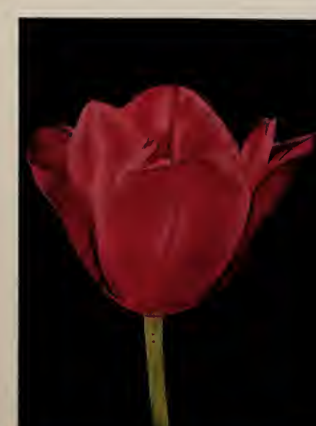
Hybrid tulip BARBARA PRATT $2.10 per 10; $18.50 per 100 Height 36 inches