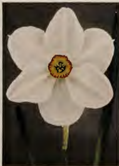
A typical Poeticus Narcissus

Regular List Price . . . . . $28.90 Special Price . . . . . 22.00