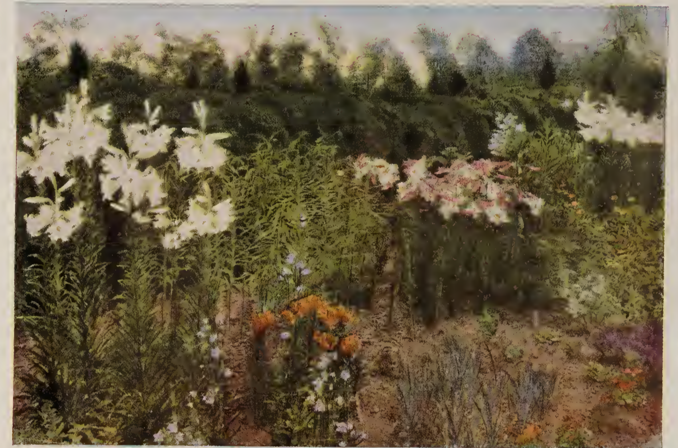
Lilium Candidum and Lilium Regale in the border.

Our large, highest quality bulbs . . . $8.00 for 10—$77.50 per 100 Selected bulbs of fine quality . . . $3.75 for 10—$35.00 per 100 Smaller bulbs at correspondingly lower prices