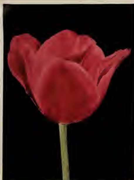
Darwin tulip PRINCESS MARY $1.90 per 10; $16.50 per 100 Height 35 inches