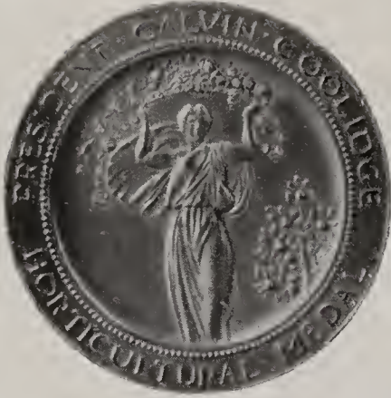
Awarded us by President Calvin Coolidge for Horticultural Achievement.