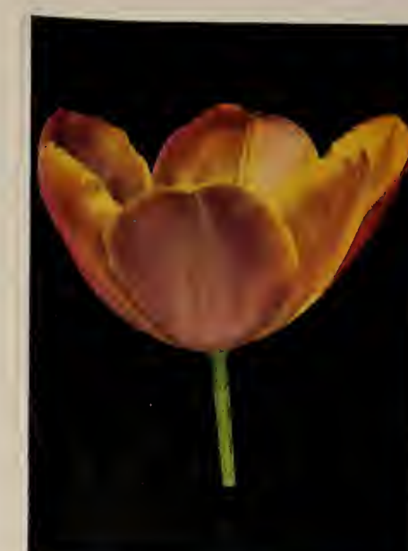
Breeder tulip MARÉCHAL VICTOR $1.50 per 10; $12.50 per 100 Height 30 inches