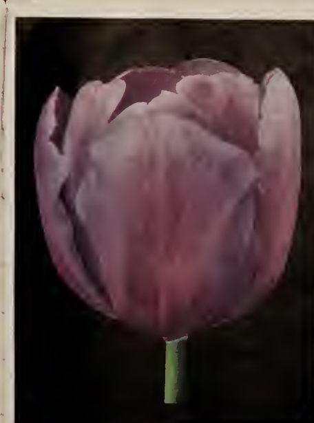
Darwin tulip ANTON MAUVE $1.00 per 10; $7.50 per 100 Height 32 inches