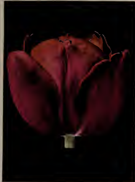
Breeder tulip LOUIS 14th $ .95 per 10; $7.00 per 100 Height 34 inches

Regular List price . . . . . $13.05 Special price . . . . . 10.50