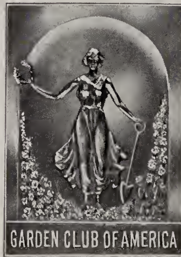
Awarded us twice by the Garden Club of America.

A few of the high honors bestowed on us for merit . . .