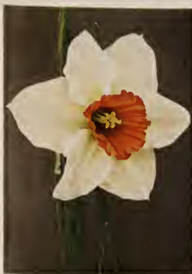
Incomparabilis Narcissus Franciscus Drake

Regular List Price . . . . . $32.55 Special Price . . . . . 25.00