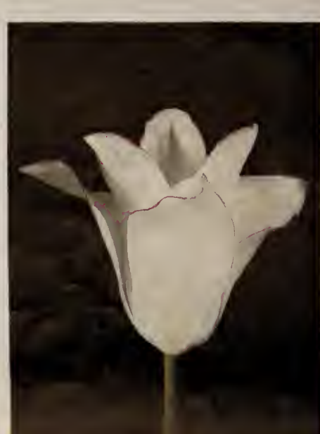
Lily-flowering tulip ELEGANS ALBA $1.40 per 10; $11.50 per 100 Height 24 inches