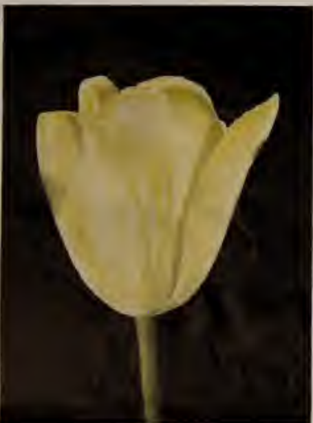
Cottage tulip MOONLIGHT $ .85 per 10; $6.00 per 100 Height 25 inches