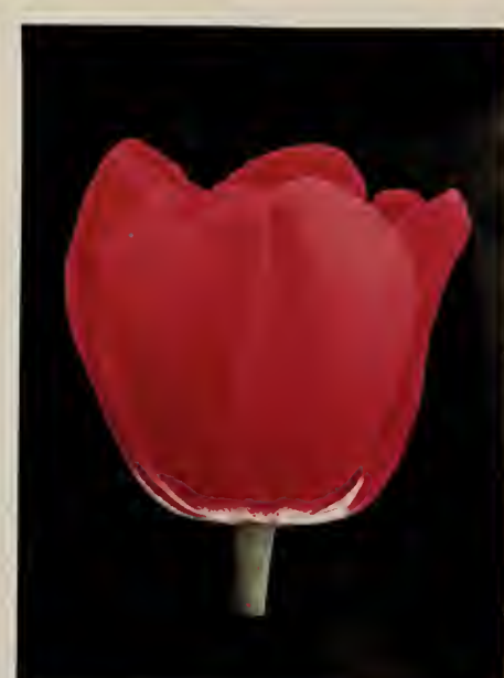
Darwin tulip KING GEORGE V $1.10 per 10; $8.50 per 100 Height 28 inches