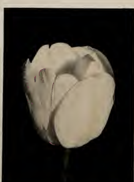
Hybrid tulip CARRARA $1.20 per 10; $9.50 per 100 Height 24 inches