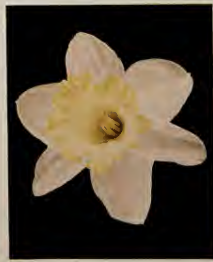
Leedsii Narcissus Gertie Millar

For other varieties of Daffodils please consult our 1935 Edition of "BEAUTY FROM BULBS"