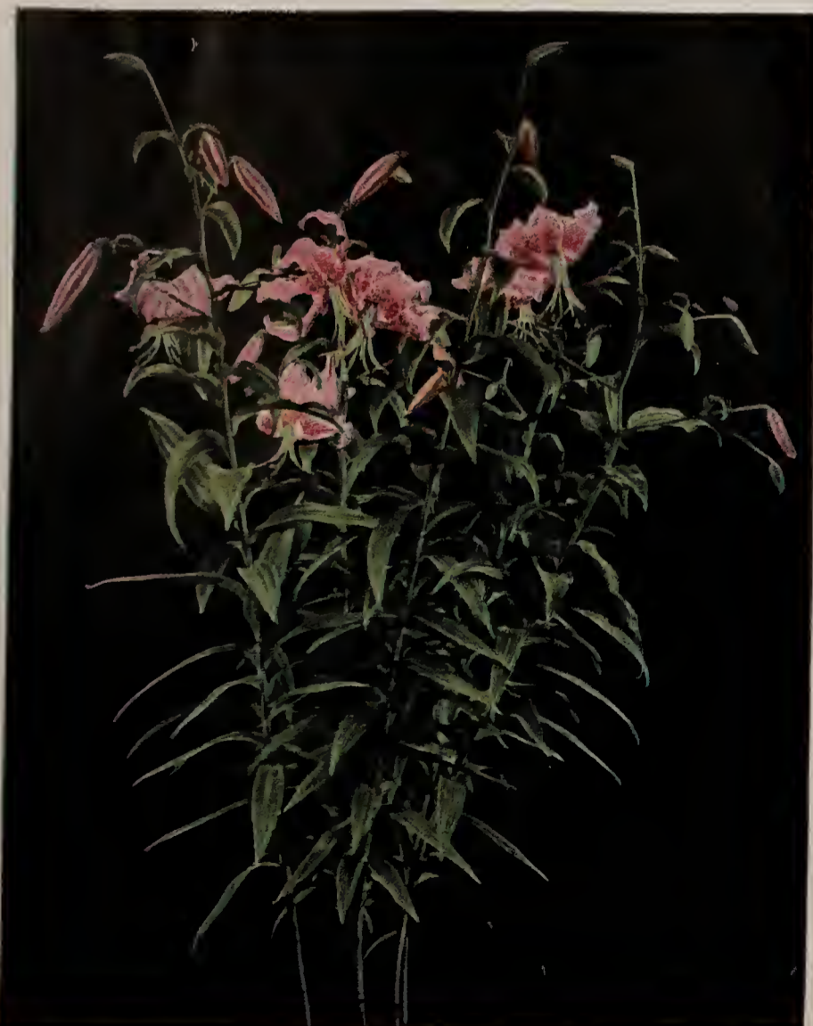
Lilium Speciosum Magnificum