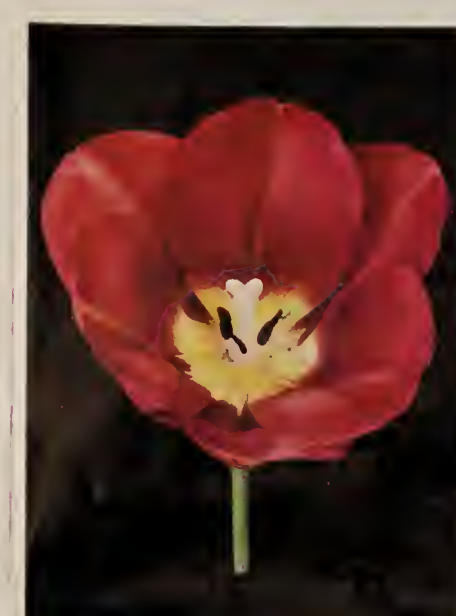
Breeder tulip INDIAN CHIEF $1.45 per 10; $12.00 per 100 Height 36 inches