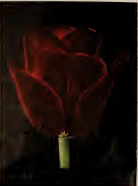
Darwin tulip ECLIPSE $1.85 per 10; $16.00 per 100 Height 30 inches