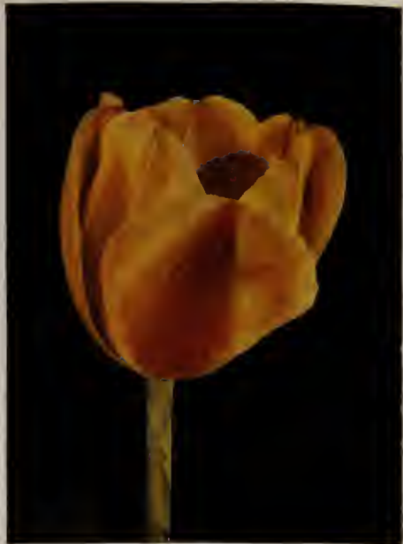
Breeder tulip DILLENBURG $1.40 per 10; $11.50 per 100 Height 32 inches