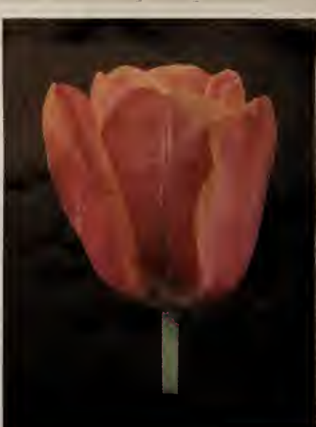
Hybrid tulip AMBROSIA $ .95 per 10; $7.00 per 100 Height 30 inches