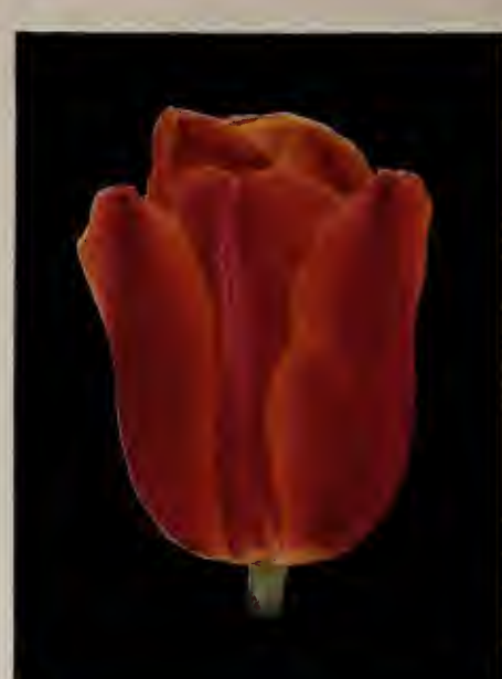
Hybrid tulip DIDO $.65 per 10; $6.00 per 100 Height 32 inches