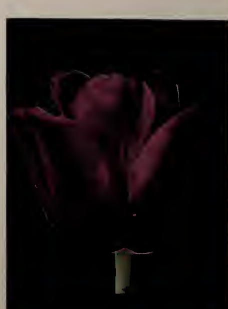
Darwin tulip THE BISHOP $1.15 per 10; $9.00 per 100 Height 30 inches