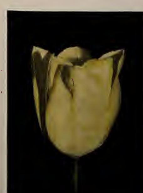
Cottage tulip LEMON QUEEN $1.05 per 10; $8.00 per 100 Height 28 inches