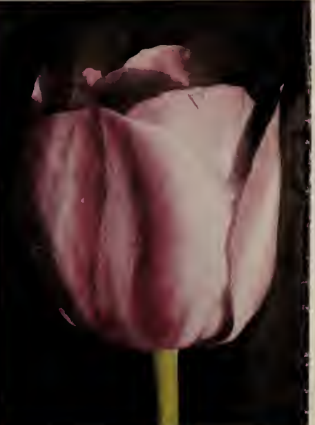
Darwin tulip MELICETTE $1.10 per 10; $8.50 per 100 Height 28 inches