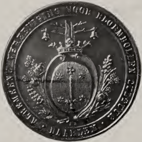
Awarded us three times by the Holland Bulb Growers' Association of Haarlem, Holland.