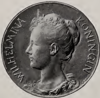
Awarded us by Her Majesty, Queen Wilhelmina of the Netherlands at the International Flower Show, 1930.