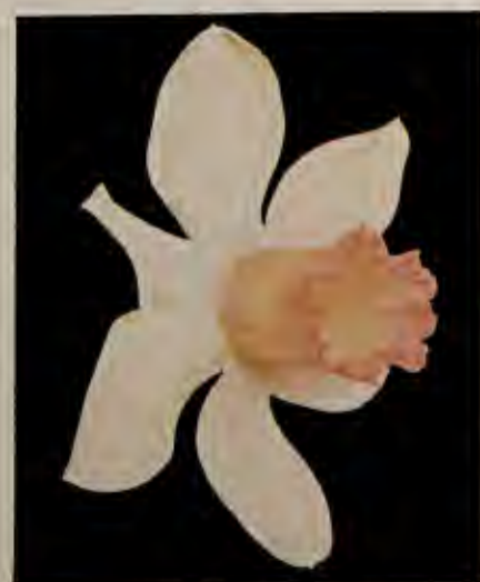
Trumpet Narcissus Mrs. R. O. Backhouse

A fine mixture made up from the best of the Standard varieties of Daffodils, carefully selected and containing many types. Extra selected bulbs, $29 per case of 1000; $15 per case of 500; $3.50 per 100.