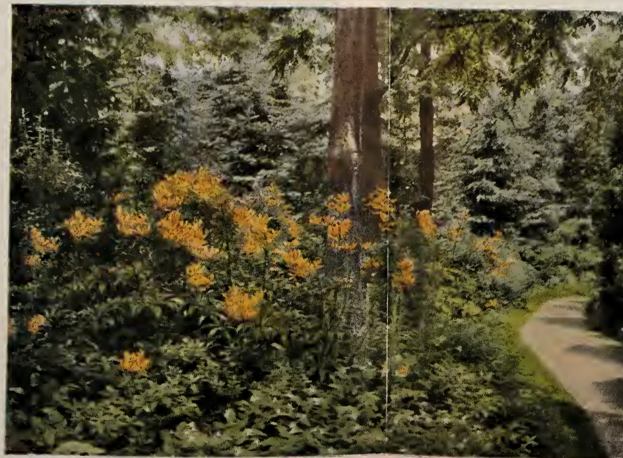
A Naturalized Planting of Lilium Hansonii

Lilium Regale (The Regal or Royal Lily). One of the most beautiful, hardiest and easiest to grow Lilies in cultivation, flowering in July, worthy of a place in every garden. The bulbs which we offer are carefully selected as to trueness of original type; this is important.