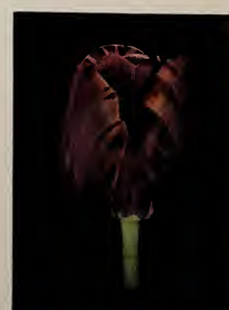
Breeder tulip ROI SOLEIL $1.00 per 10; $7.50 per 100 Height 32 inches