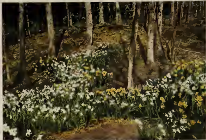
Mixed Daffodils (Narcissus) Naturalized

... is represented here. It is a list covering all the different types and these varieties listed here are the best in the various price ranges. You may purchase these with the utmost confidence... and we offer them at a price level that enables everyone to enjoy these most beautiful harbingers of spring.