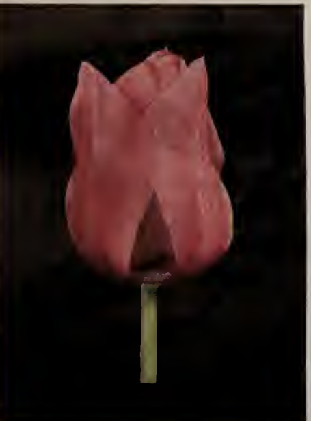
Darwin tulip VENUS $ .95 per 10; $7.00 per 100 Height 30 inches