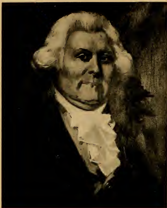
COL. WILLIAM RAYMOND LEE