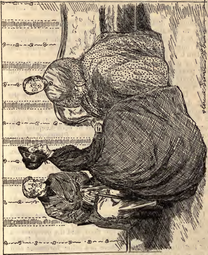
"To chat with certain old friends."