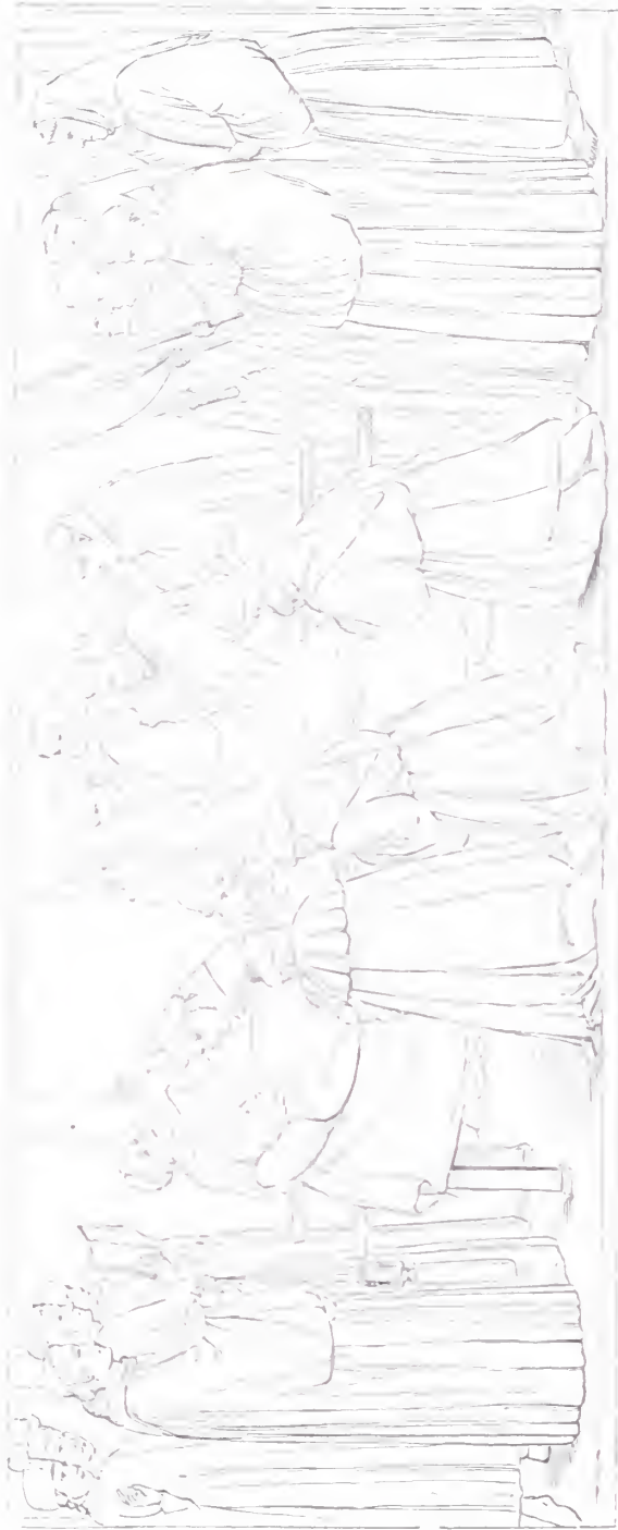
BAPTISM BY GIOTTO, IN THE CHURCH OF STA. CROCE, FLORENCE.