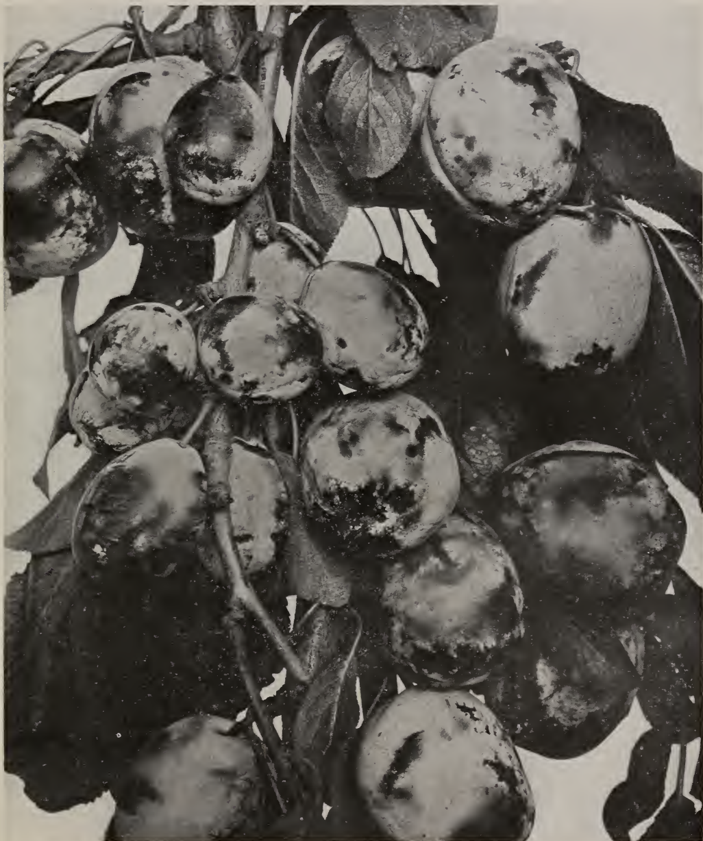
Two types of our prunes: Coates (French) No. 1418, the largest drying about 30 to the pound, and Coates (French) No. 1403, bearing a heavier crop, but smaller prunes.