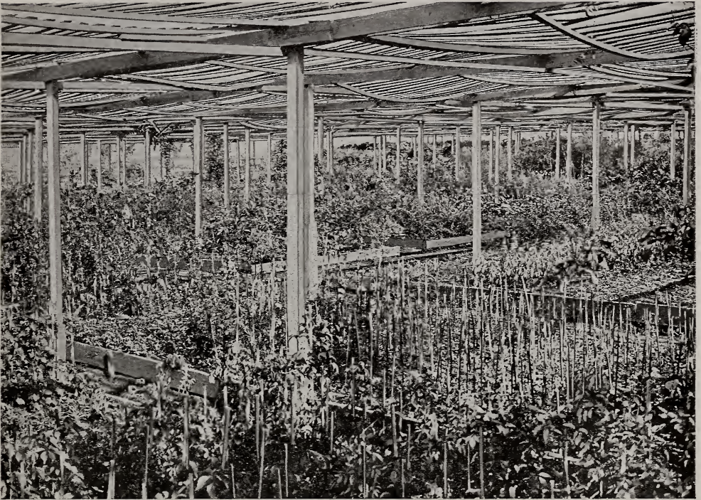
Lath houses full of ornamental trees and plants.