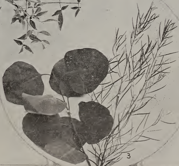
1 Berberis Aquilolium