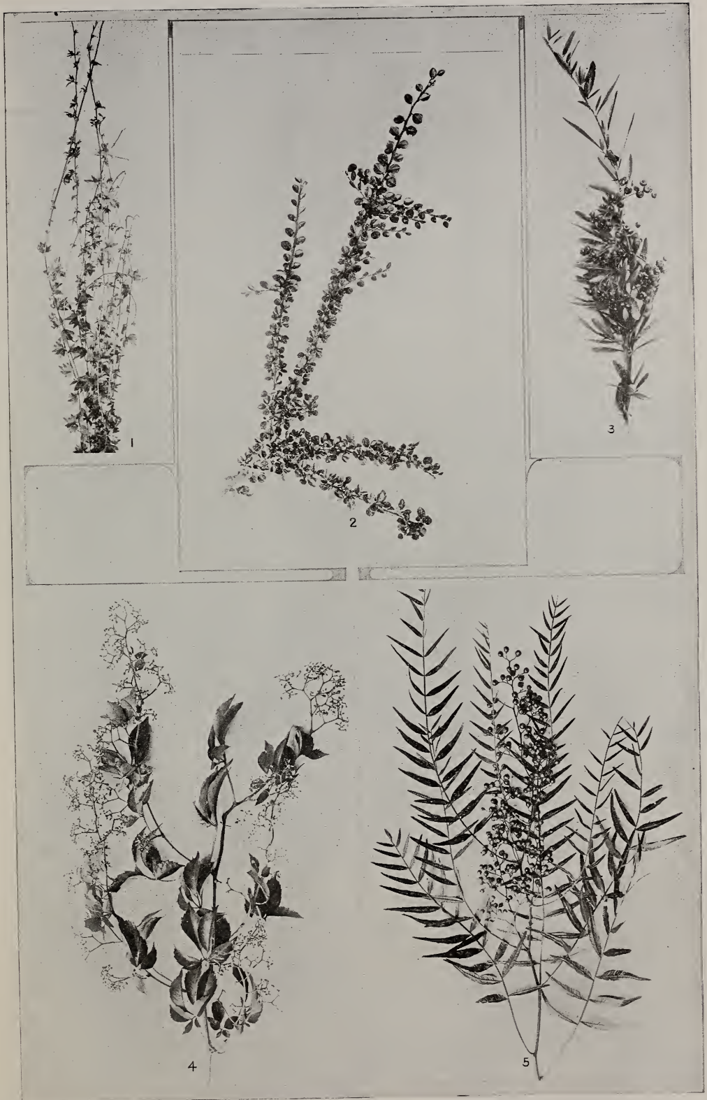
1 Ampelopsis Inconstans Lowii