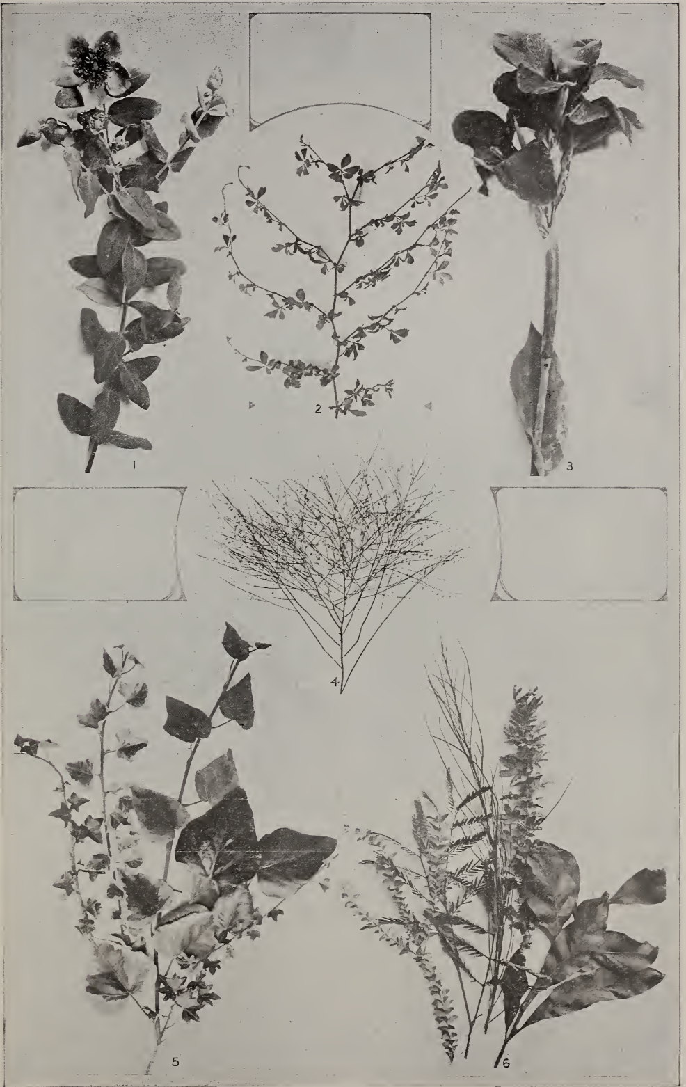
1 Hypericum Moserianum 5 English Ivies