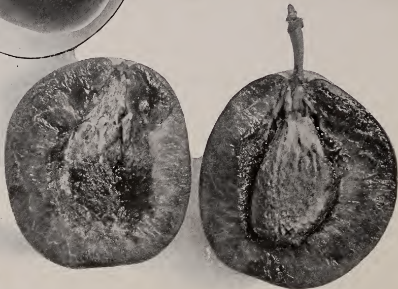
Coates (French) Prune No. 1418 (actual size)

are the result of 30 years of observation, study and experiment. We have no less than 10 varieties in bearing and propagate from the best of these tested, "pedigreed" sorts. The study that Mr. Leonard Coates has given to this matter, the connections we have established in testing varieties in different parts of the State and the large number of trees we have in bearing, enables us to offer to planters nursery trees that will be real money makers.