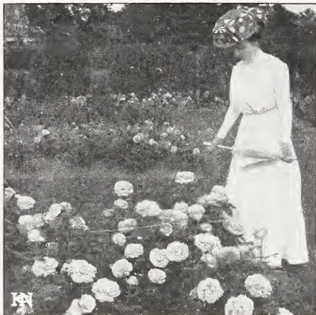
PAUL NEYRON, the largest Rose that grows.

size and vivid effect. A mulching of straw or leaves will greatly benefit them if applied in the fall and allowed to remain until spring. Strong dormant plants from open ground, 2 years old, 60c each; per doz., $6.00.