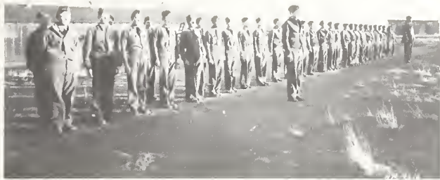
Figure 21. Company lineup in the afternoon after the day's work. No military training was given at the camps, but certain formations are taught to facilitate movement and handling of the men. This photo was taken at CCC Camp 9-NM near Albuquerque in February 1938.