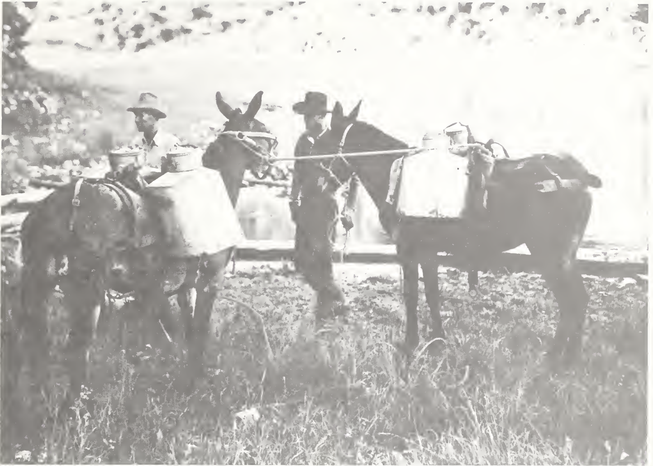
Figure 14. Planting rainbow fry at Latunitas, Carson National Forest. The fry were packed up from Tierra Amarilla hatchery.

mules, two cans to a mule, and took 'em up the Mimbres. On our way back down again -- well, it got dark on us up there, and on the way back down I didn't tie these cans on particularly tight. Here was a string of mules, 10, 11, or 12 of 'em, with loose cans, you know, and we were all joggin' along.