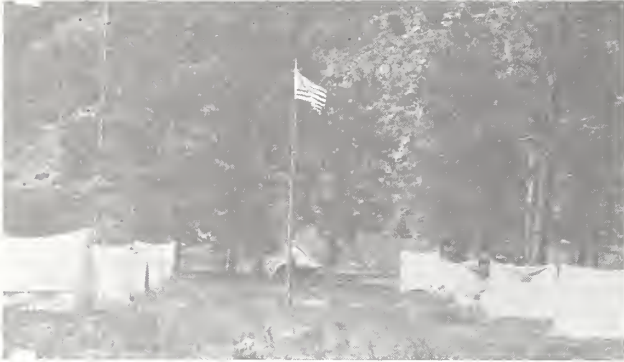
Figure 3. The tent camp used for the combined Alamo-Lincoln Ranger Meeting in 1912.

That was the only District I had on the Lincoln. They abolished the Capitan District when I left there. They combined it with the White Mountain. That was the time they were makin' these enormous big Districts. I had the one at Capitan and one at Alpine. That one at Alpine was so darned big that I know there was a lot of it I never did see.