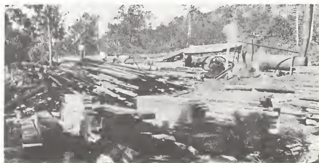
Figure 16. A small private sawmill on the Lincoln National Forest in 1922.

They just put the whole shootin' match into a DC-3 and took 'em right on up into Prescott. They took the same organization right off the Dudley fire and put 'em on the Mingas fire. That was 15,000 acres, and we nailed that one. We got home in time for a 4th of July rest, then went right on back to Safford on the Outlaw fire.