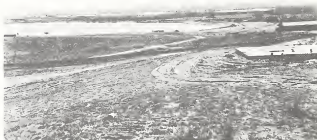
Figure 30. Lake Marvin, shortly after construction, in 1948.

World War II came along pretty soon after the Soil Conservation Service took over the administration of these areas, and with it the problems and the aids that the LU program were able to furnish our Government. We did furnish quite a bit of grass seed, necessary for revegetation or vegetation, of airfields, parade grounds, and other areas where the soil had been disturbed and considerable problems had been involved by dust and erosion. We also furnished land for bombing ranges.