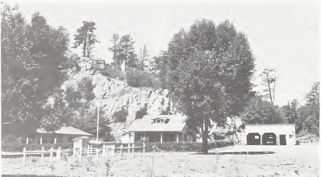
Figure 23. The Beaverhead Ranger Station including the office, dwelling, garage and shop in July 1946 (Kallus).