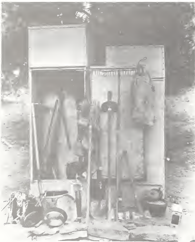
Figure 5. Redstone Fire Tool Cache, Gila National Forest.

The Grand Canyon Unit, to begin with, was an entirely 100 percent pile-and-burn operation with the brush. Then after two or three or four years, they finally went to lopping it, and a little later they went to lopping and scattering. I was on the Grand Canyon Unit until along about the latter part of 1933 when I moved into Williams in the office, and in early 1934 I was promoted to Assistant Supervisor.