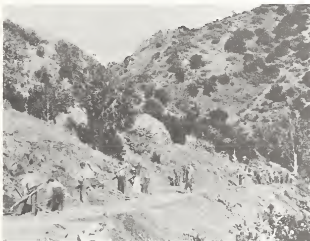
Figure 22. A crew from the Sunflower CCC camp, Tonto National Forest, December 1933.

In this examination, we had to determine the carrying capacity of the ranch, and recommend approval of the improvements that the rancher wished to do, such as water developments, fencing, terracing, reseeding: all types of range improvement work.