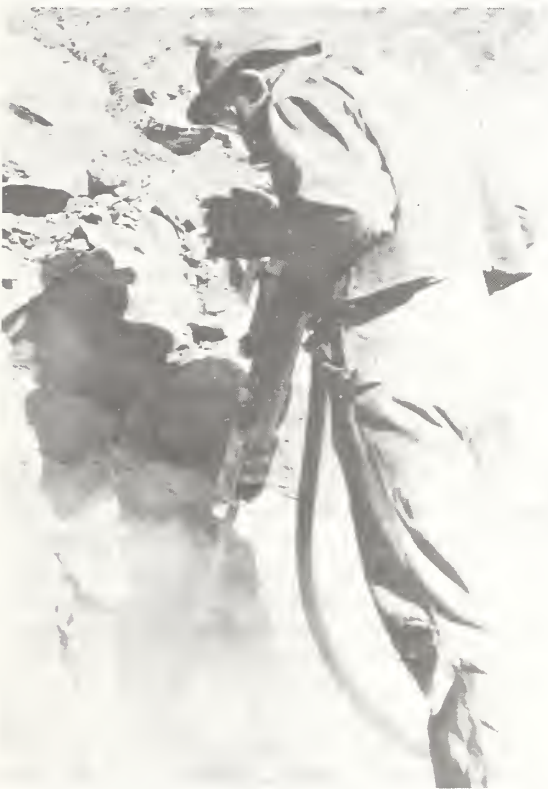
Figure 25. A CCC worker uses an air drill for road work.