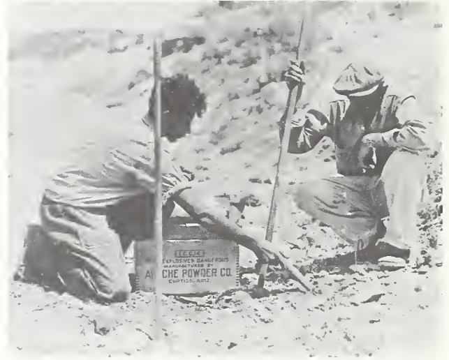
Figure 19. CCC enrollees placing a charge on a Tanque Verde project. The men are from ECW Camp DF-42-A, Coronado National Forest.