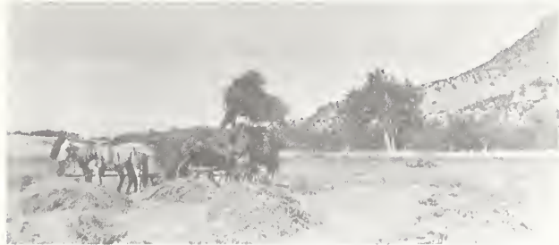
Figure 28. Rangers harvesting hay at the Cave Creek Ranger Station, Chiricahua National Forest; June 17, 1912.

Now those allocations came from the Washington Office, didn't they?