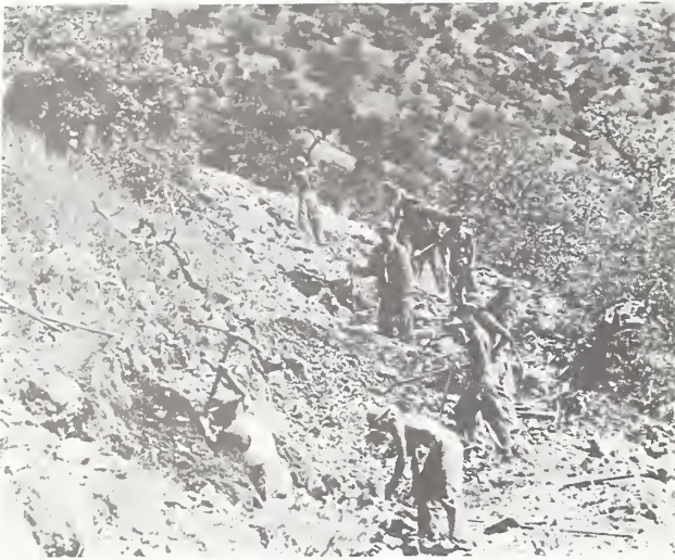
Figure 18. Montezuma Pass road work undertaken by ECW Camp DF-13-A (Sunnyside) workers on Coronado National Forest, August 1934.