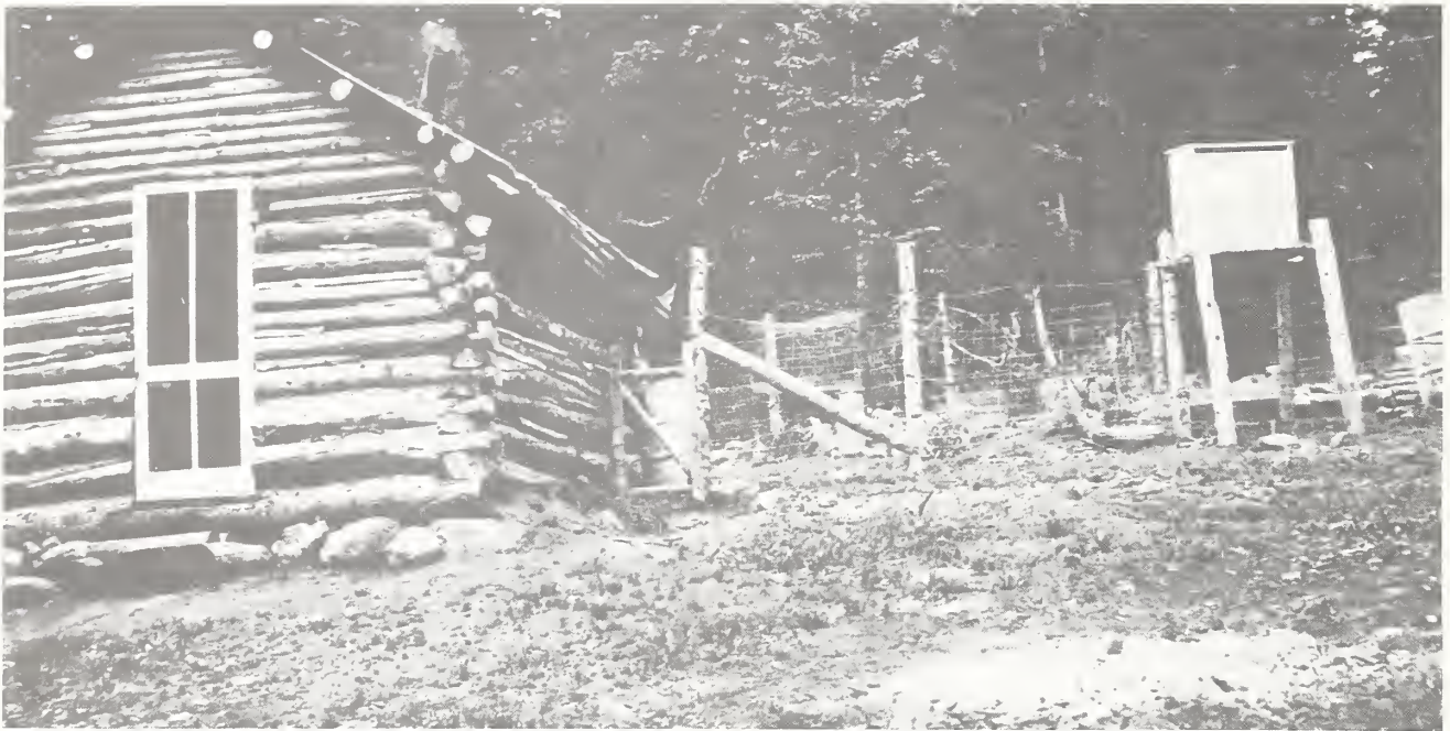
Figure 2. Fort Valley Experiment Station, Flagstaff Arizona. The cabin is in an opening in Engelmann Spruce type. This June, 1919 photo was made by G. A. Pearson.

site that had been recommended by Frank Pooler, Supervisor of the Coconino. Two miles short of our destination a thunderstorm crashed upon us in true Arizona style. The downpour was more violent than usual, so we took shelter in a large barn of the old A-1 Cattle Company. When we emerged an hour later, the normally dry Rio de Flag was running a hundred yards wide with a fluid whose color and consistency told plainly that the country was going to the dogs even in that early day. After crossing the "river," it was only half a mile to the area we had come to see -- a beautiful stand of ponderosa pine. "Here," said Zon, "we shall plant the tree of research."