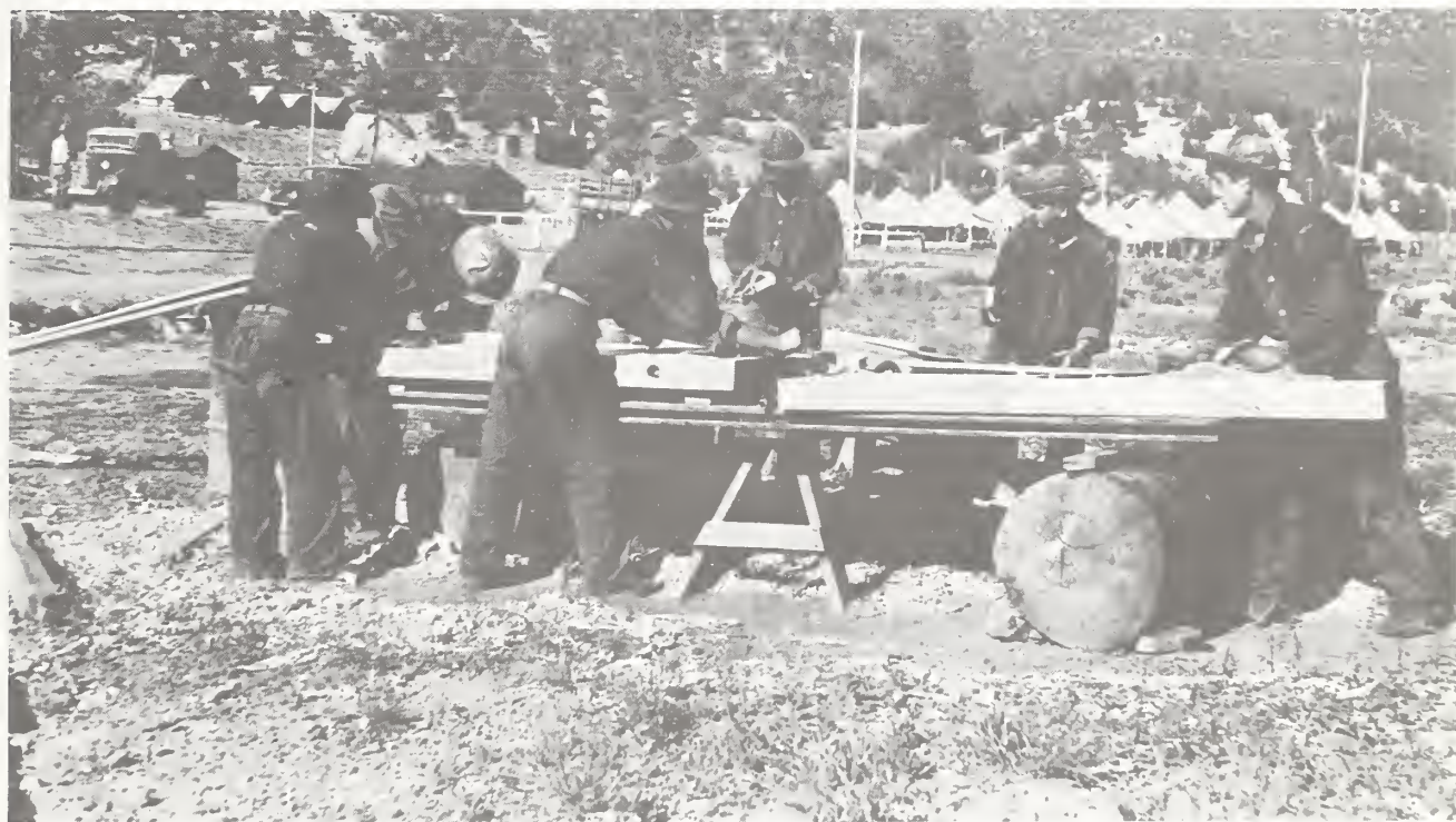
Figure 17. The Civilian Conservation Corps provided some much-needed improvements on the National Forests, and furnished work for many young men. Here men are making picnic tables at CCC Camp F-55 near Borracho Ranger Station, June 1941.

It was primarily the examination of ranches owned by men who had applied for benefits under the Triple A program.