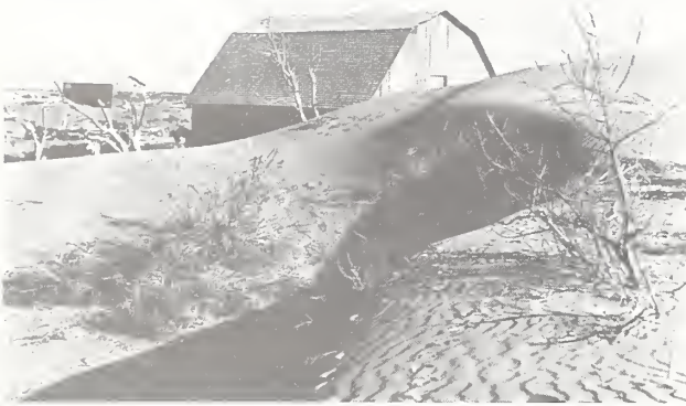
Figure 32. The winds of the dustbowl have piled up large drifts of soil near this farmer's barn near Liberal, Kansas.

of the section. In reality, they were at the northwest corner. They started walking what they thought was towards the office. They walked for about three miles and wound up in a grove of trees. When they got to this grove of trees they realized where they were. So they just sat down and made camp right there in the trees that night and waited until the next morning, 'til it cleared up, so they could come back to the office. They spent the night there in that grove of trees. Lost in a dust storm!