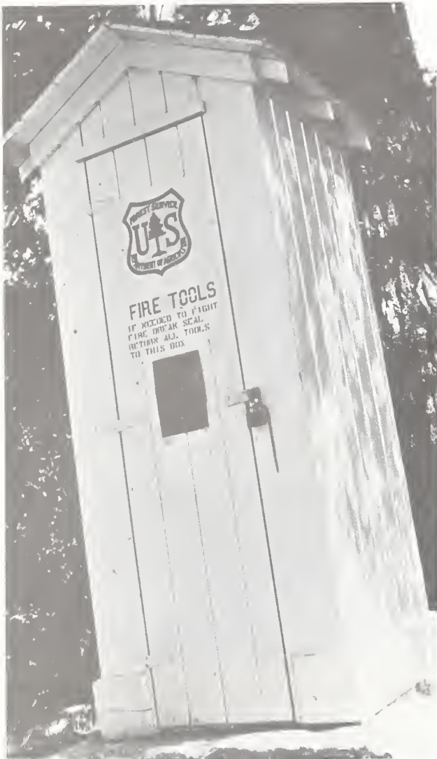
Figure 12. A fire tool box typical of those in use about 1930.

They hadn't started cutting on the North Side then?