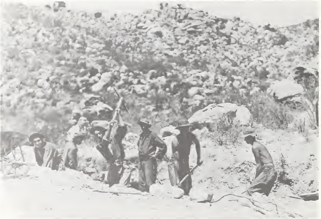
Figure 20. CCC workers from Camp DF-42-A on the Redington Road project, Tanque Verde, Coronado National Forest, in 1934.