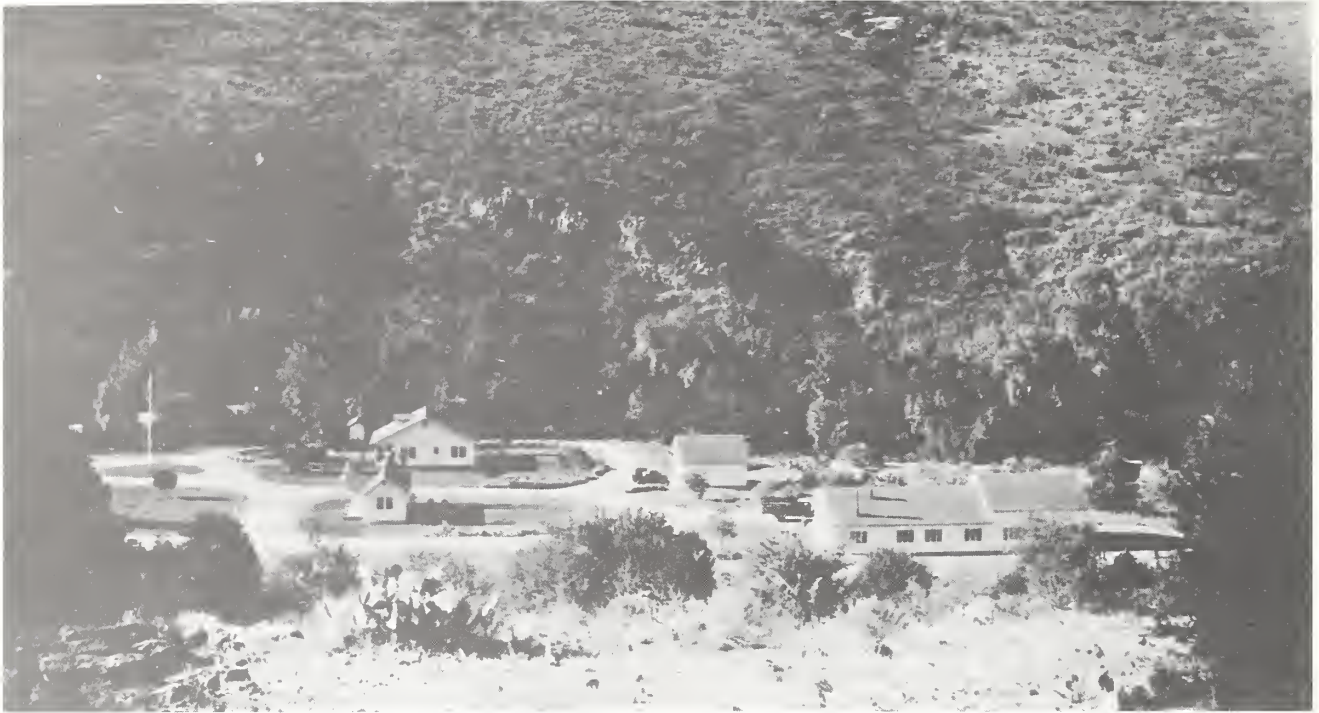
Figure 23. With the advent of the emergency programs in the early 1930s more adequate headquarters were constructed for Forest Rangers. One of these was the Ashdale Ranger Station on the Tonto National Forest seen here in a 1934 view.