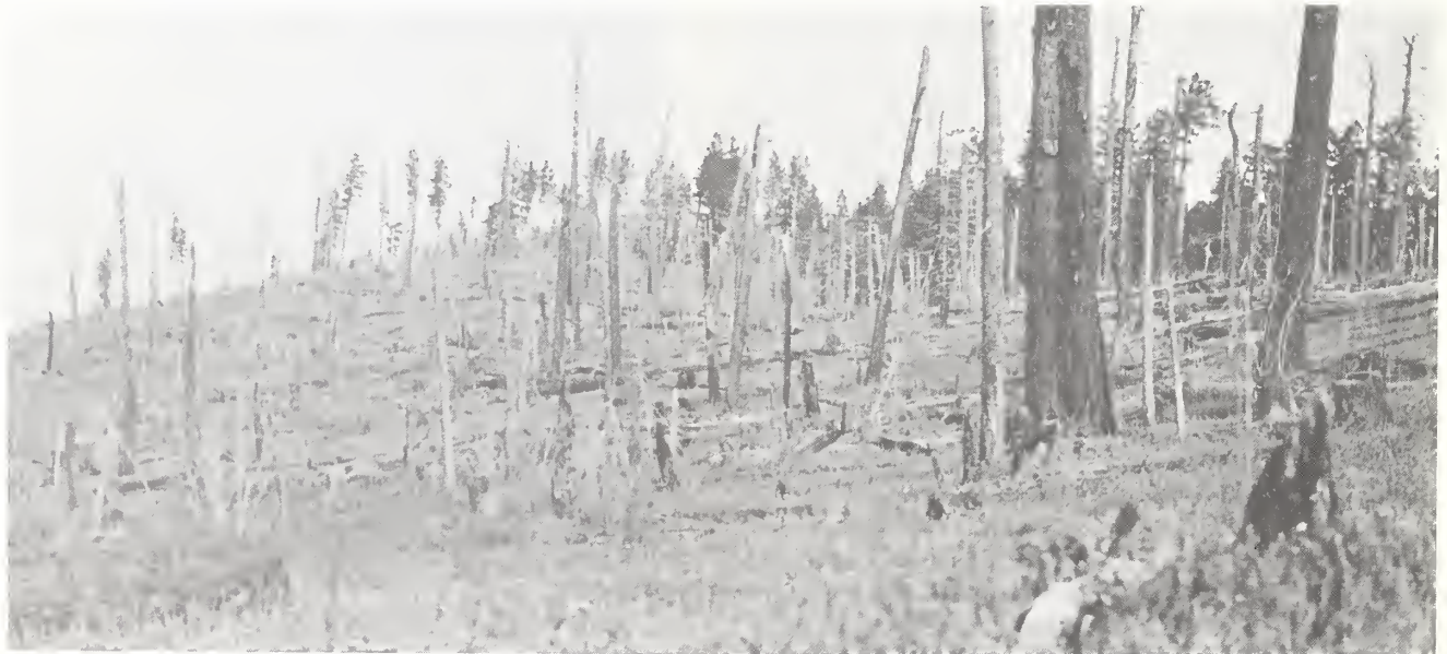
Figure 9. Forest Service land on the Alamo National Forest, trespassed by the Alamogordo Lumber Company in 1907 and subsequently burned over.

How much time was devoted to the various subjects? They spent quite a bit of time on fires, then they hurriedly went over timber, so they could get to the range. The boys were told about Old Maude, the mare you used to ride, and