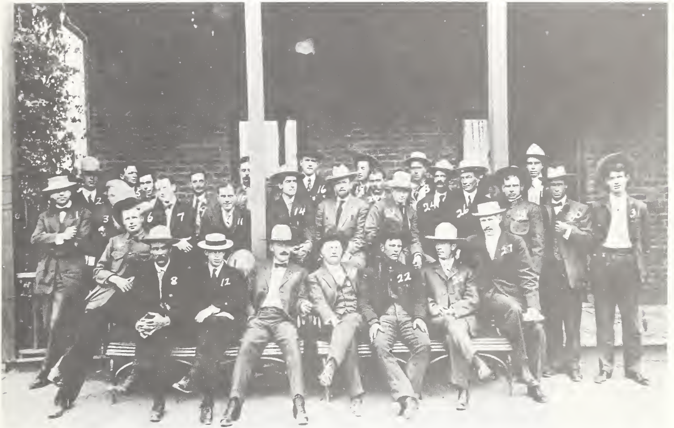
Figure 36. A Ranger meeting at Douglas Arizona in 1908. Included in this photo is the newly appointed District Forester, Arthur Ringland -- the only person whose picture turned out badly.

Transferred to Kaibab N.F., 8/4/34. District name retained.