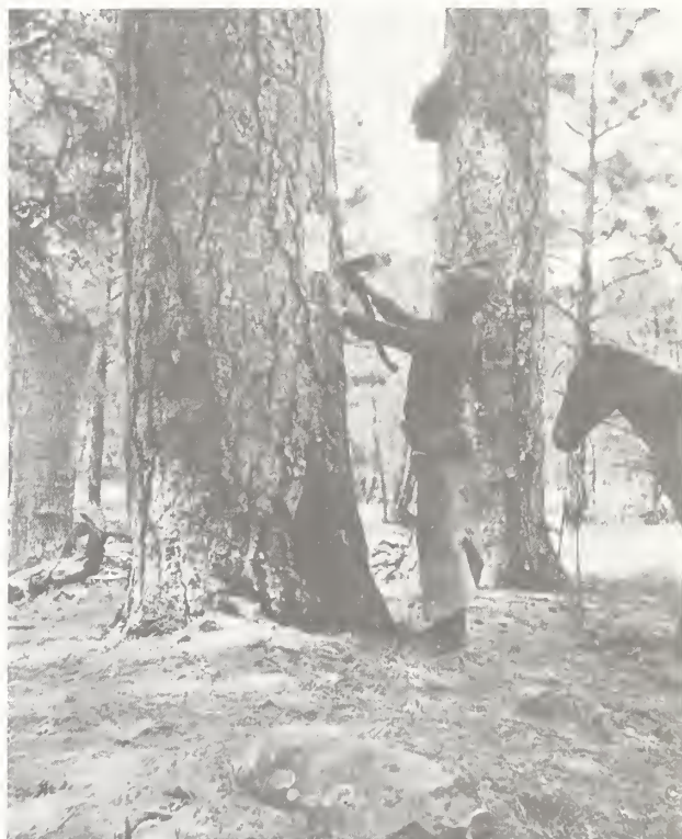
Figure 8. Fire warnings help the tourists and woodsmen to remember to be careful.