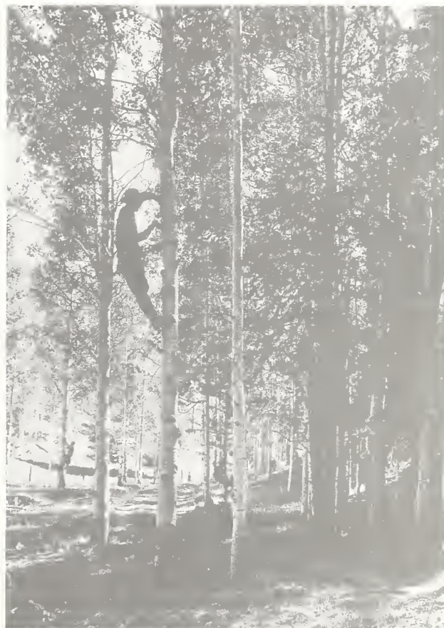
Figure 6. Stringing telephone line on trees on the Kaibab National Forest. Photo by E. S. Shipp dated September 1930.

This is a story handed down to me by Ranger Olson. One time the telephone didn't work -- and by the way, this telephone line ran from Rosemont west up the side of the Santa Rita Mountains to Madera Canyon, and then on up on top of the mountain to Mt. Wrightson, as it was later called. In those days we called it Baldy. I guess there were too many Baldys in the State, so later it became Mt. Wrightson.