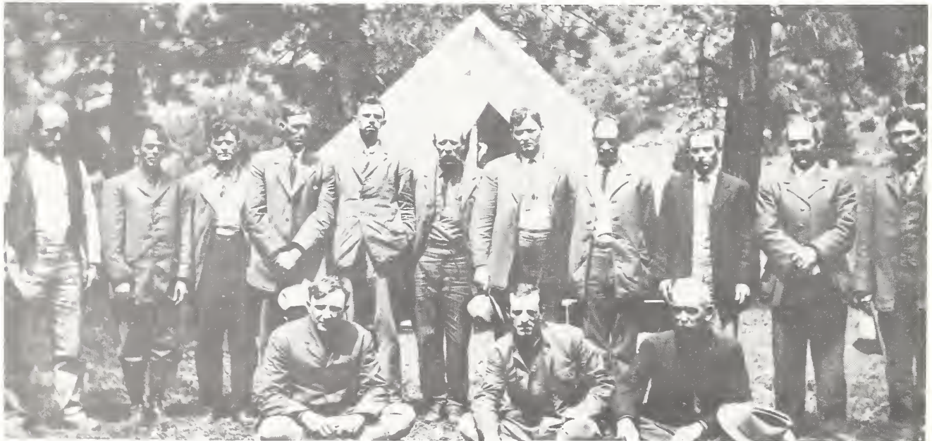
Figure 4. The ranger group at the 1912 Alamo-Lincoln Combined Ranger Meeting..

We went to bed one night and I remember I woke up and