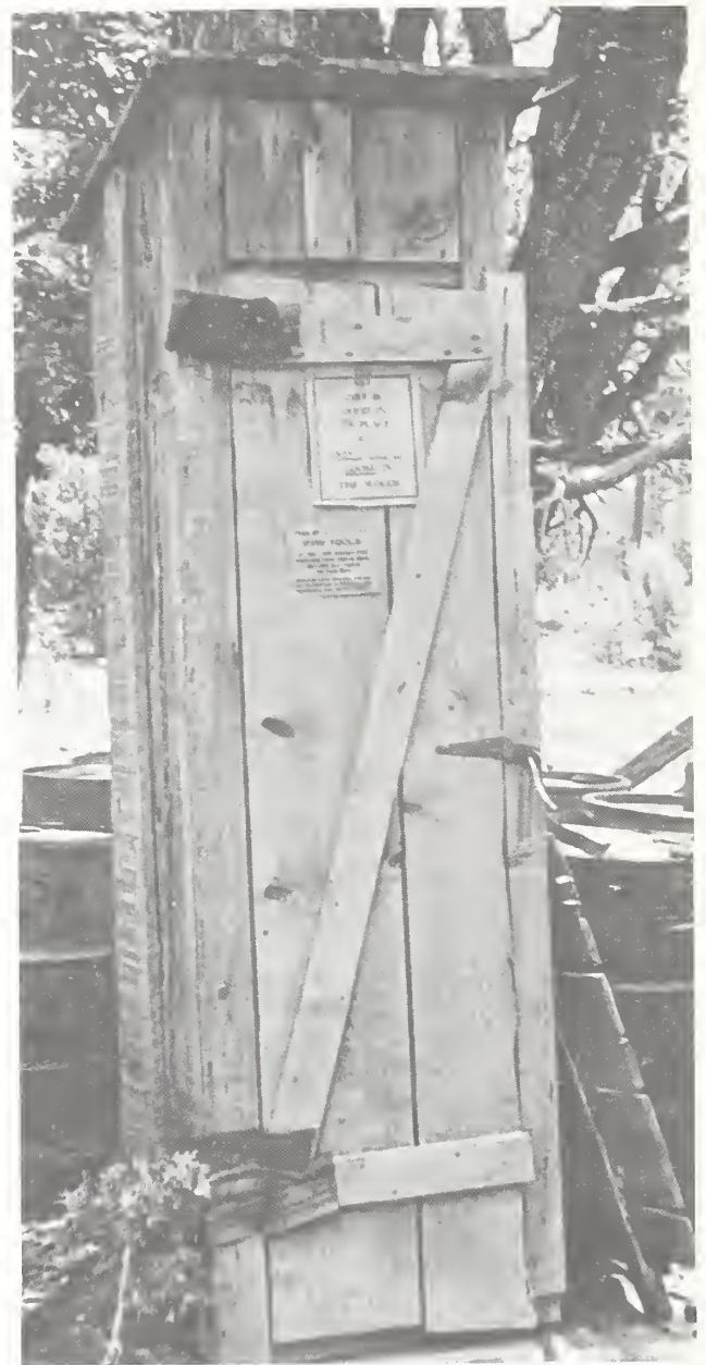
Figure 13. Fire-Tool Box -- A typical fire tool box in use in 1918