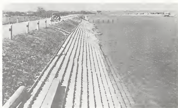
Figure 29. Several of the Land Utilization Projects were used for Recreational Developments. Lake Marvin, near Canadian, Texas.