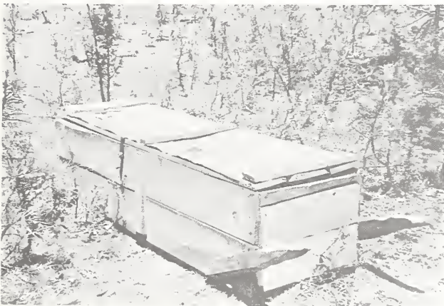
Figure 10. Early day fire-tool box -- closed. Note the crude handles for carrying the tool box.