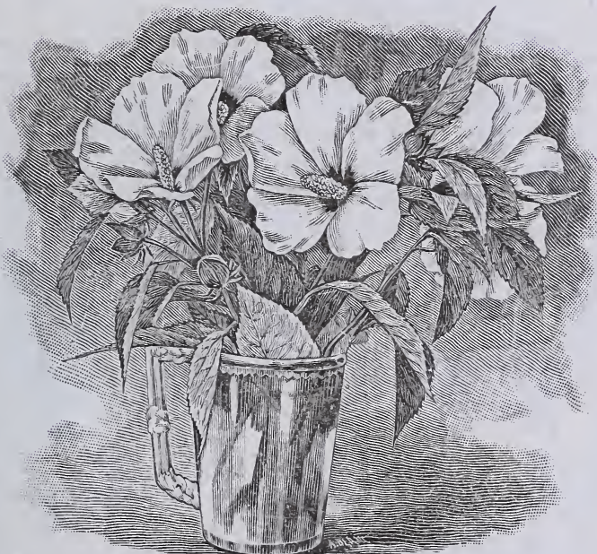
Crimson Eye Hibiscus—See page 4.

WM. F. BASSETT & SON HAMMONTON N. J. U. S. A.