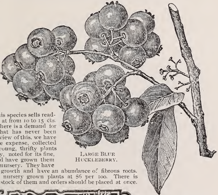
LARGE BLUE HUCKLEBERRY.

The fruit of this species sells readily in market, at from 10 to 15 cts. per quart. There is a demand for good plants that has never been filled, and in view of this, we have at considerable expense, collected a quantity of young, thrifty plants from a locality, noted for its fine, large fruit, and have grown them a year in the nursery. They have made a good growth and have an abundance of fibrous roots. We offer these nursery grown plants at $6 per 100. There is only a limited stock of them and orders should be placed at once.