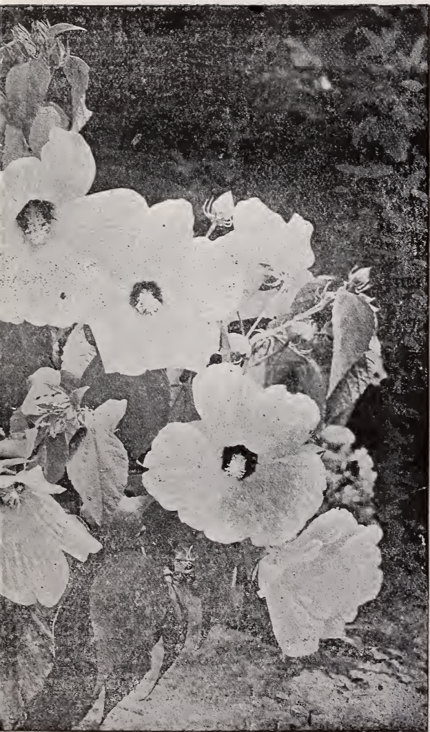
---from a Photograph.