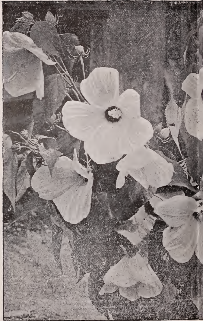
Crimson Eye Hibiscus-