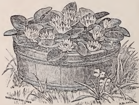
Nymphaea odorata minor grown in a butter tub. Photographed at our Nursery.

One ounce . . . . . $1. One fourth pound, . . . . . $3. One pound, . . . . . $10.