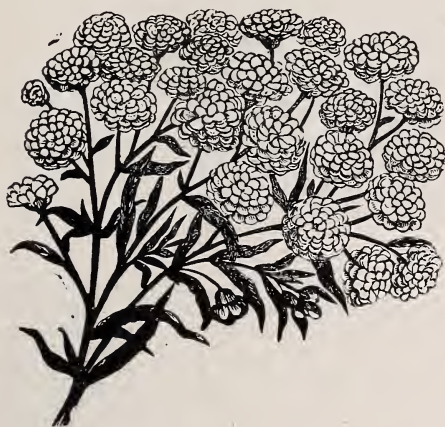
ACHILLEA, THE PEARL.

T HE following plants have special merit and we give a short description of each for the benefit of those not entirely familiar with them. We have also had several of them illustrated by wood engravings. Duplicate electros of these can be obtained of us at specially low prices to those who wish to catalogue these plants and buy stock of us. An alphabetical list of plants will be found in the back of this catalogue containing many other species that are interesting and desirable in extended collections. These are the cream.