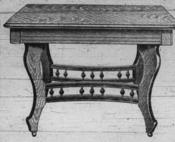
feet: Elm, Antique Finish .