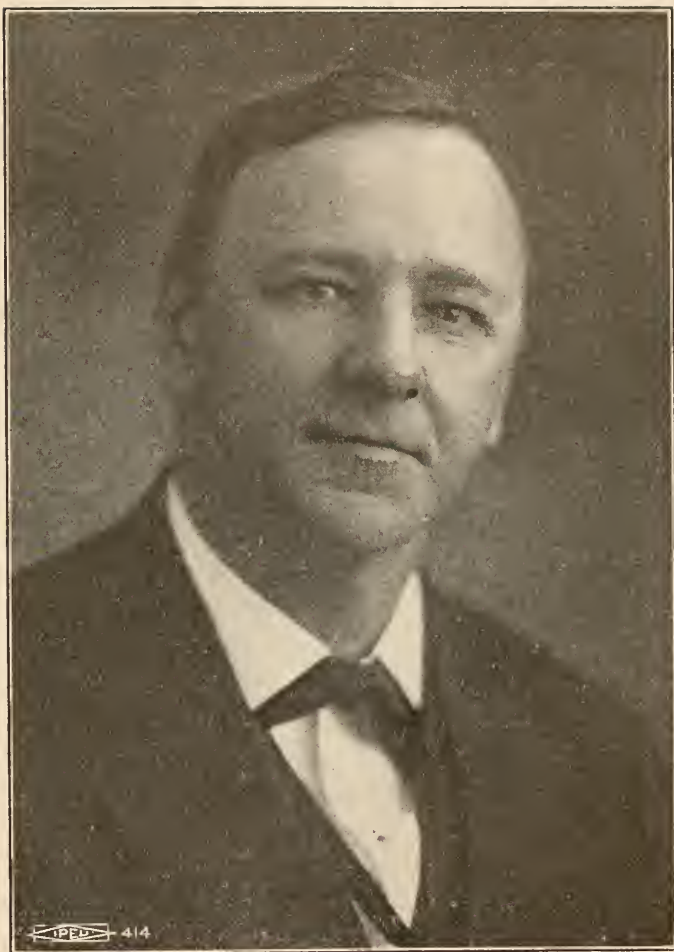
HON. JOSEPHUS DANIELS Secretary of the Navy.