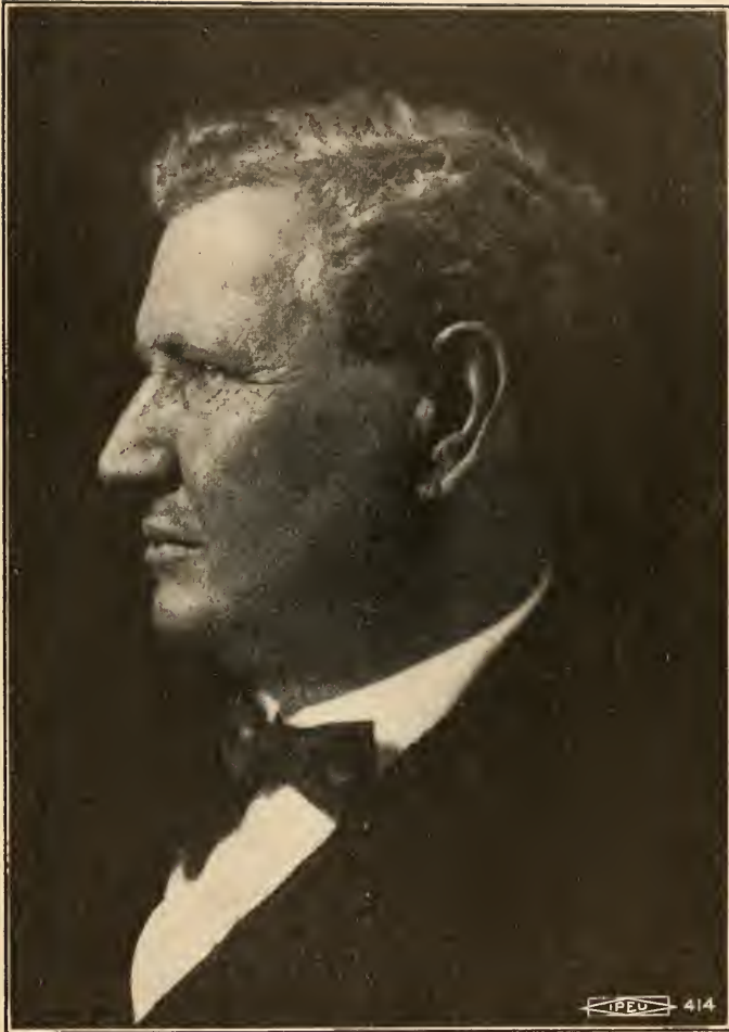
HON. WILLIAM B. WILSON Secretary of Labor.