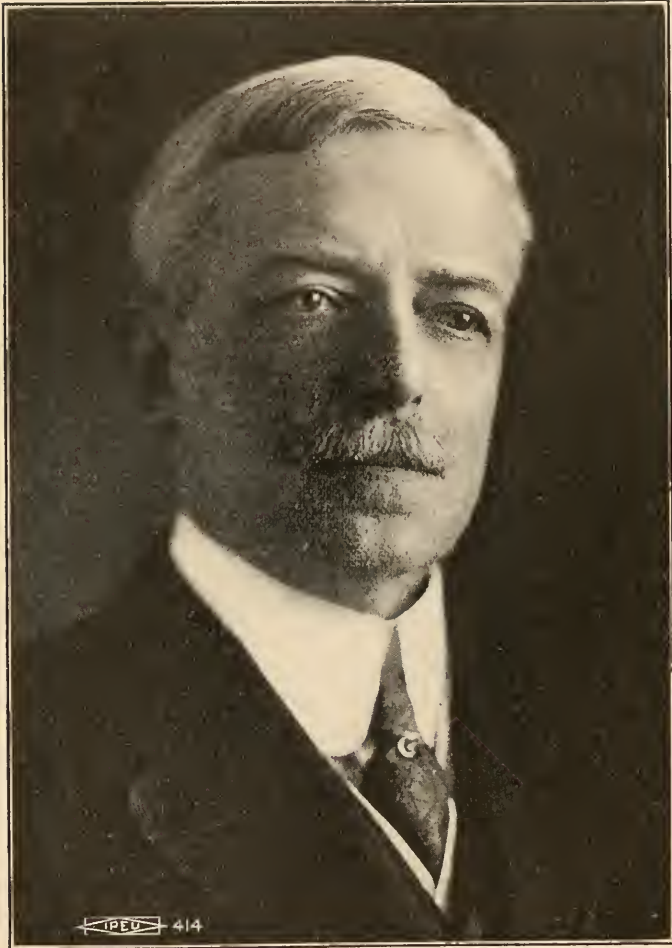
HON. ROBERT LANSING Secretary of State.