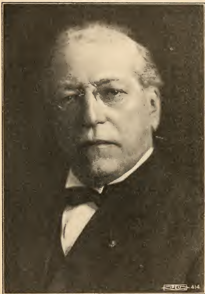
HON. SAMUEL GOMPERS President of the American Federation of Labor.