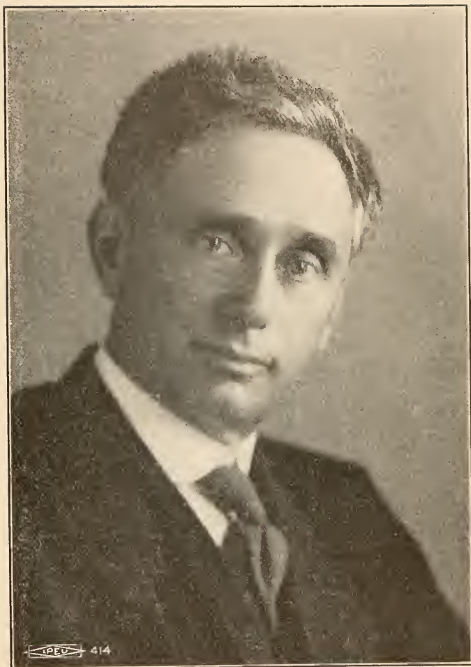
HON. LOUIS D. BRANDIES Associate Justice U. S. Supreme Court.