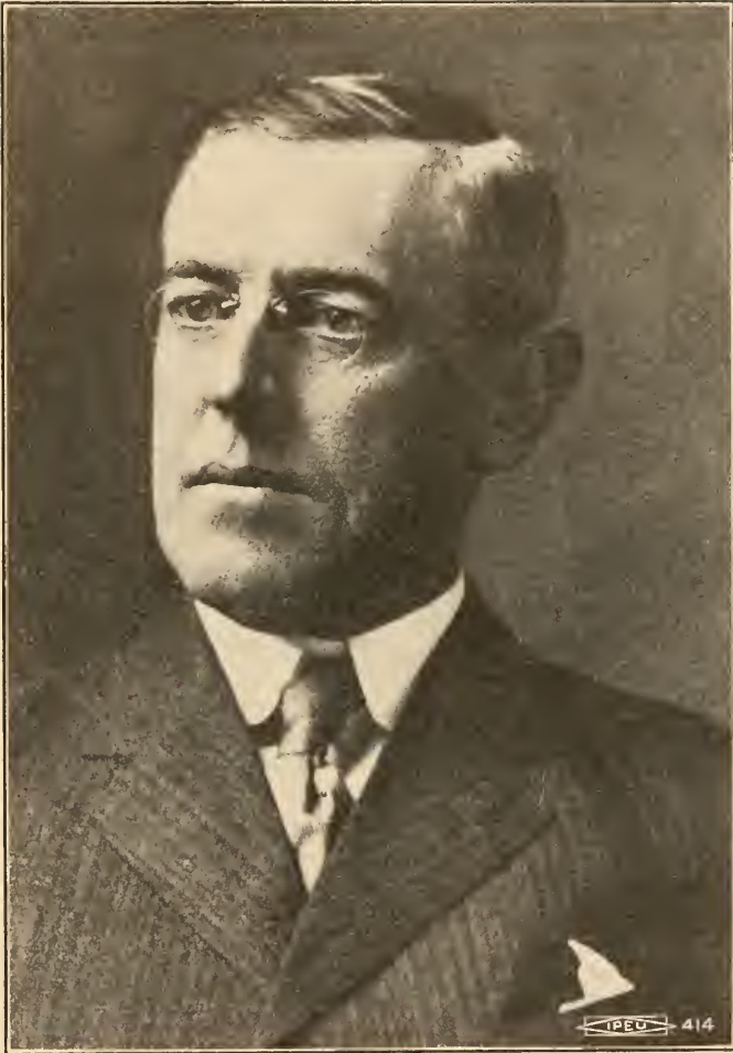
HOH. WOODROW WILSON President of the United States.