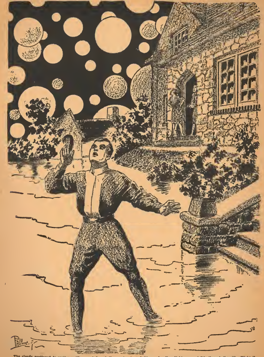
The clouds continued to scatter until several fary balls varying in red, blue and yellow light, were visible through the rift. Might it be that the inhabitants of Pleasantown were celebrating the cassation of the deluce in a most extraordinary manner?