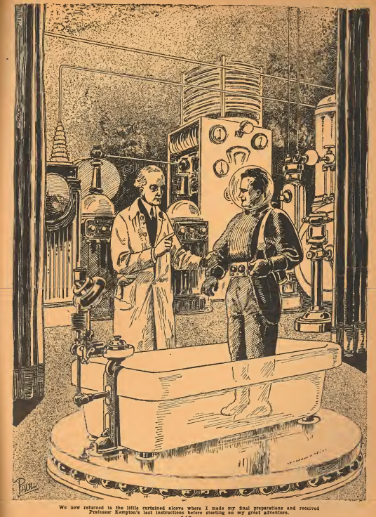
ons before 643