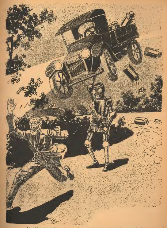
Fortmately for him, he did not glimpse the unknown thing behind the car, for this being was employed in gripping and raising the little car with its freight of milk-cans filled with the prohibited liquid. After he had littled the car above his head at full arms' length, he ran a little way with it . . .