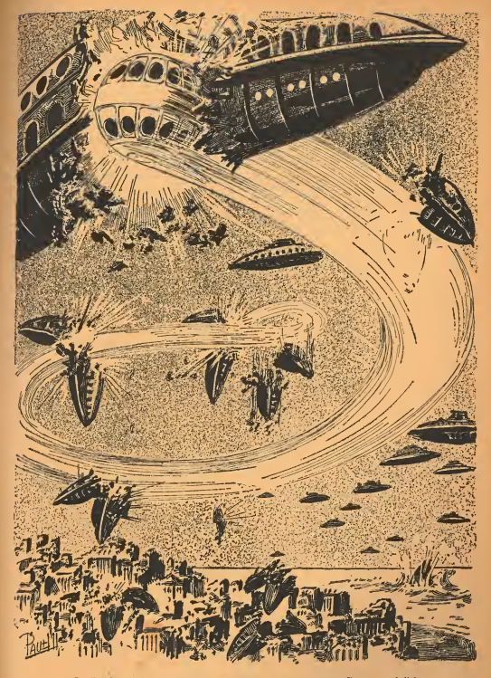
The Skylark darted forward and crashed completely through the great airship. . . . She was an embodic thunderbolt; a buge, irresistible, indestructible projectile, directed by a keen brain inside. . . .