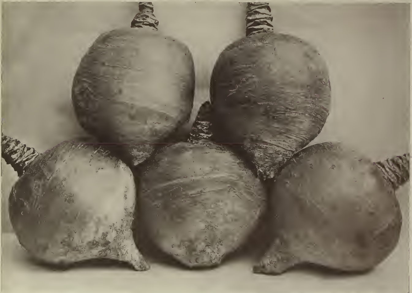
DANIELS' DEFIANCE GREEN-TOP SWEDE.