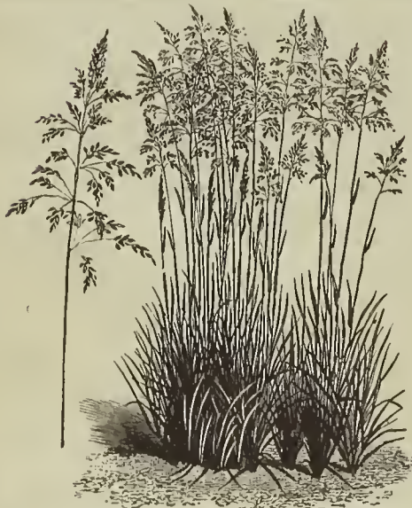
SMOOTH-STALKED MEADOW GRASS.