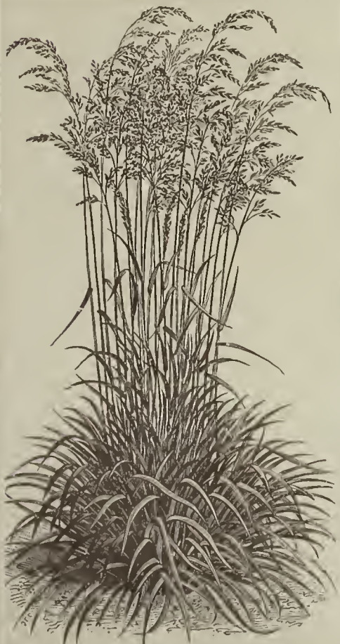
TALL MEADOW FESCUE.