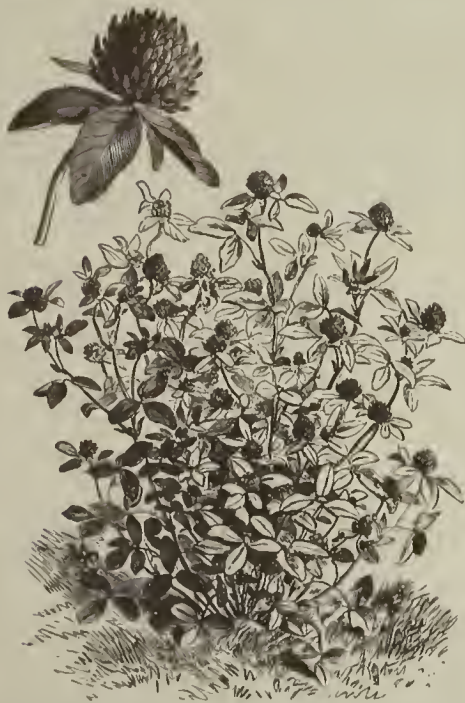
BROAD-LEAVED ENGLISH RED CLOVER

Daniels' Giant Red Clover. A fine strong growing Clover, producing a heavy crop, and has the advantage of standing longer than the ordinary Red Clover. Highly recommended. Sow 16 to 20 lbs. per acre.