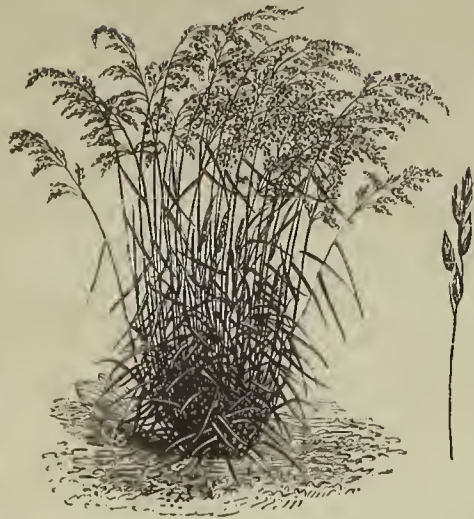
WOOD MEADOW GRASS.