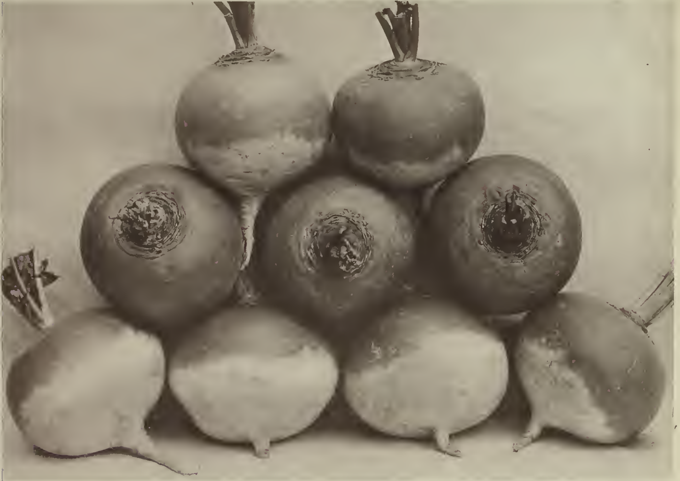
DANIELS' NORFOLK GREEN ROUND.

Sow in May or early in June for Summer feeding, and in July and August for late Autumn or Winter use.