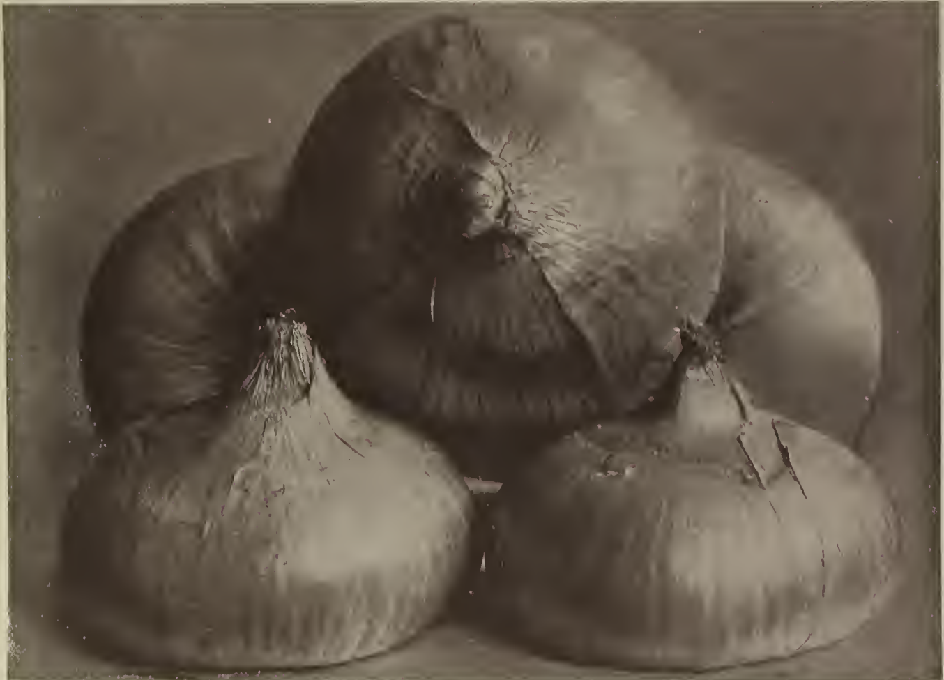
DANIELS' IMPROVED WHITE SPANISH. Reduced from a Photograph.