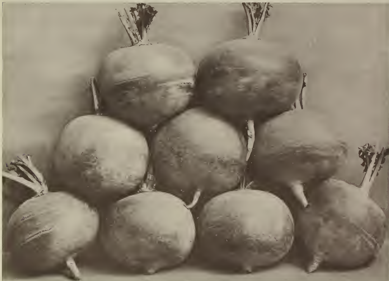
DANIELS' GREEN-TOP YELLOW SCOTCH.

Yellow-fleshed Turnips should be sown in June or July. The produce is much more nutritious than that of the White-fleshed varieties, besides which, they are hardier and better keepers.