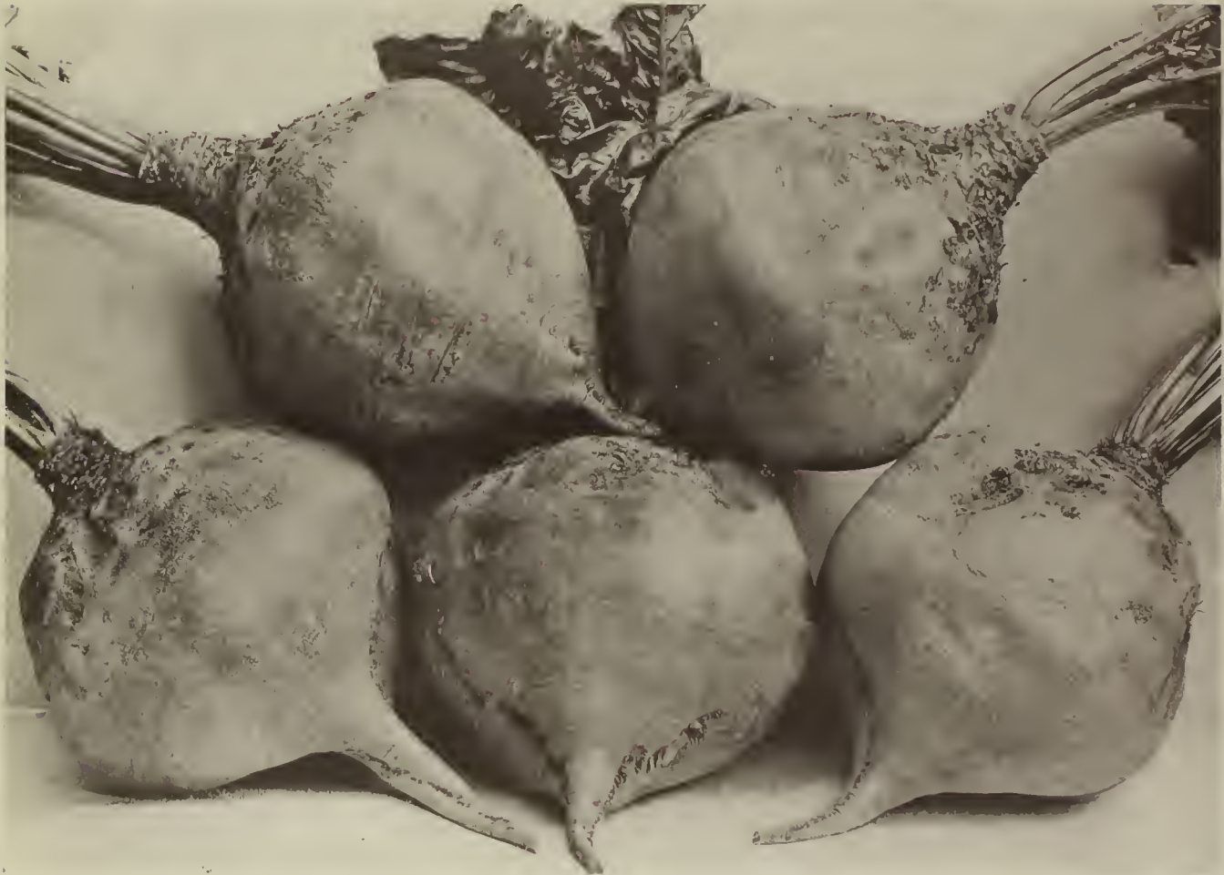
DANIELS' SELECTED YELLOW GLOBE.