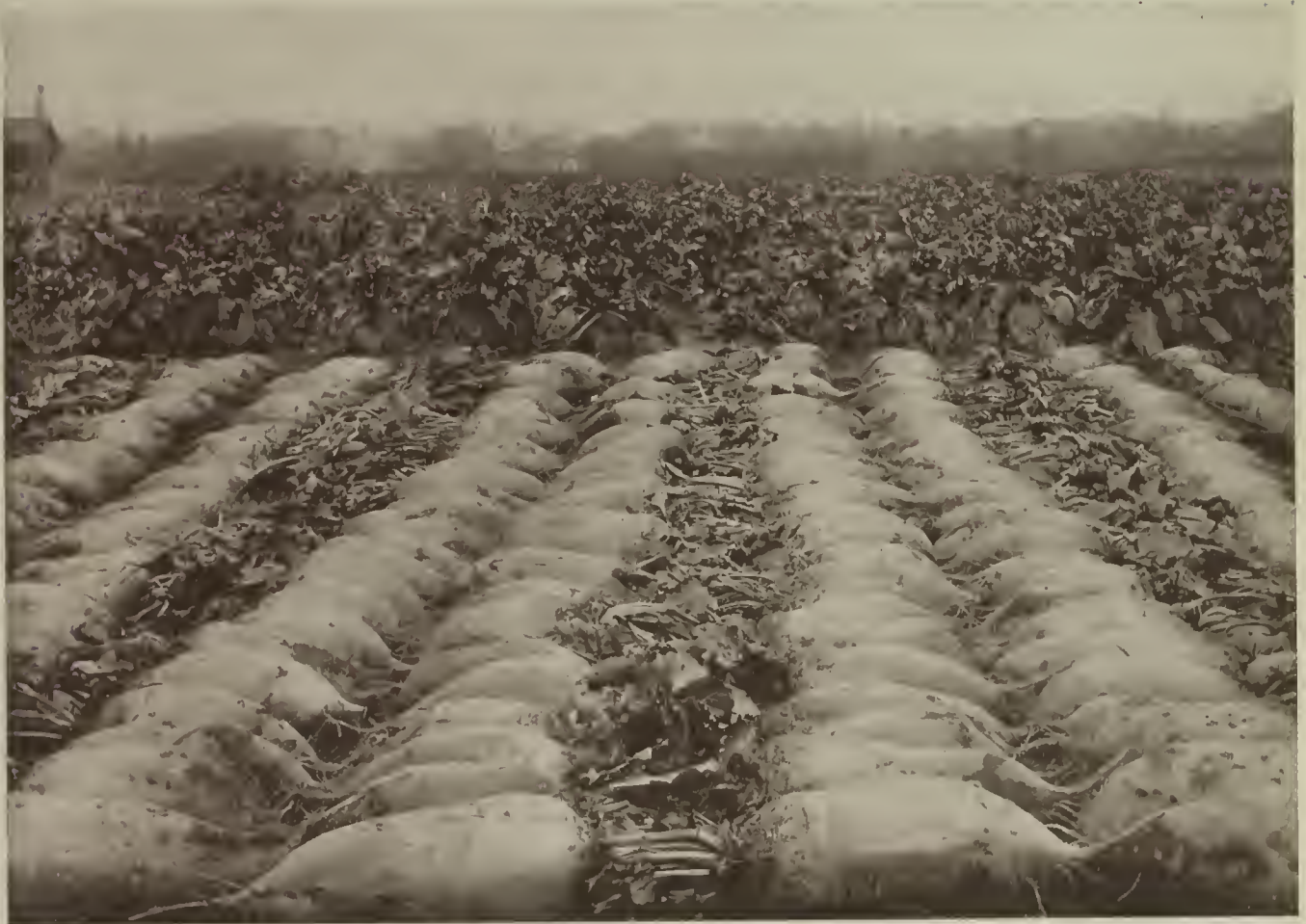
DANIELS' IMPROVED GATE-POST.