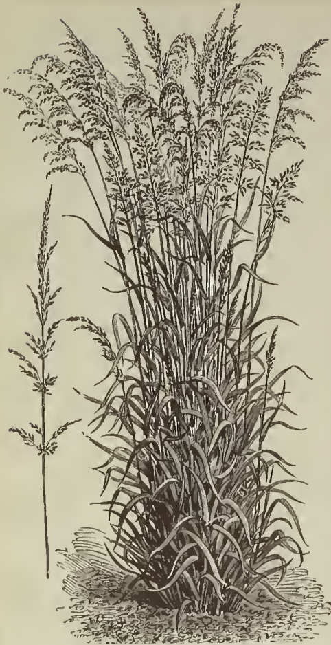
TALL OAT GRASS.