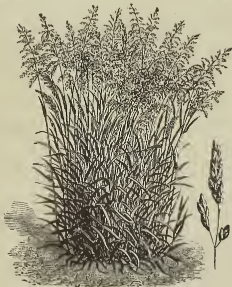
ROUGH-STALKED MEADOW GRASS.