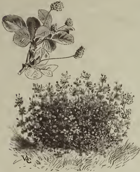
TREFOIL OR BLACK.

EXTRA MACHINE CLEANED, AND OF TESTED GROWTH.