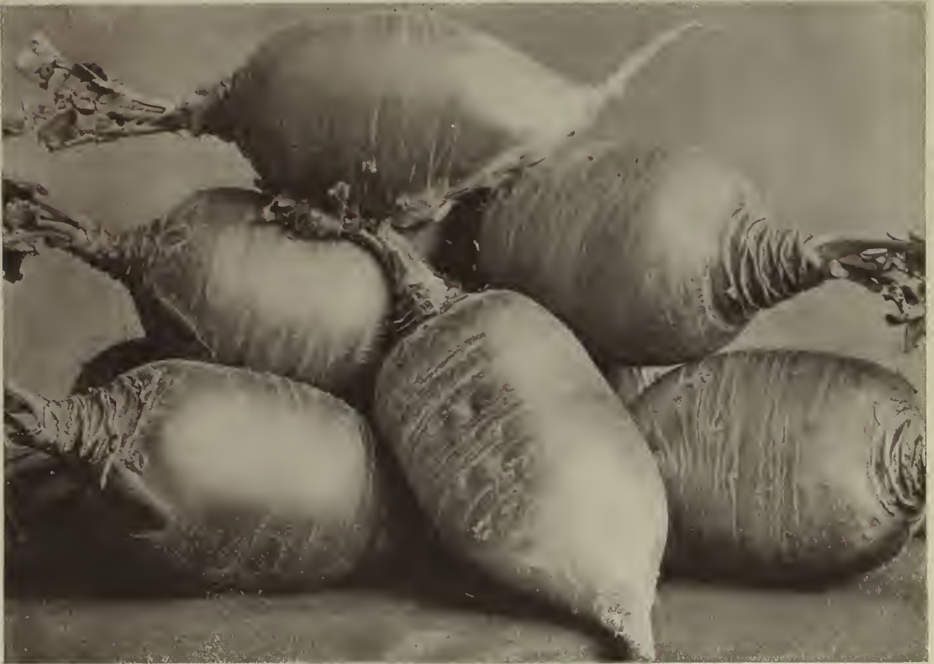
DANIELS' NORFOLK GIANT SWEDE.