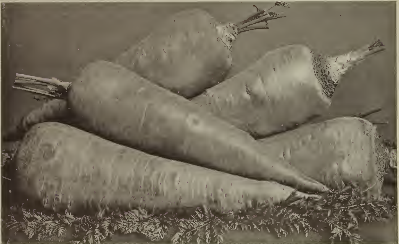
CARROT, DANIELS' GIANT YELLOW INTERMEDIATE. Much reduced from a Photograph.

The cultivation of Carrots as a field crop has been much on the increase of late years, and where the soil is favourable, they undoubtedly constitute one of the most profitable crops for the farmer. Carrots contain a large proportion of saccharine matter, are highly nutritious, and all kinds of stock will eat them with relish. They are of especial value as a food for horses, and are always in demand as a marketable article. A rather light, deep and fairly rich soil is the most favourable for growing really good Carrots, and the ground should, if possible, be deeply ploughed in Autumn or early Spring, using a sufficiency of well-decayed manure. Fresh manure applied immediately before sowing being detrimental to the good form and quality of the roots.