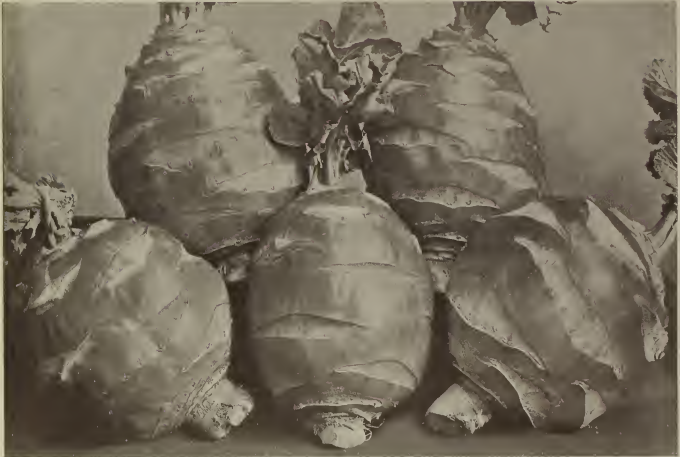
KOHL RABI, DANIELS' LARGE GREEN. Much reduced from a Photograph.

This may be described as a Cabbage with a very much expanded stem, having somewhat the appearance of a Turnip. It is exceedingly hardy, highly nutritious, and is eaten with avidity by horses and all kinds of cattle and sheep. It is less liable to attacks of insects and mildew, and resists drought better than Turnips. It yields an excellent crop, and is of especial value for feeding milch cows, not imparting that peculiar, strong taste to the milk which it so often acquires when the cows are fed on Turnips. The seeds should be sown, on well prepared ground, in April or May, in drills eighteen inches or two feet apart, and the plants thinned out to about a foot apart in the row. The seeds may also be sown in March or April on beds for planting out in the way of Cabbages, and plants raised in this way will be found very useful for filling up any blank spaces amongst the Mangels or other root crops. Where the seed is drilled, about 4 lbs. to the acre should be used; when sown for planting out, 2 lbs. to the acre will be sufficient.