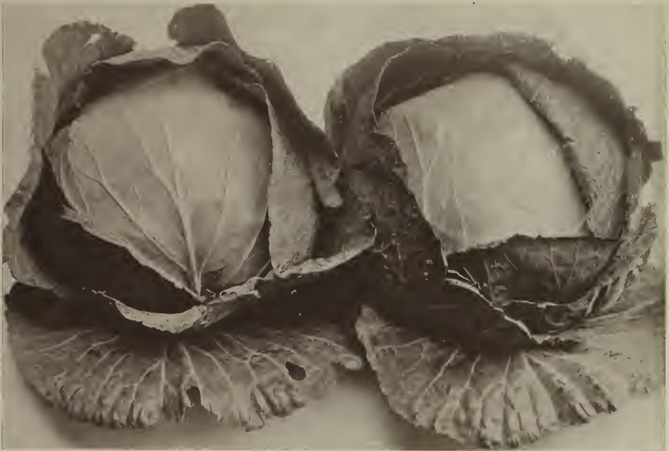
DANIELS' EARLY DRUMHEAD CABBAGE.