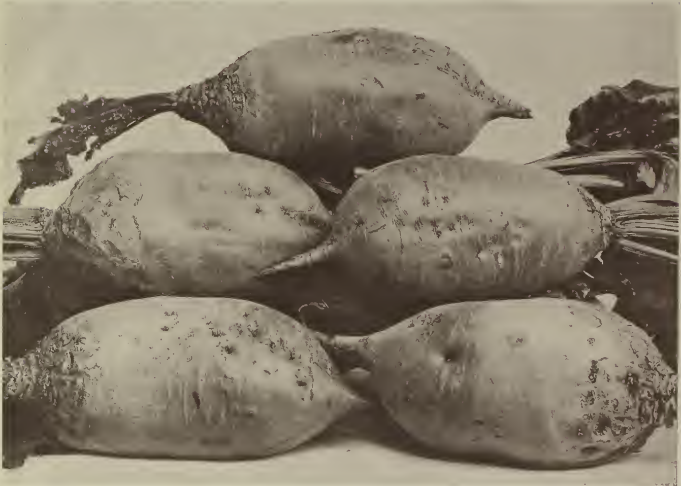
DANIELS' SELECTED GOLDEN TANKARD.