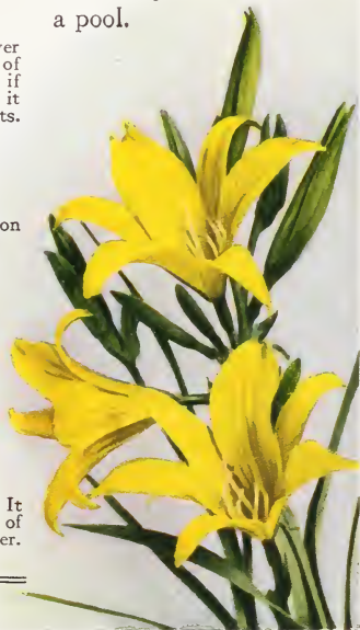
Hemerocallis, Yellow Day Lily

A CHARMING bit of landscape. The flowers do not need the water, except to reflect their charm. Iris seem to fall heir to such a location. Hemerocallis also fits in well, as the picture shows. And Lilies, Lythrum, Foxglove, Veronica—all have virtues worth reflecting. The birds are always the happier for a pool.