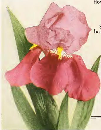
Iris pallida , Her Majesty

T HIS proves further that flowers fit in almost anywhere. Here they are used as a veneer to shrubbery. Very often shrubbery has spent much of its blooming energy by midsummer. Hardy flowers keep up its courage, giving color when the landscape would otherwise look somber. Any of the vigorous-growing flowers will qualify: Peonies, Iris, Phlox, Hibiscus, or Funkia. If there is anything peculiar about your soil, we shall be more than pleased to tell you all we know.