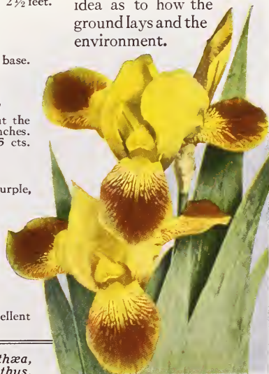
Iris variegata honorabilis

ANYONE can have a garden just as pretty as this. It takes some planning, of course, but it is surprising how little. What a satisfaction there is in being able to take your friends into such a haven of beauty. As with any of your horticultural problems, we will gladly assist when invited. All we want is the dimensions. A photograph is mighty helpful to give us an idea as to how the ground lays and the environment.