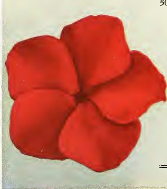
Phlox, Baron Van Dedem

PHLOX, THOR. Salmon-pink with a deep red eye. Individual flowers are as large as a half-dollar. A rare and handsome variety. 50 cts. each, $4 for 10, $30 per 100.