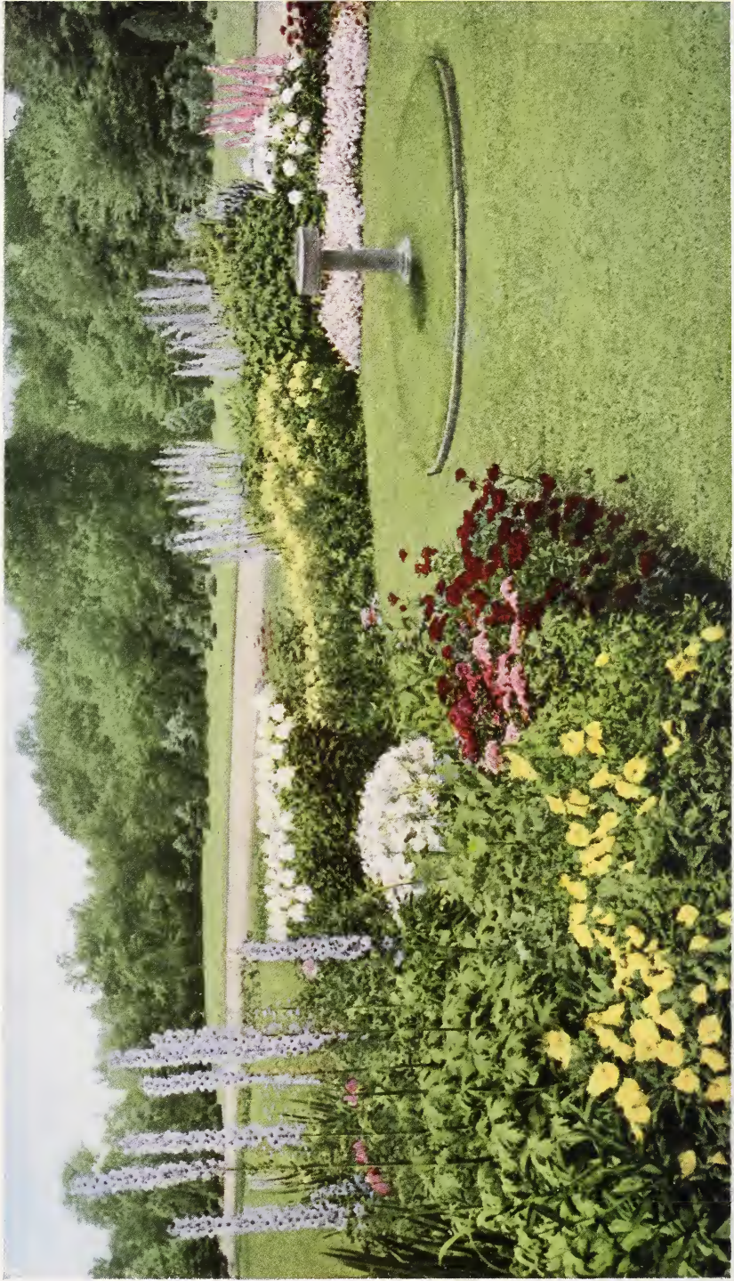
"If I only had a garden like that"—enough said. You have the desire, we have the material and the willingness to help. The rest is mere detail, and we will take care of that if you say so. The blue flowers are Delphiniums; yellow, Gnothervas; red, Sweet Williams; white, Phlox.