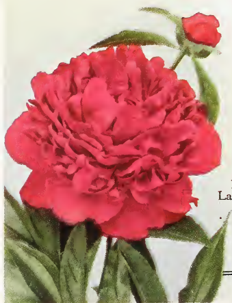
Pæonia, Felix Crousse

T HE spaciousness—the broad restful vista—that is here impressed upon you is not due so much to a large expanse of ground as to the art of good landscaping. Want us to help you apply some of this art to your grounds? Say the word and you shall have our coöperation. That's what we are here for and nothing would give us more pleasure. Why not achieve the highest beauty of which your grounds are capable? If you are not too far away, we can have a representative call. Otherwise write us fully.