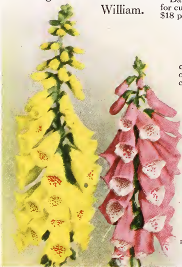
Digitalis , Foxglove

F LOWERS, and plenty of them. Such a border as this never lacks interest, because something is aglow all the while. It's one thing after another the whole season through, and most of the time the array is intensified by a concert of bloom. Perpetual satisfaction and a flower border are synonymous. The flowers in bloom in the illustration are: Digitalis and Sweet William.