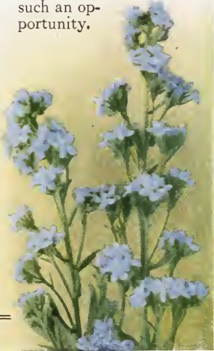
Anchusa italica, Dropmore

A MOST attractive garden. Anyone can have a garden just as lovely. It's the flowers that make it beautiful. They give beauty for the sunshine, fragrance for the dew, and a profusion of each for the rain. They fill the atmosphere with gratitude. Have you a path? Make it a beautiful path—a path that you and your friends will delight to stroll down. If we can help you in selecting the flowers or arranging them, it will be a real pleasure for us to do so. We are anxious for just such an opportunity.