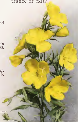
Oenothera fruticosa Youngii

THE picture tells its own story. There can be a garden atmosphere, even in the terrace steps. The plants, of course, grow between the stones or bricks. Are they happy? Look at their countenances. The plants that we have, elsewhere in this book, recommended for wall-planting are likewise suitable for this use. They seem to delight in the moisture in the stones. Could you have a more fitting garden entrance or exit?