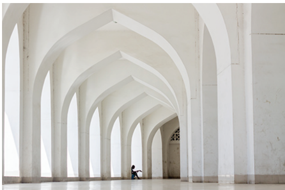
(A lonely reader in (yes, again!) the Baitul Mukarram National Mosque in Dhaka gives a peek into a totally different side of the same building. Placed 7th in the International WLM 2017.)