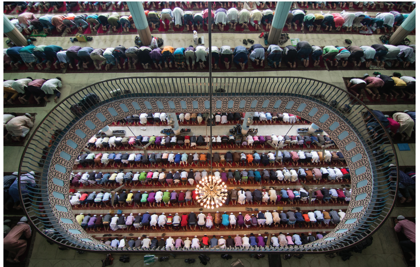
(The Baitul Mukarram Mosque in Dhaka is the 10th largest mosque in the world and was here photographed during peak hour, the Jumma prayer in the early afternoon. Placed 3rd in the International WLM 2017.)

Wiki Loves Monuments & Wiki Loves Earth in Bangladesh turned into a comprehensive photographic database of the country's archaeological & natural heritage sites. The contests documented photographs of almost 400 of the 452 government listed archaeological sites and 40 of the 51 government listed protected sites of Bangladesh. These contests not only provided the opportunity to build a comprehensive photographic database of archaeological & natural heritage sites of the country, but they also helped in revealing the present conservation status of the sites and buildings.