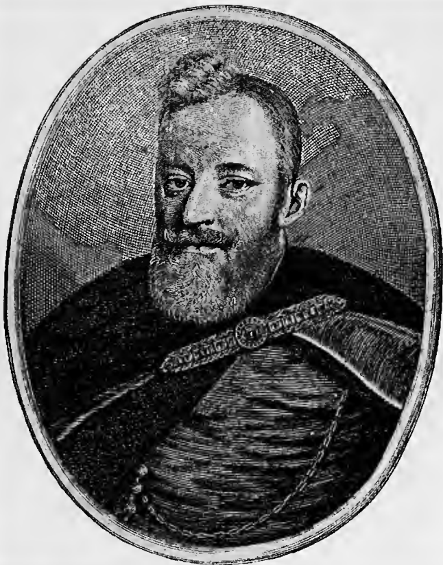
YERZY OSSOLINSKI, CHANCELLOR OF POLAND.