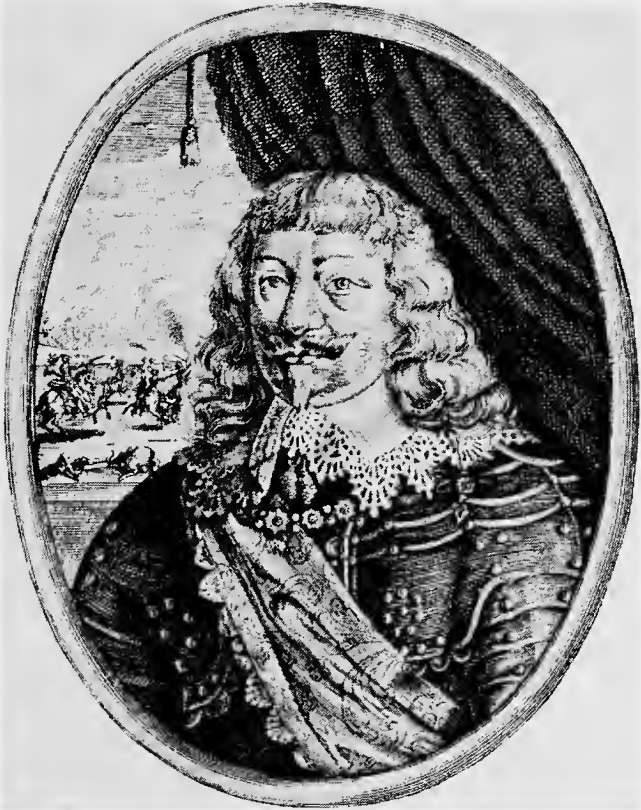
VLADISLAV IV., KING OF POLAND.