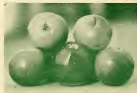
The CLOSE Apple

This variety, tested as U. S. D. A. No. 57, ripens with or slightly ahead of the Yellow Transparent. It appears to adapt itself over a wide growing area. The fruit is medium to large size averaging 2 1/2"; fair to good quality, suitable for both dessert and cooking. The fruit develops a bright, attractive color when full ripe but when grown for the large commercial markets would have to be picked with 1/4 to 1/2 color. It seems to stand high summer temperatures well, thereby making it desirable in early apple producing areas of the South. The tree is vigorous, productive annual bearer and comes into fruiting while the trees are young. This variety has outstanding promise as an EARLY RED APPLE ADAPTED TO BOTH HOME AND COMMERCIAL ORCHARD PLANTINGS.