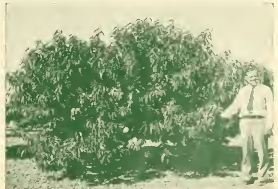
BOUNTIFUL RIDGE GROWN TREES ABSOLUTELY PLEASE

"It Pays to Plant Bountiful Ridge Grown Trees and Plants"