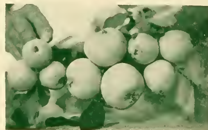
Photograph showing relative size of Wrixparent over its two nearest competitors. Left, Transparent; center, Wrixparent; right, Lodi. Note size. All picked the same day, June 19th, 1941.

"America's Earliest Apple - Ripening Two Weeks Before Yellow Transparent!"