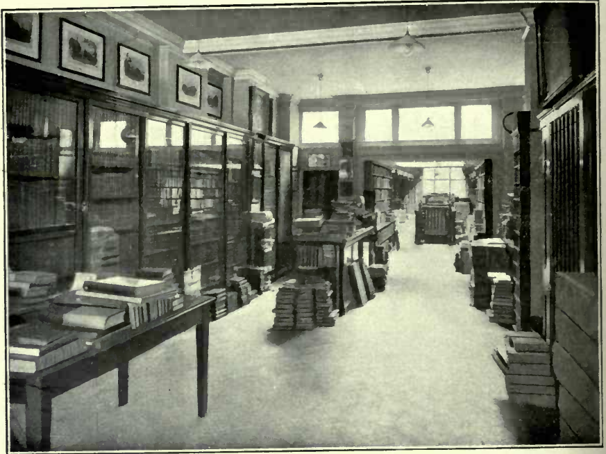
Entrance to the Ground Floor.