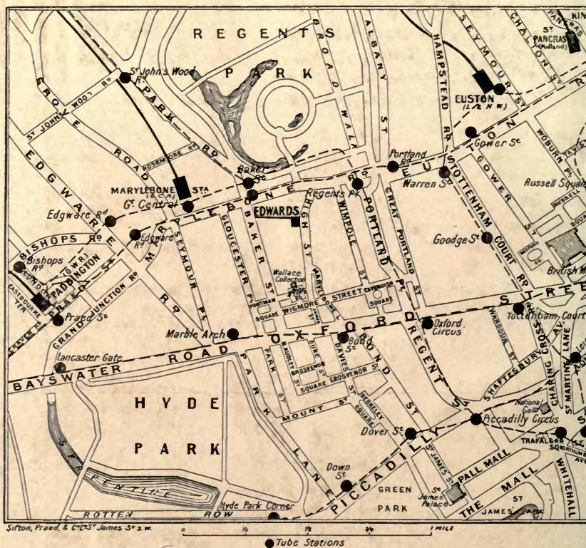
Map of a section of London showing Francis Edwards' Establishment and nearest rail and tube stations.

Prompt Cash Settlement, Removal without expense to Vendor Valuations for Fire Insurance, Family Division, &c. Practical advice given by expert Valuers.