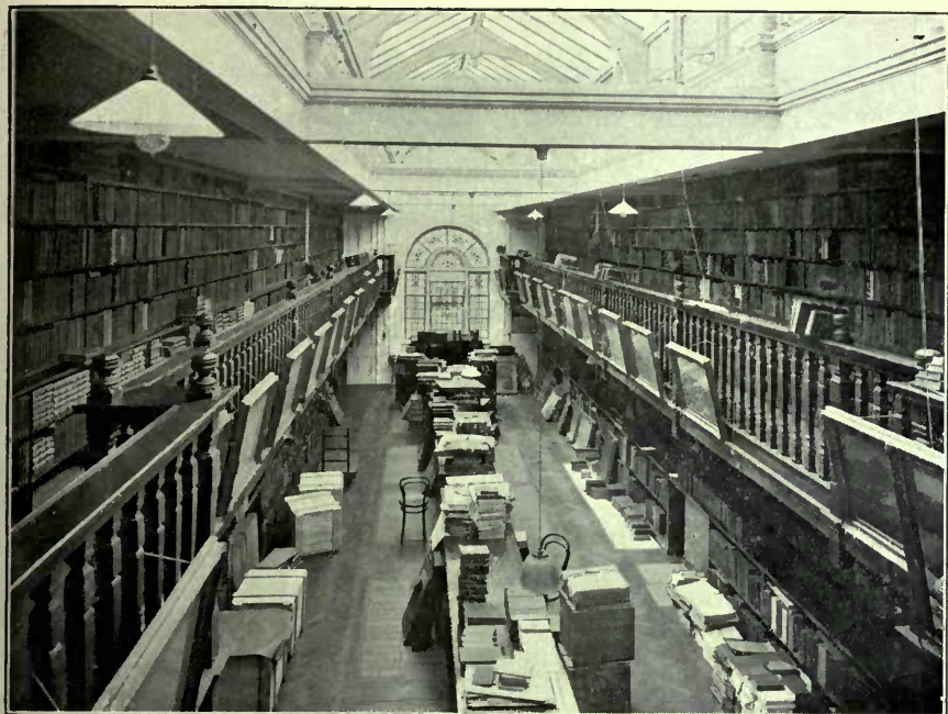
The Long Gallery from the Balcony.