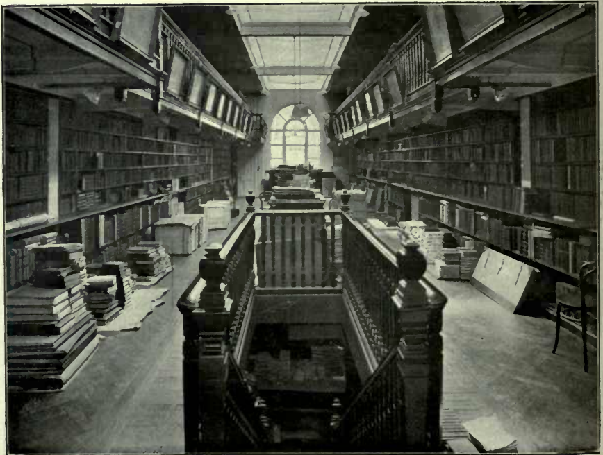
The Long Gallery from the Ground Floor.