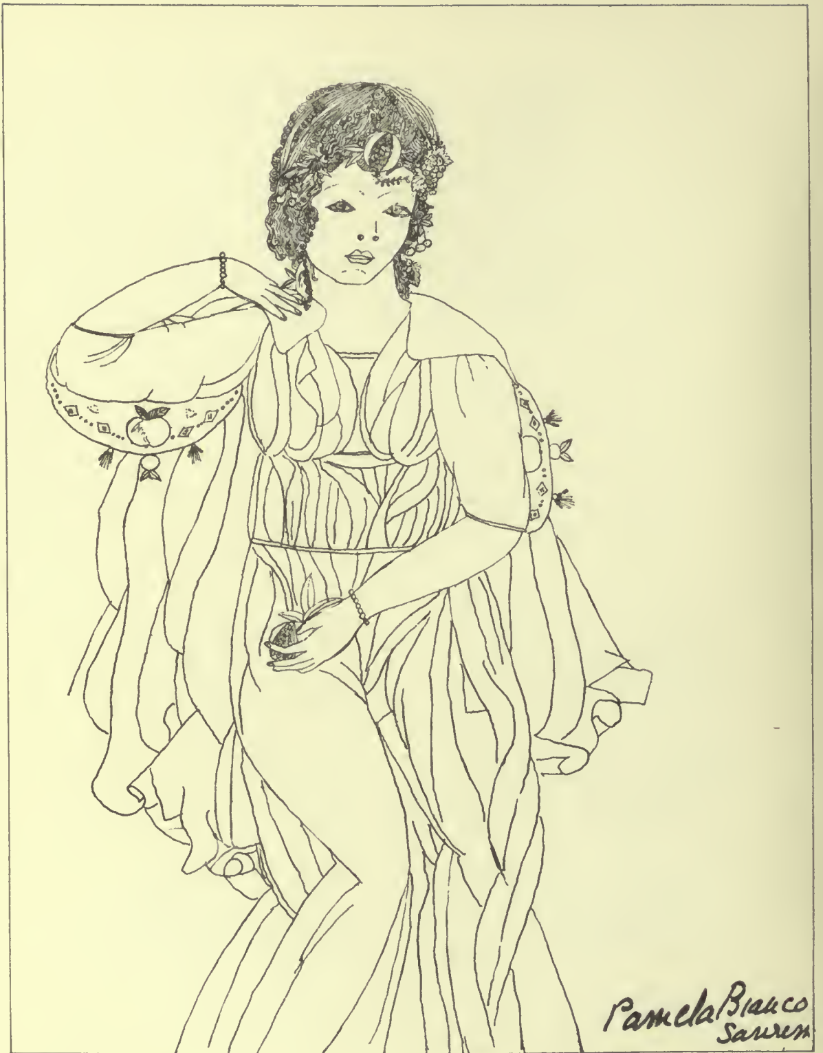
A DRAPED FIGURE SEATED.