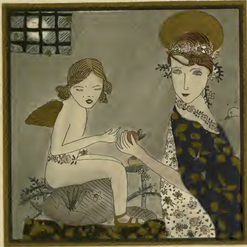
MADONNA & ANGEL.