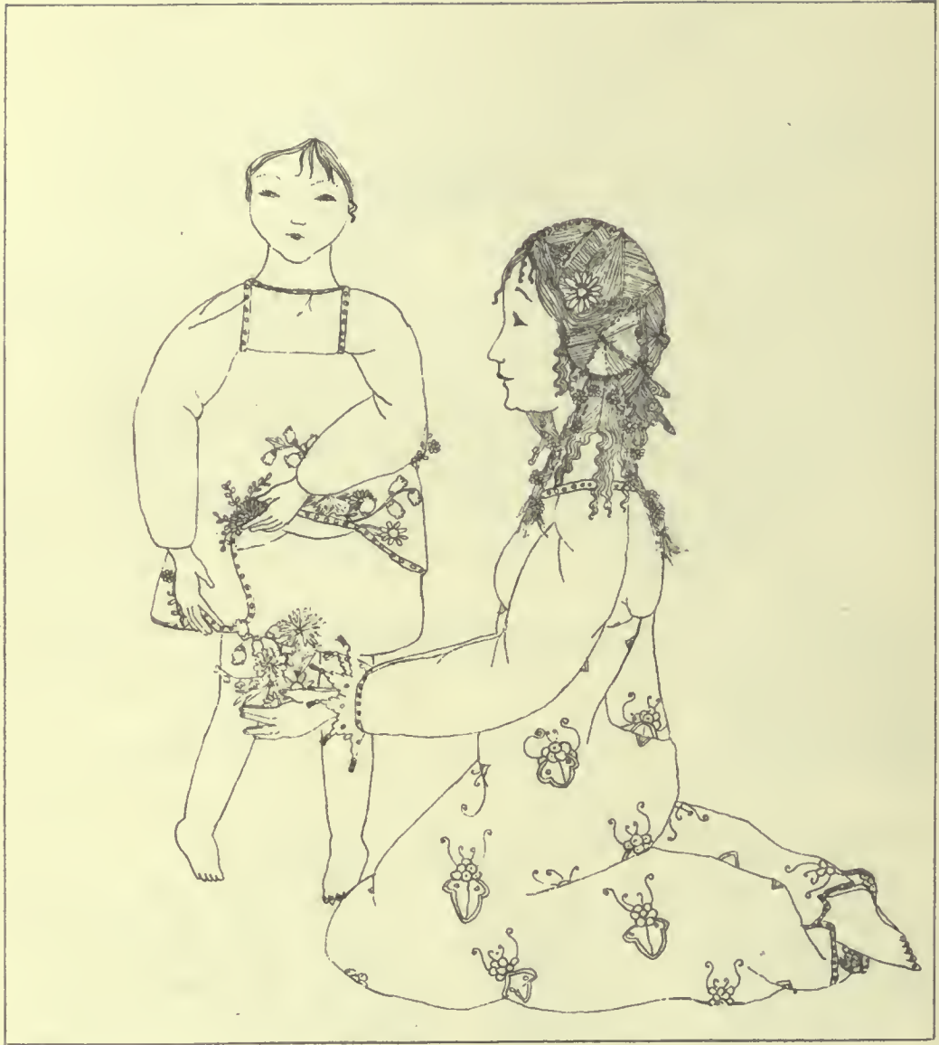
CHILDREN PICKING FLOWERS