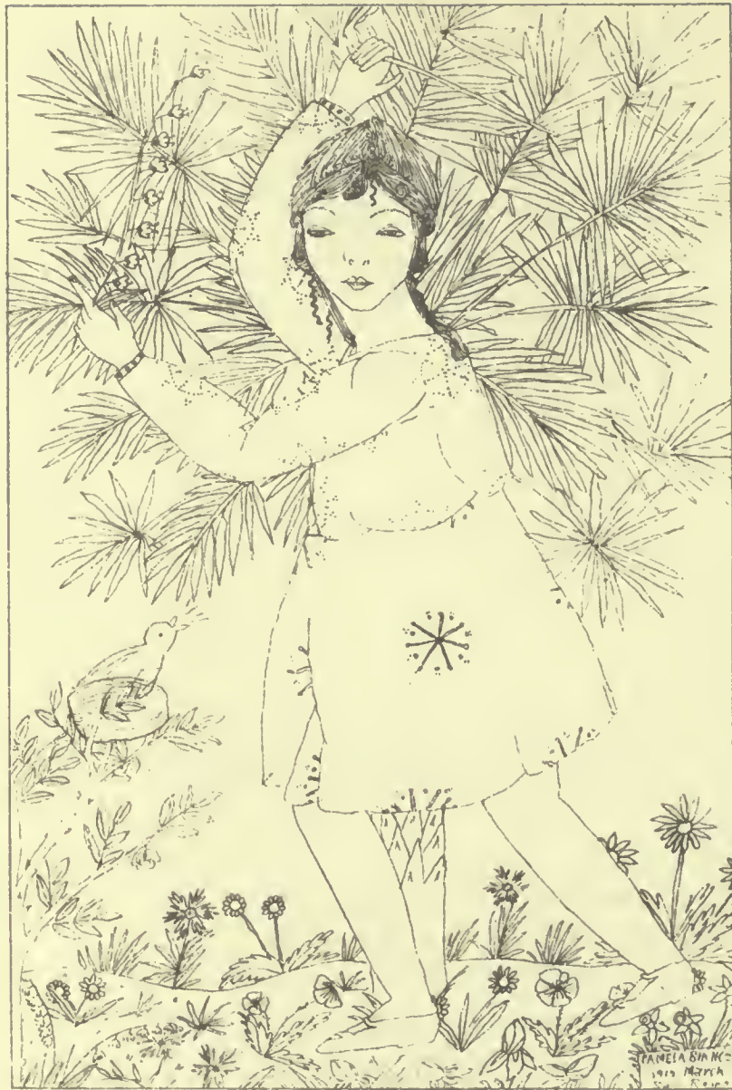
THE SINGING BIRD.