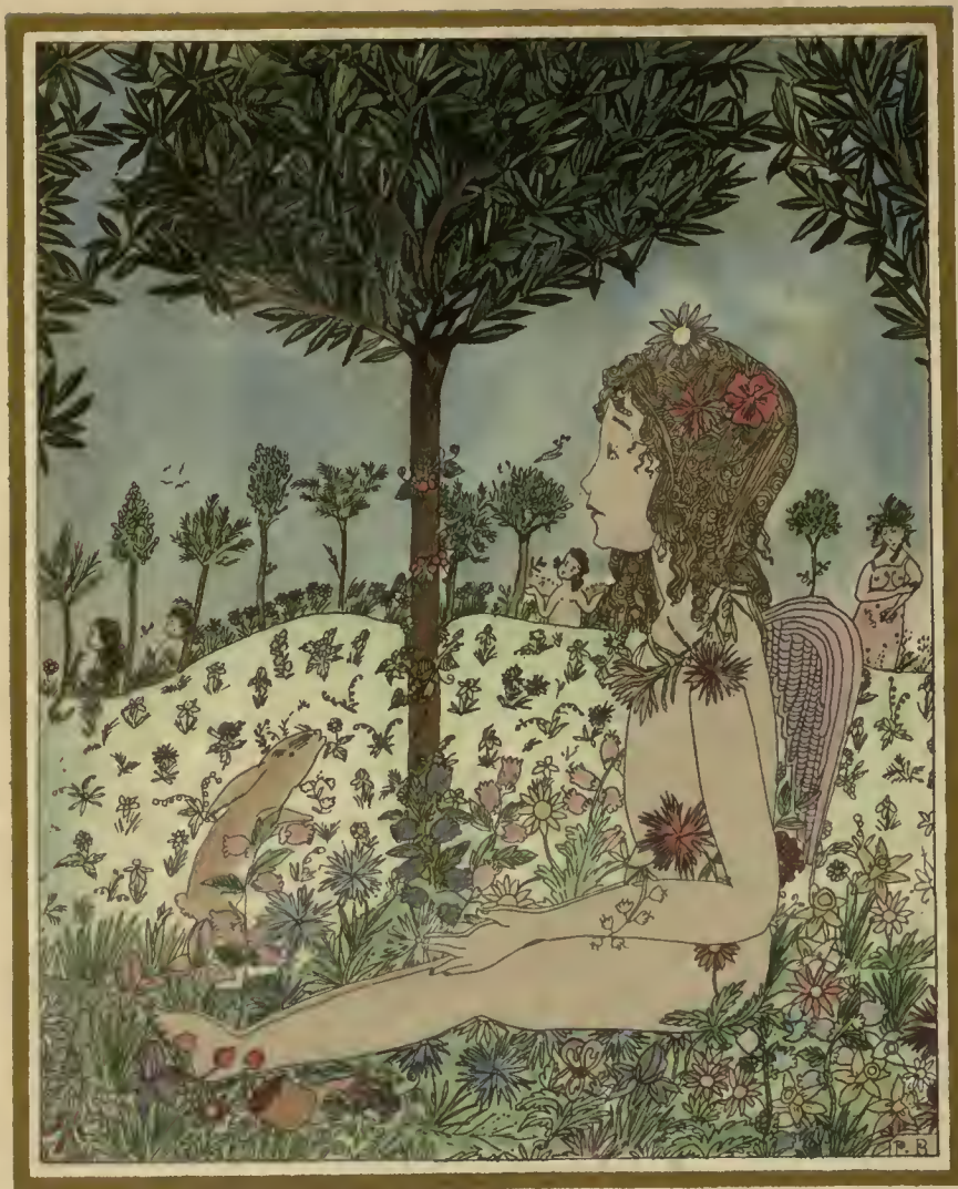
THE FLOWERY MEADOW