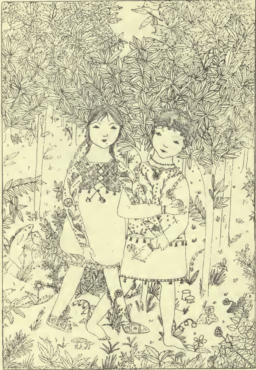
BABES IN THE WOOD.