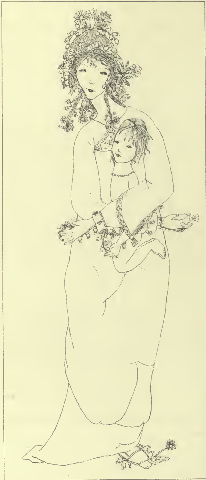
MOTHER AND BABY.