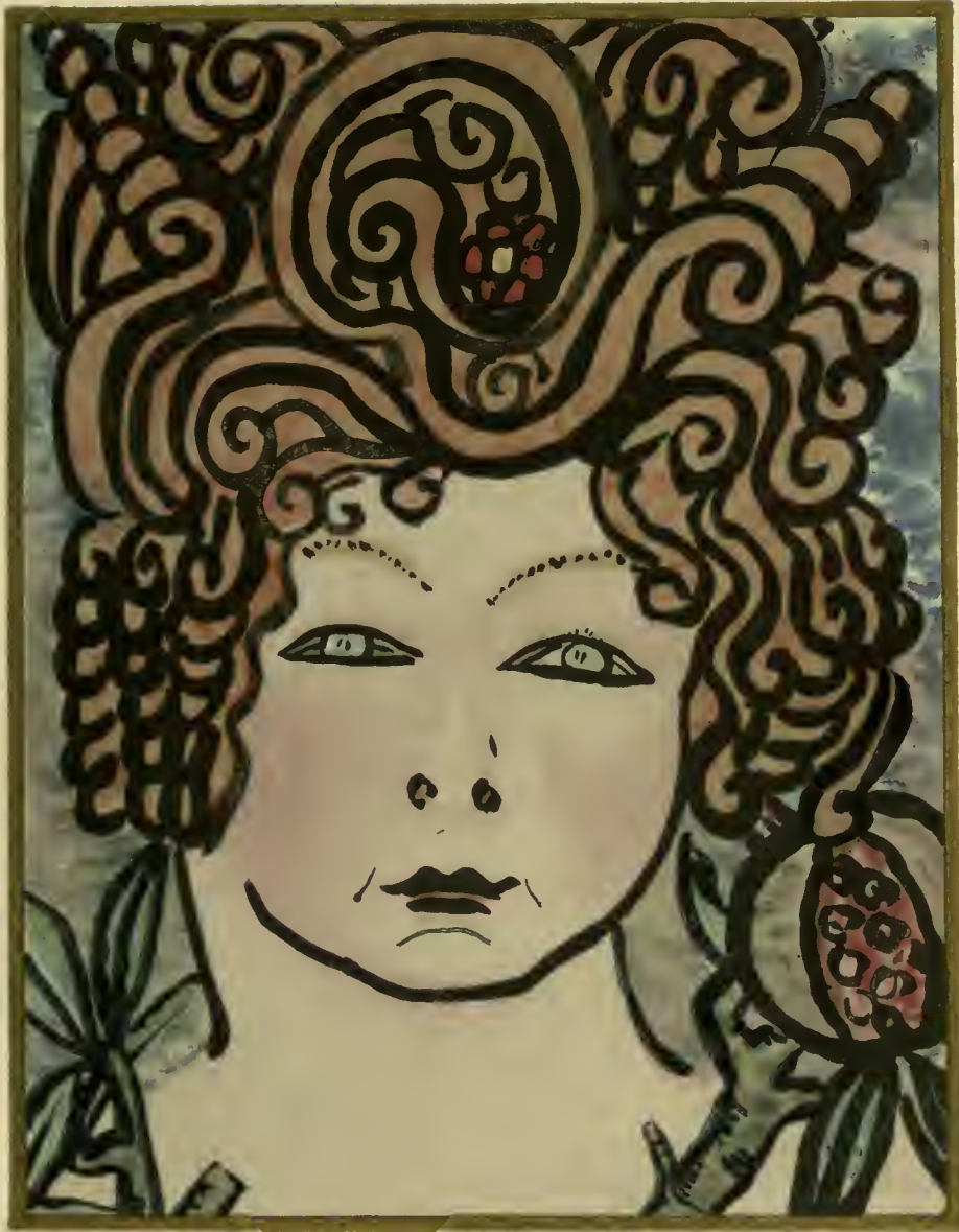
THE STRONG CHILD.