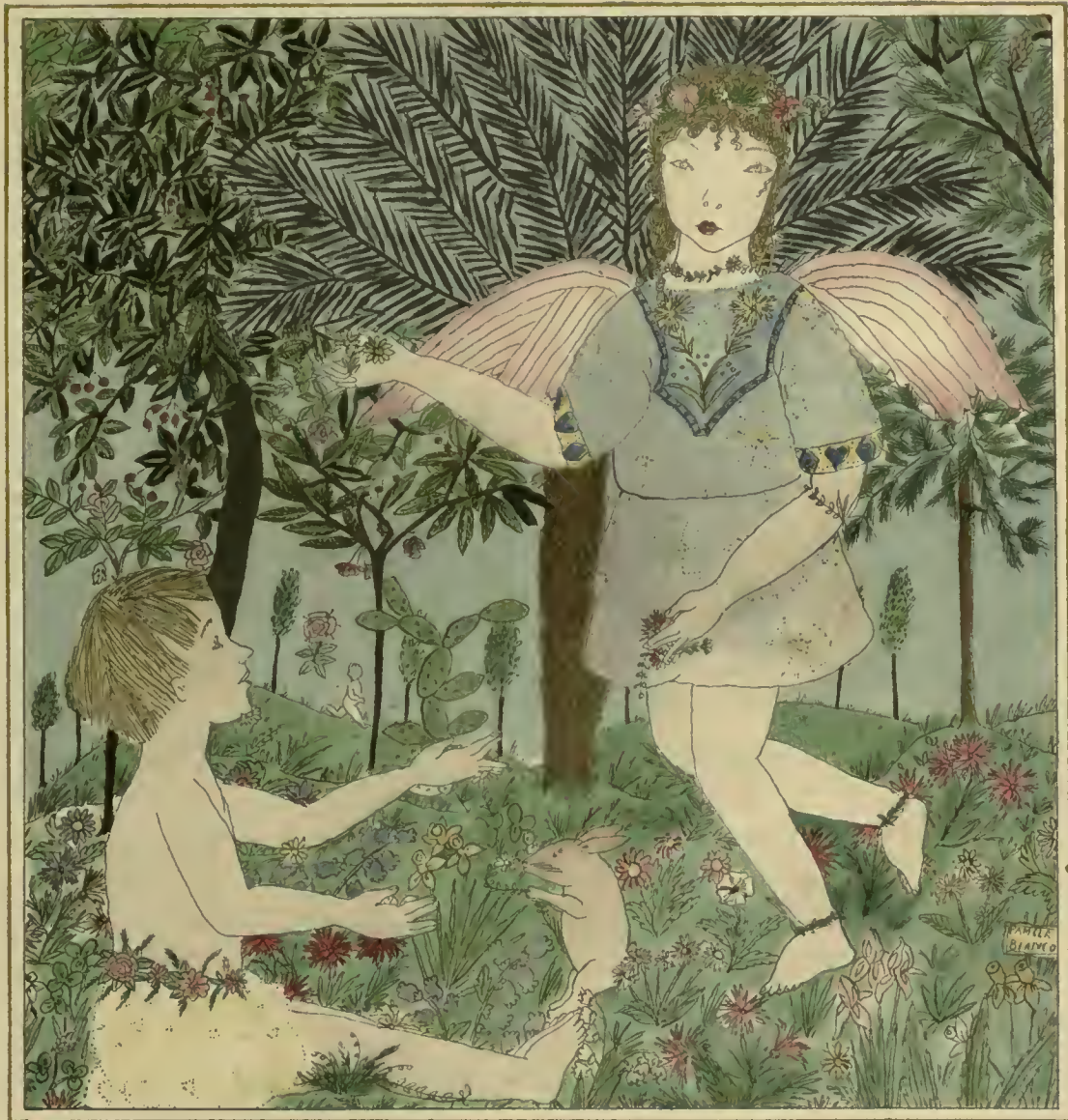
ANGEL & CHILD.