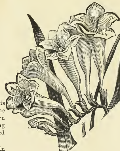
Freesia Refracta Alba.

Price, our extra strong Bermuda-grown Bulbs, $1.00 per 100; $9.00 per 1,000. In 5,000-Lots at $8.00 per 1,000.