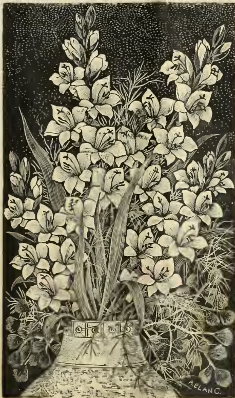
Gladiolus, "The Bride."

Now being extensively used for forcing for cut flowers, as they are very beautiful and very easily forced. For early flowering should be planted in 5 or 6 inch pots, 5 to 7 bulbs in each, and placed in cold frames or plunged out of doors until rooted, as with other bulbs; when growth begins, remove to greenhouse, at temperature of about 55°, and, with successive lots, can be had in bloom constantly. For late flowering, can be planted in cold frames, needing only the protection of sash, as they are nearly hardy. Grown in this way they will bloom in June, giving a most beautiful crop of flowers, very profitable. Price $1.50 per 100; $12.00 per 1,000.