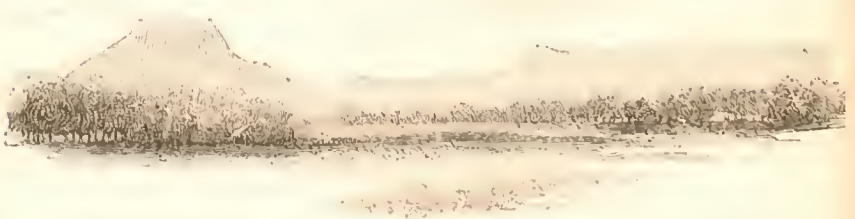
Campbell's Peak, N. 75° W.