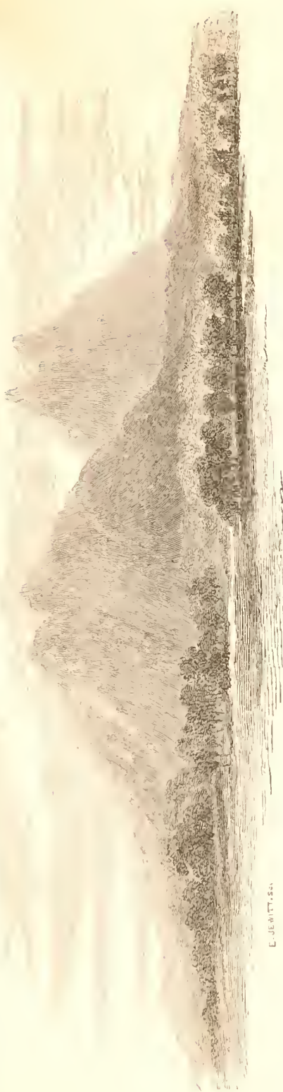
Red Mountain. Sandstone. Roper's Peak. Scott's Peak.

All these peaks are composed of Domite; and Roper's and Scott's Peaks are surrounded by a sandstone formation, covered with a dense low scrub.